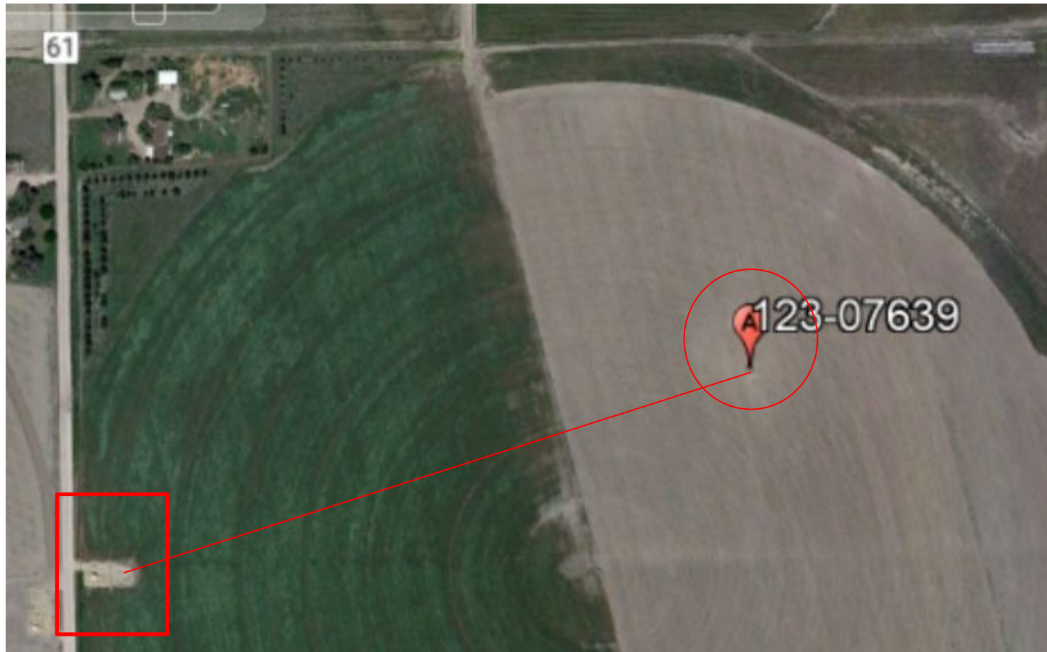
Photo 1. Google Earth aerial imagery taken 6/2016 during active operations. Photo illustrates the well locations (red circle) and tank battery (red rectangle).