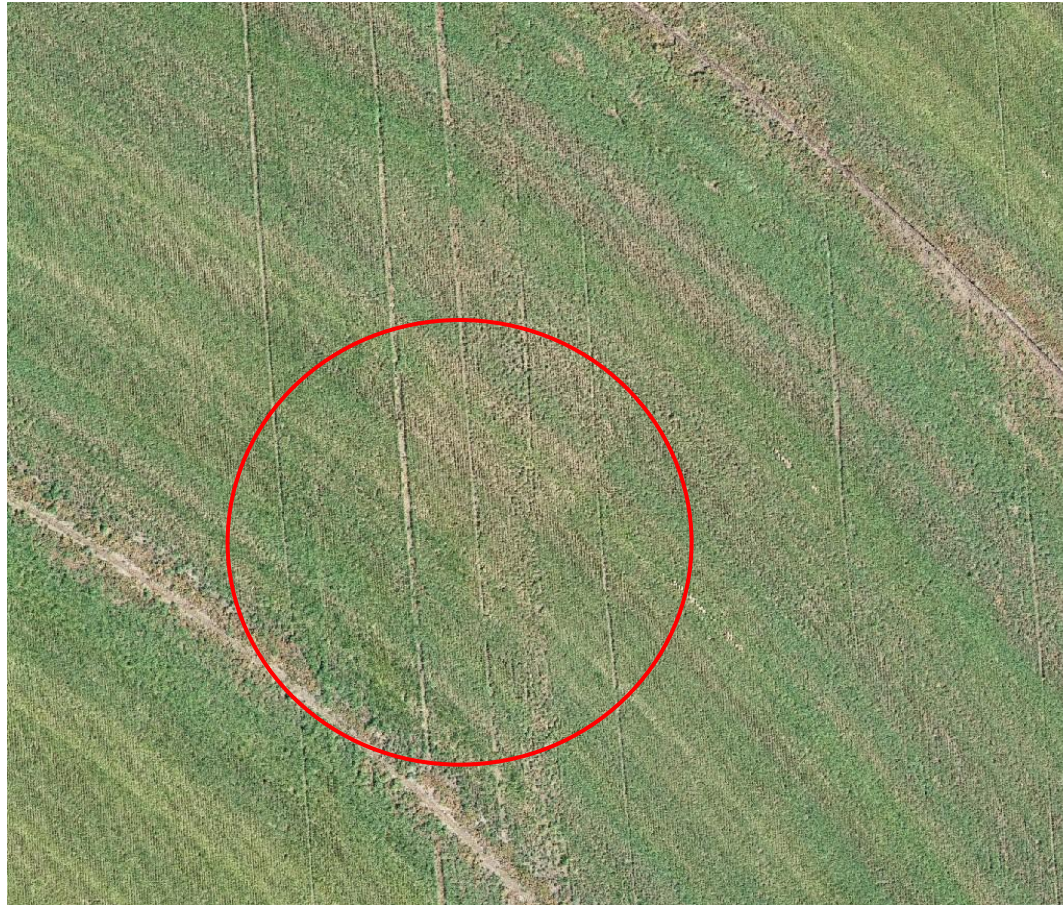
Photo 4. Zoomed in Orthomosaic drone aerial imagery taken from 200 ft (Sept. 2022). Illustrates growth on and around the well location (red circle). Appears similar to rest of area, however crop height cannot be fully evaluated. Another inspection is required when crop is actively growing.