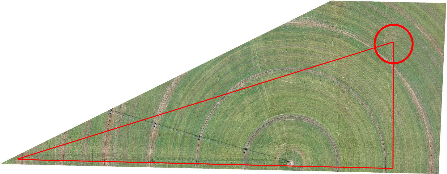
Photo 3. Orthomosaic drone aerial imagery taken from 200 ft (Sept. 2022). Illustrates growth on and around the well location (red circle) and approximate flowlines (red lines). Tank battery addressed in Location 328608 report.