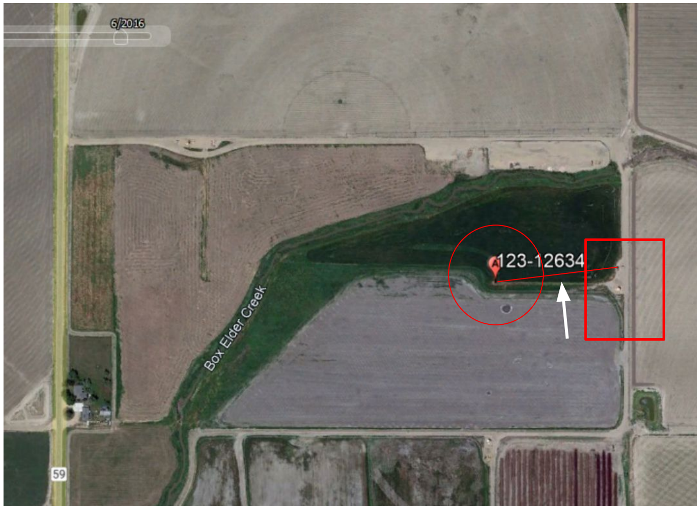
Photo 1. Google Earth aerial imagery taken 6/2016 during active operations. Photo illustrates the well location (red circle), tank battery (red square), flowline (red line), and well location access road (white arrow).