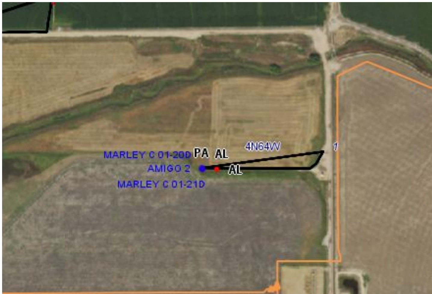
Photo 2. COGCC Online Map aerial imagery 2019 with related wells (red dots), subject well (blue dot), tank battery (near 1) and flowlines (black lines). Flowline abandonment/removal not submitted.