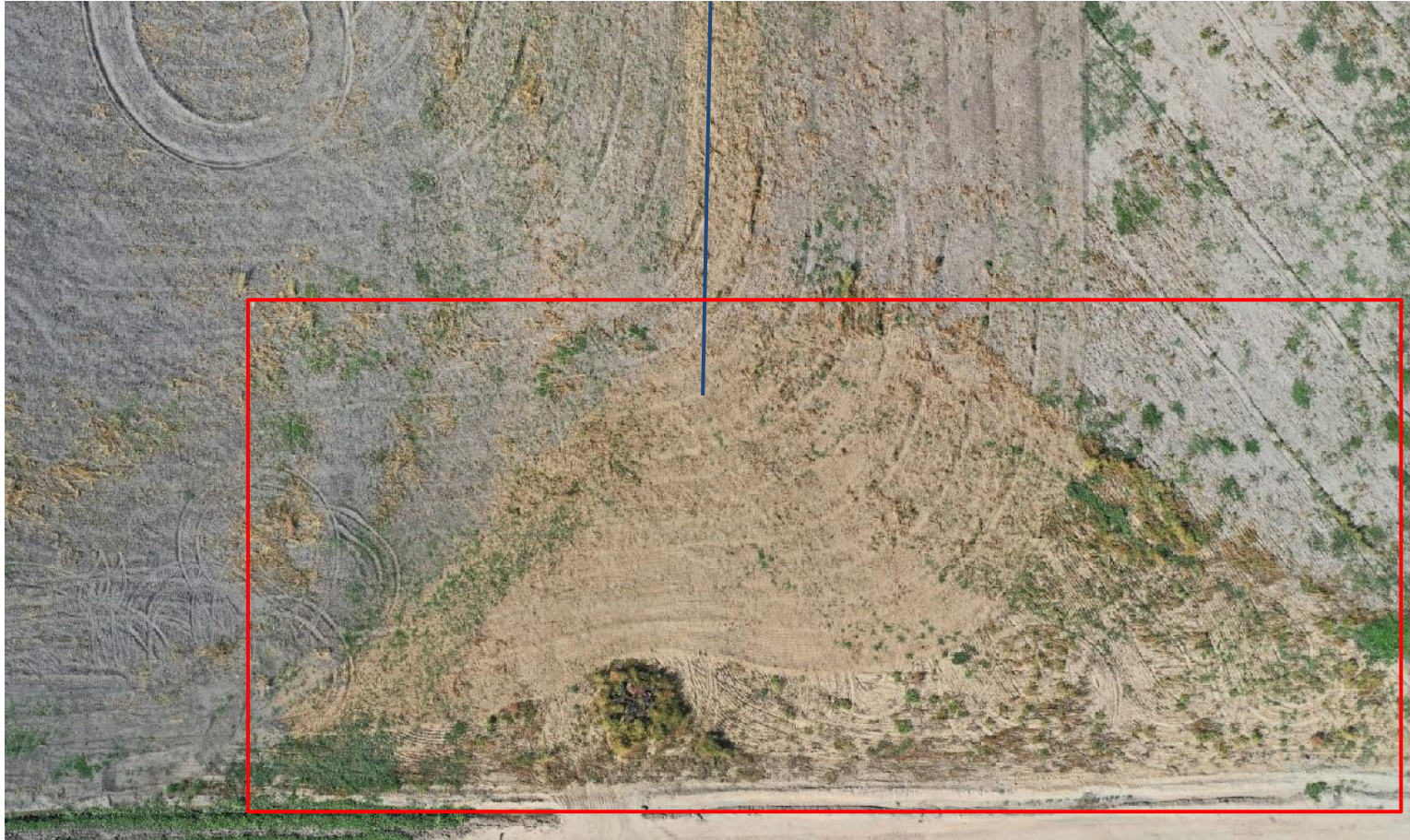
Photo 5. Zoomed in Orthomosaic drone aerial imagery taken from 200 ft (Sept 2022). Illustrates lack of growth on and around the tank battery (red rectangle) and access road (blue line).