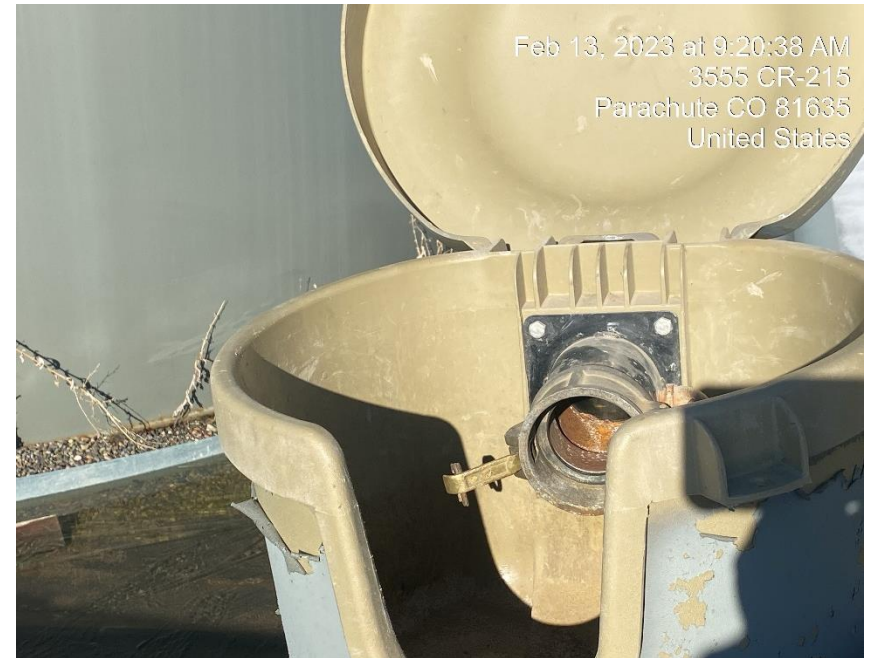
Open end loadline.