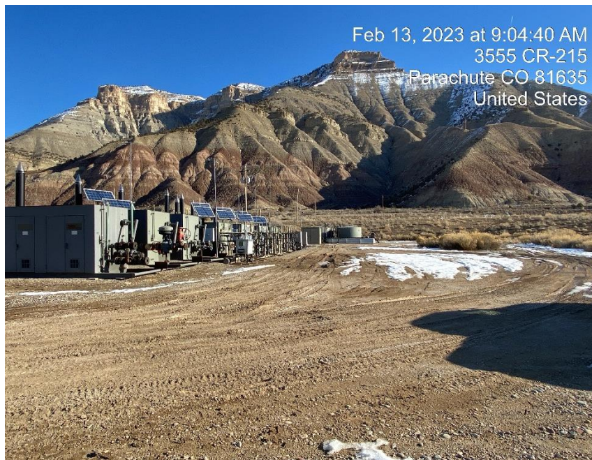
Entrance to production facility.