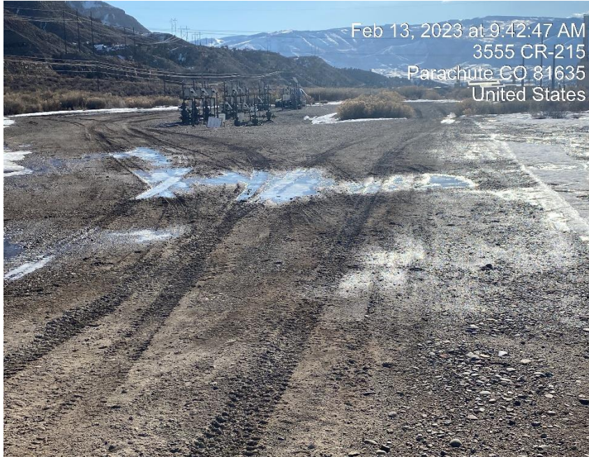
Entrance to well pad.