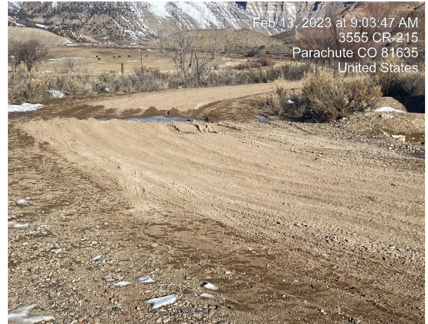
Exit from Production pad.