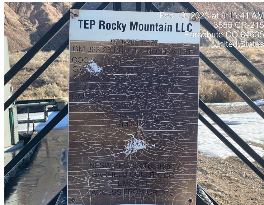
Illegible tank battery sign.