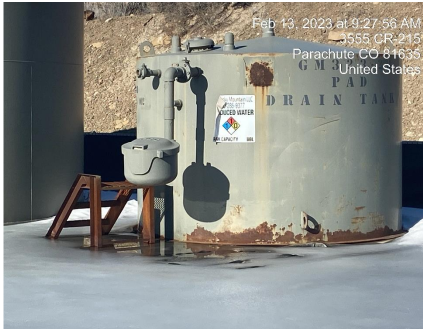
Unidentified tank capacity.