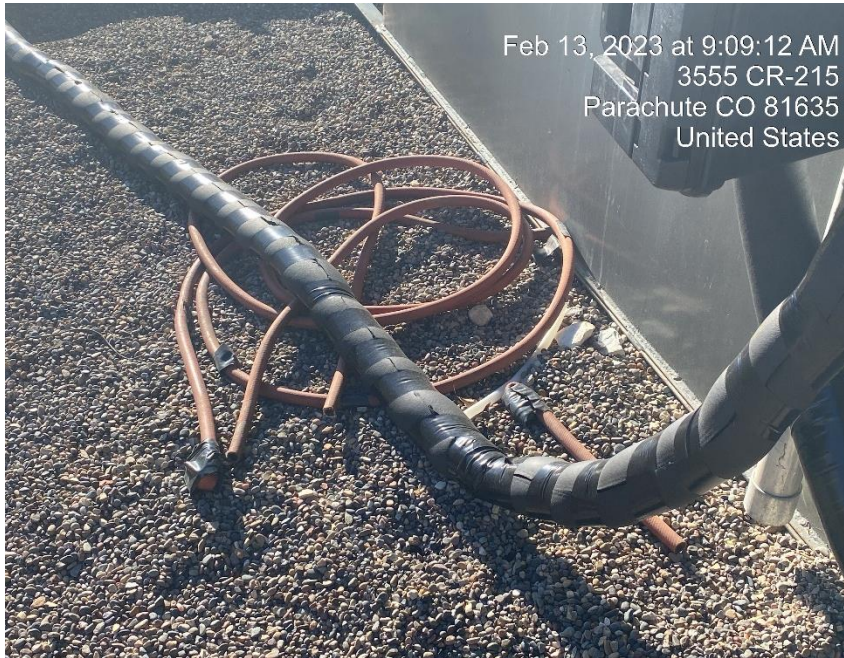
Debris at separators.