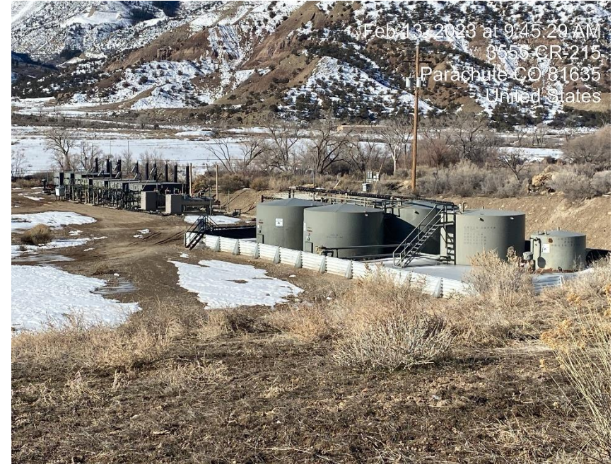
Well pad to production facility.