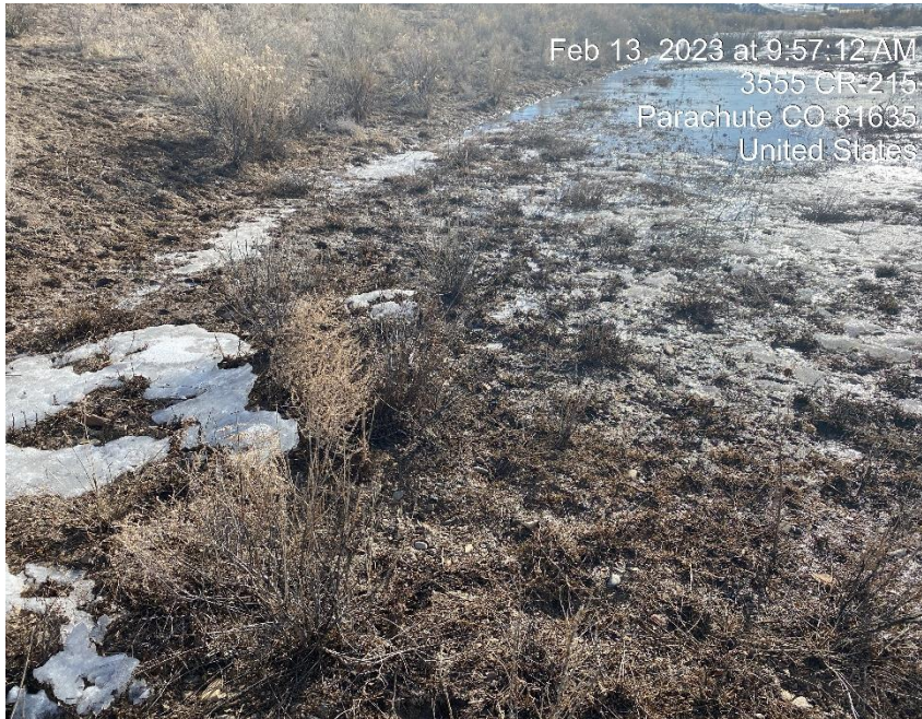
Limited Stormwater BMP.