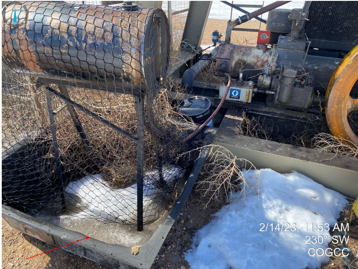
Photo 13. Facing southwest at one of the pump jacks. Wildlife netting is not adequate and/or properly installed.