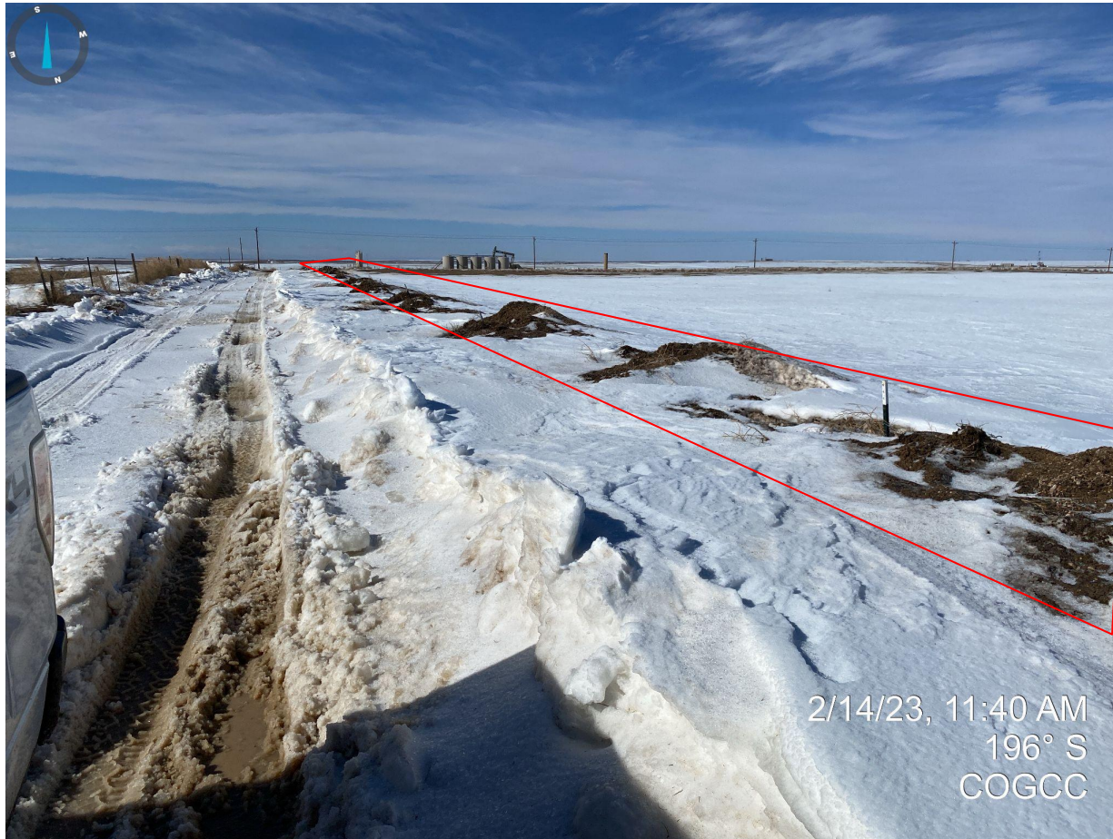
Photo 1. Facing south from the access road to the location. It appears the road has drifted in and been plowed. Any material inadvertently removed from the access road shall be placed back to its relative position once snow has melted to prevent off-site degradation to adjacent lands. No CA is being issued at this time.