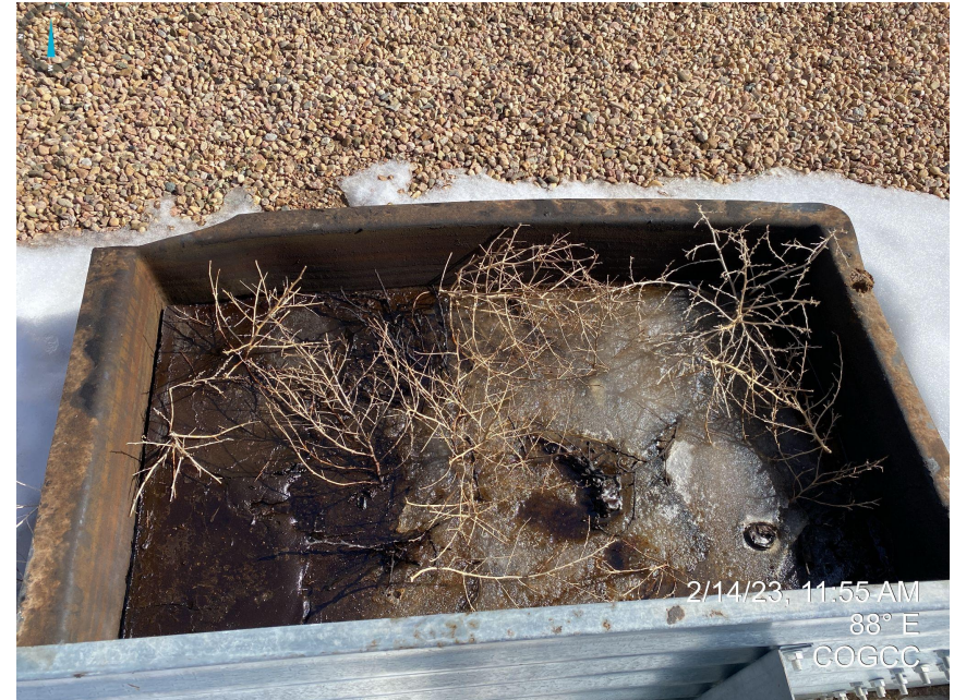
Photos 14 & 15. Facing northwest and east at the tank battery. Photos illustrates oil stained soil (left) and oily waste (right) that needs to be properly disposed of.