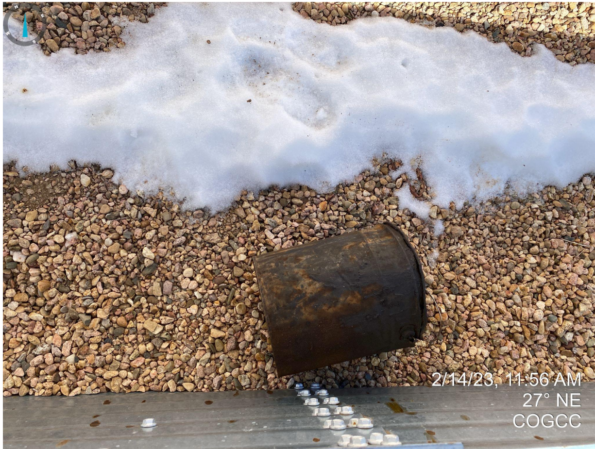
Photo 18. Debris observed within containment area of tank battery that will need to be removed.