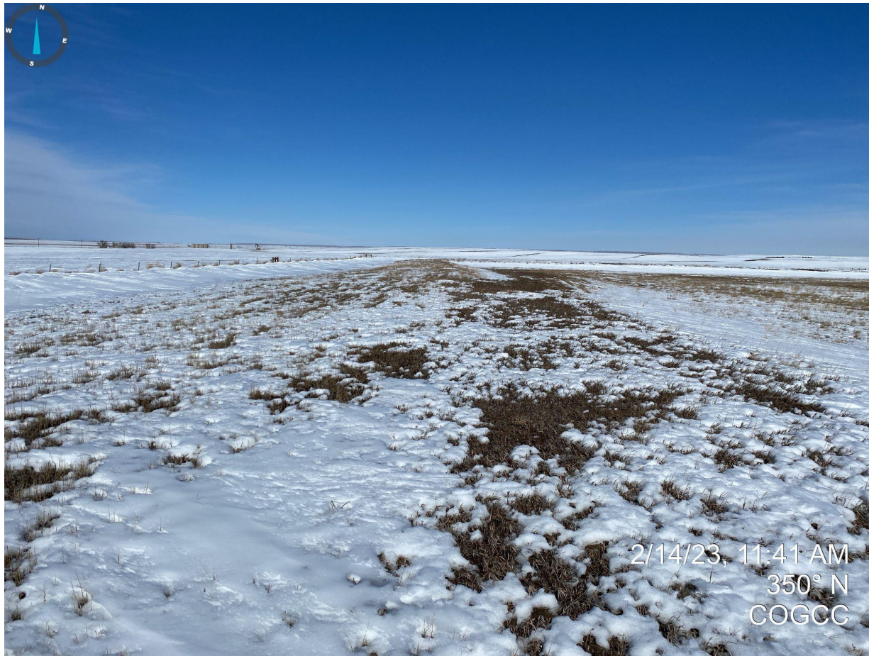
Photo 2. Facing north from the interim areas. Due to snow cover, this location will be inspected at a future date to ensure compliance with Rule 1003 standards.