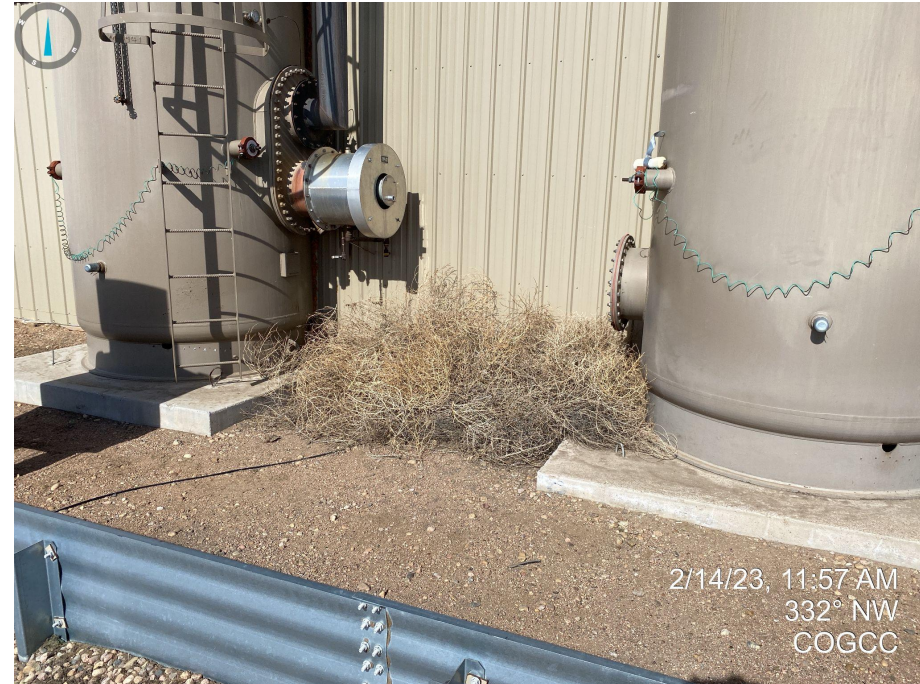
Photos 10 & 11. Facing southeast at combustor and northwest at treaters. See comments in Photos 5 & 6.