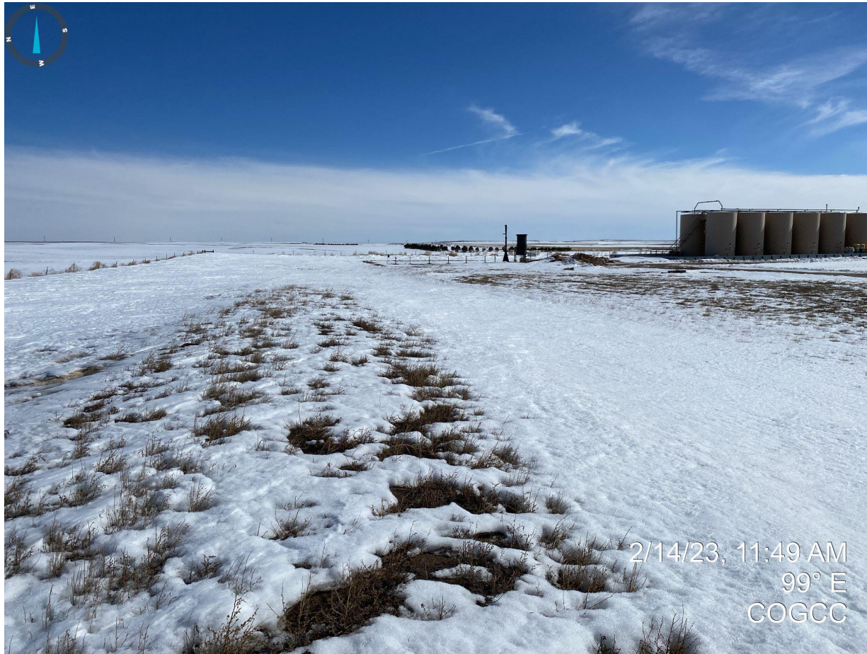
Photo 3. Facing east from the topsoil stockpile on the northern portion of the location; see comments in Photo 2.