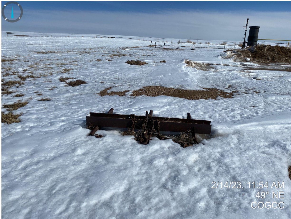
Photo 19. Facing northeast near combustor. Road maintainer being stored on location and will need to be removed. As a reminder, locations are not to be used as storage or lay-down yards.