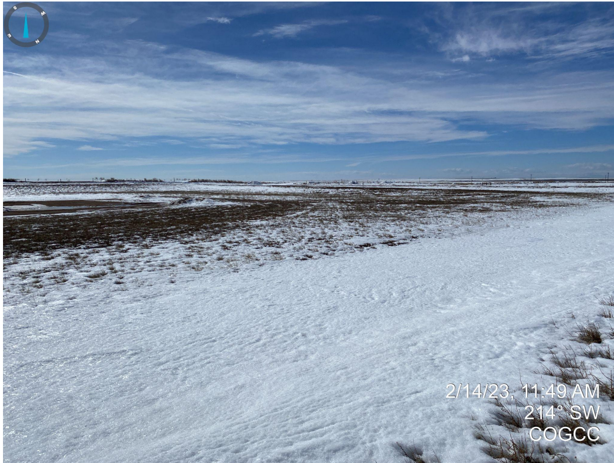
Photo 4. Facing southwest from topsoil stockpile area; see comments in Photo 2.