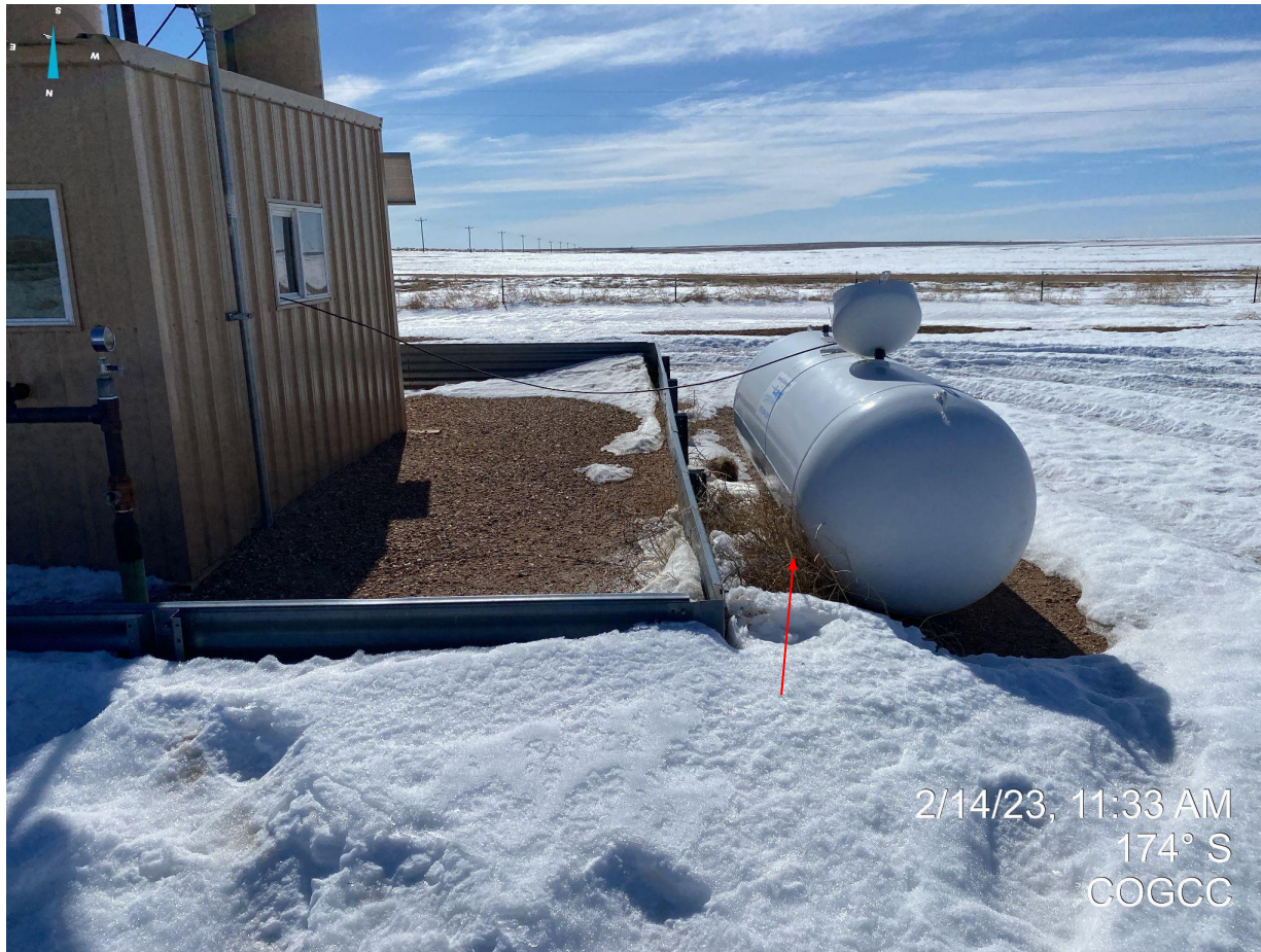
Photo 7. Facing south at treater/gauge station; see comments in Photo 6.