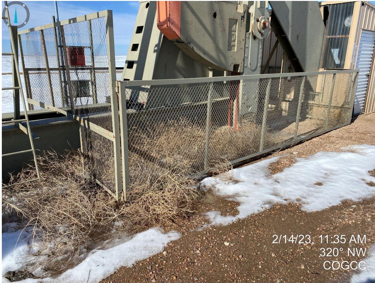
Photo 9. Facing northwest at the pump jack; see comments in Photo 6.