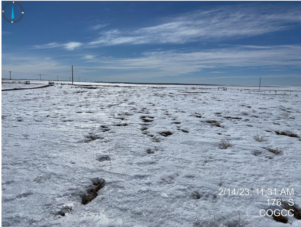
Photo 2. Facing south from the western interim reclamation area. Due to snow cover, Staff was unable to verify vegetation and the location will need to be inspected at a future date to ensure compliance with Rule 1003 standards.