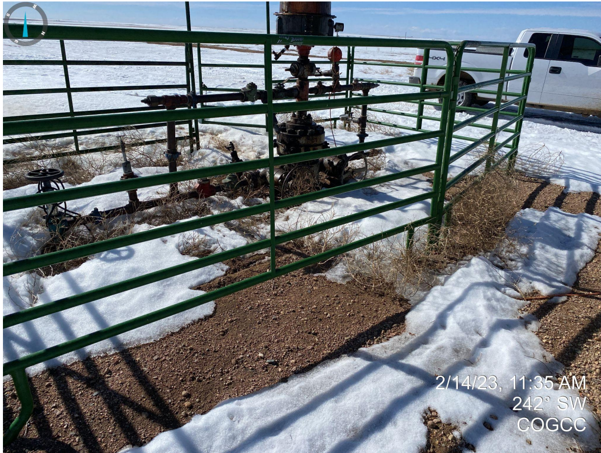
Photo 10. Facing southwest at the wellhead; see comments in Photo 6.