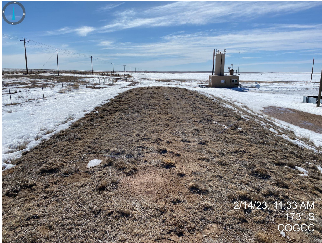
Photo 5. Facing south from on top of the topsoil stockpile. Photo illustrates some desirable vegetation (e.g. buffalo grass) was observed during this inspection and the location will be inspected at a future date to verify vegetation standards in accordance to Rule 1003.