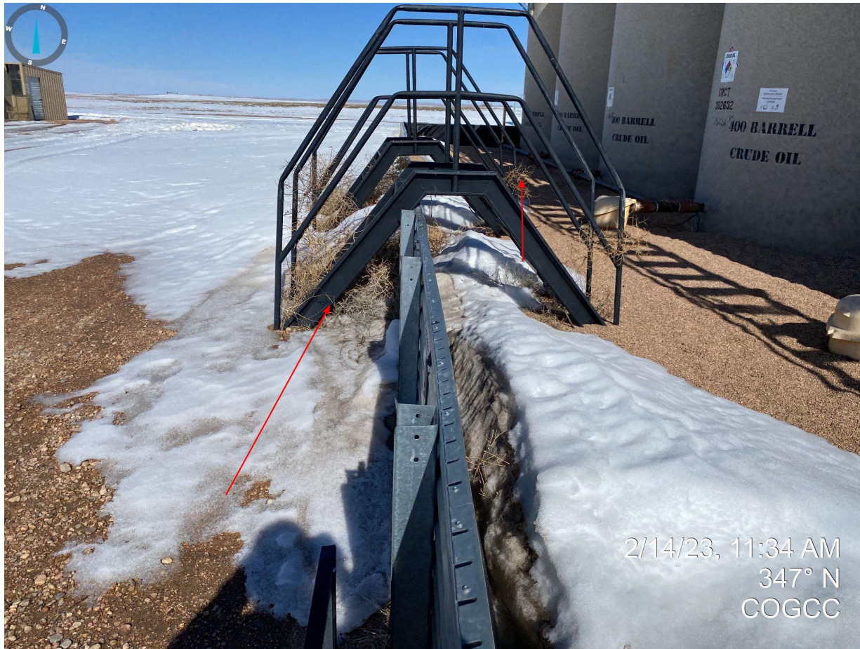
Photo 8. Facing north at the tank battery; see comments in Photo 6.