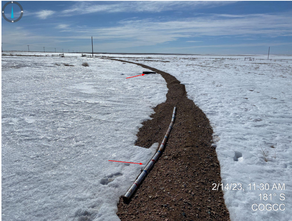
Photo 1. Facing south from the center of location; Debris was observed on location (e.g. tire and pipe) that will need to be removed.