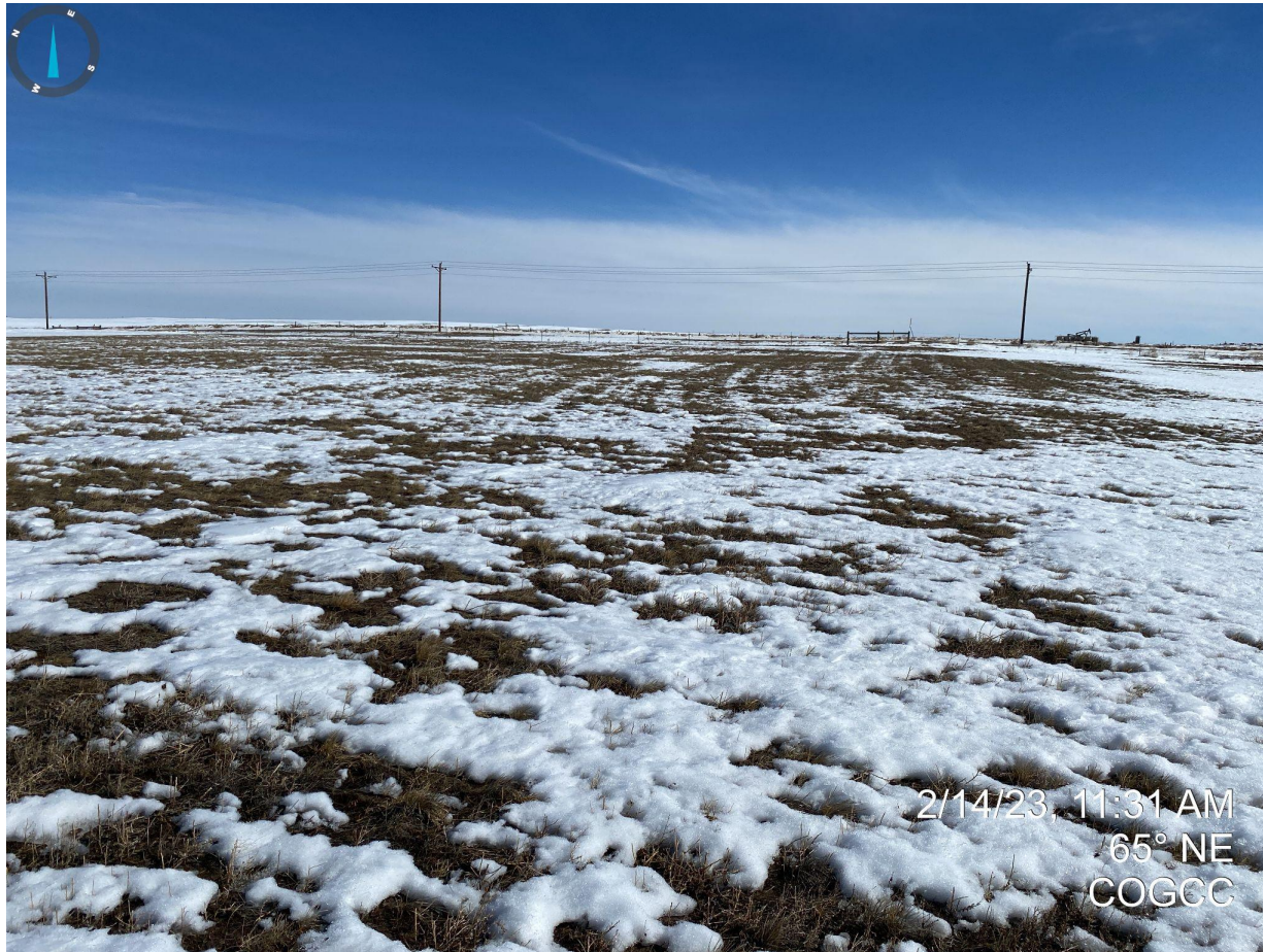
Photo 4. Facing northeast at the former/reclaimed pit; see comments in Photo 2.