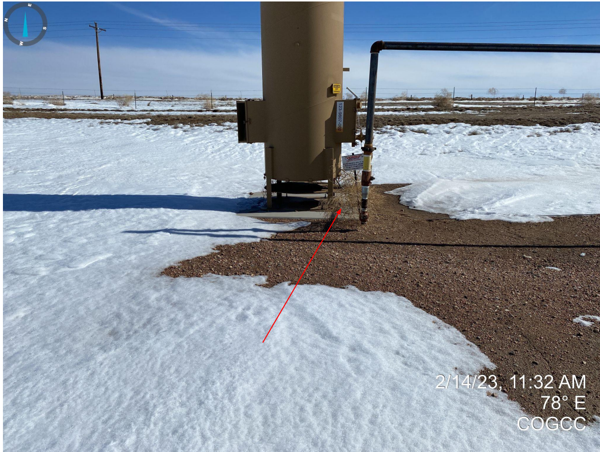
Photo 6. Facing east at combustor; tumbleweed accumulations were observed near and around equipment and are considered debris. The operator will need to remove this potential fire hazard.