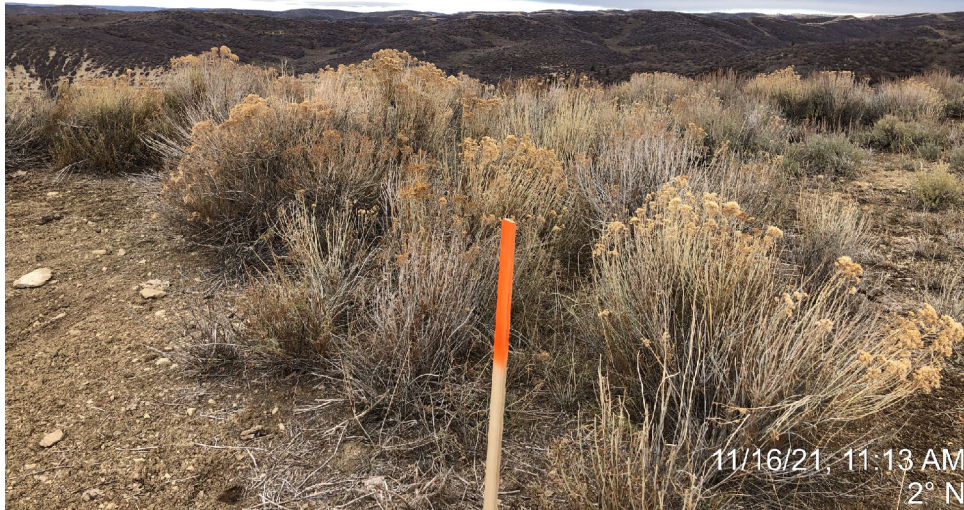
Pad Center Looking North