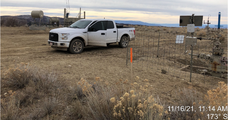
Pad Center Looking South