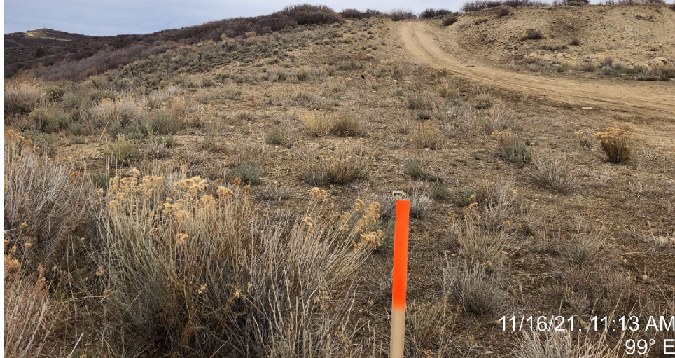
Pad Center Looking East