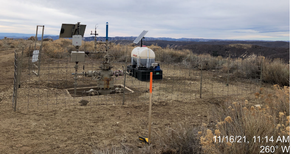
Pad Center Looking West