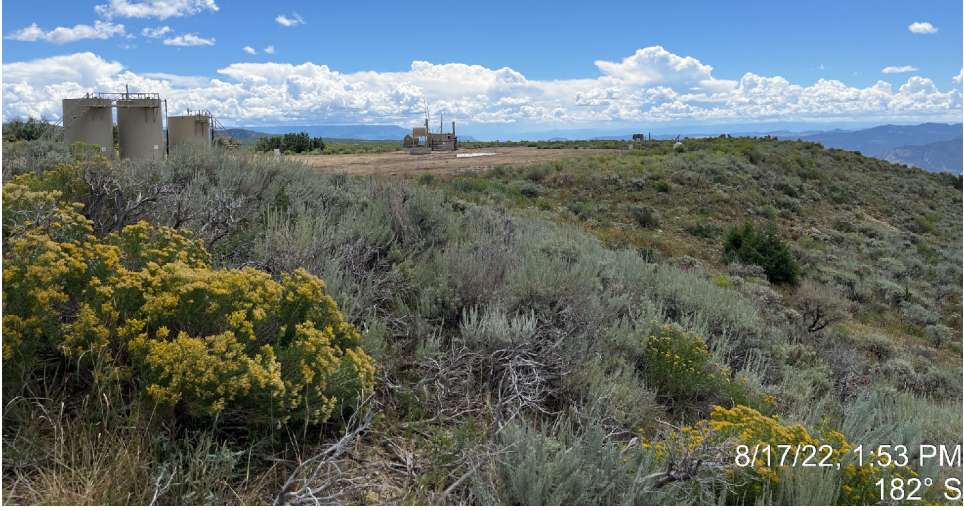
Project Access Road