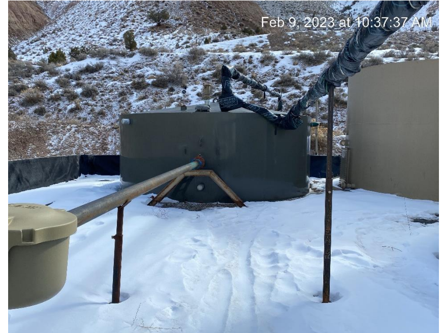
Unidentified tank in service