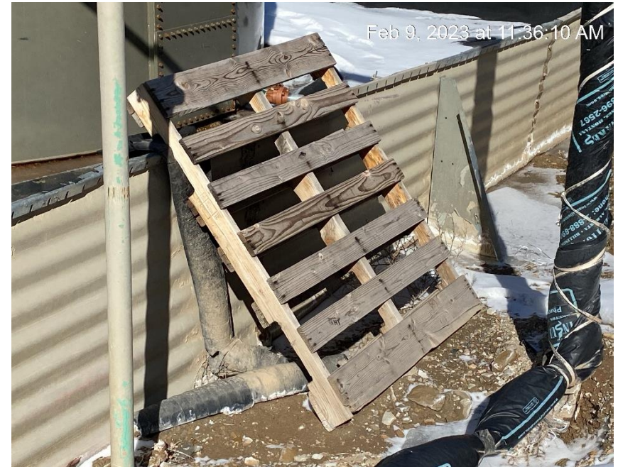
Random debris behind tank battery containment