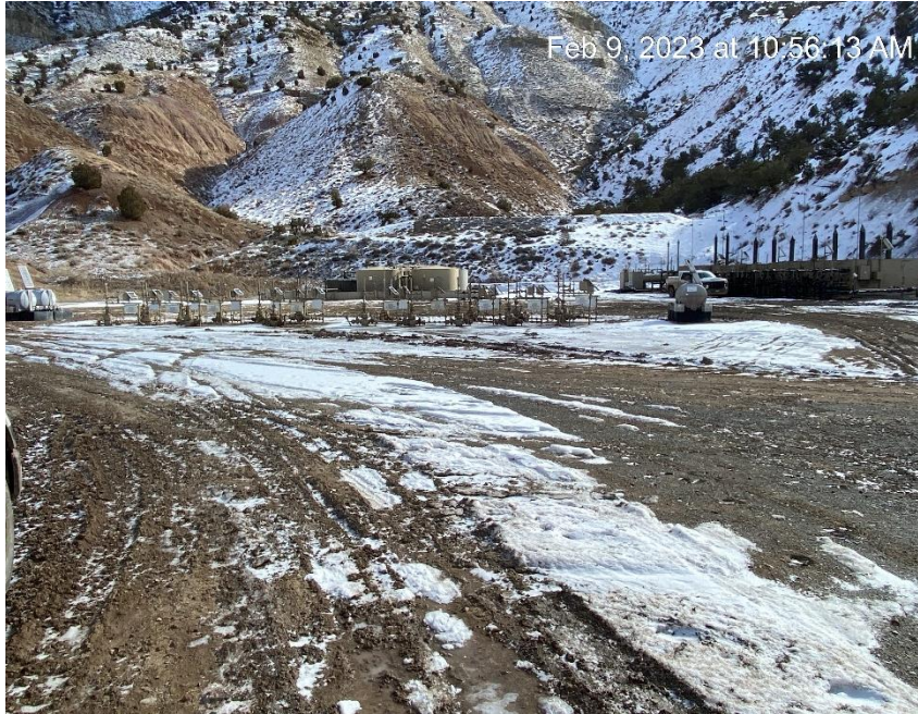
Entrance to location