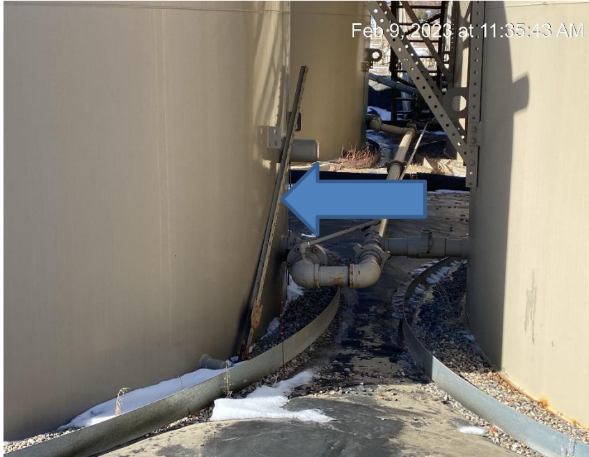
Debris against tank