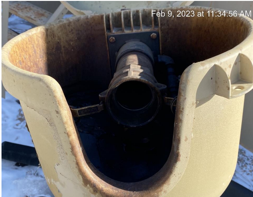
Open end loadline