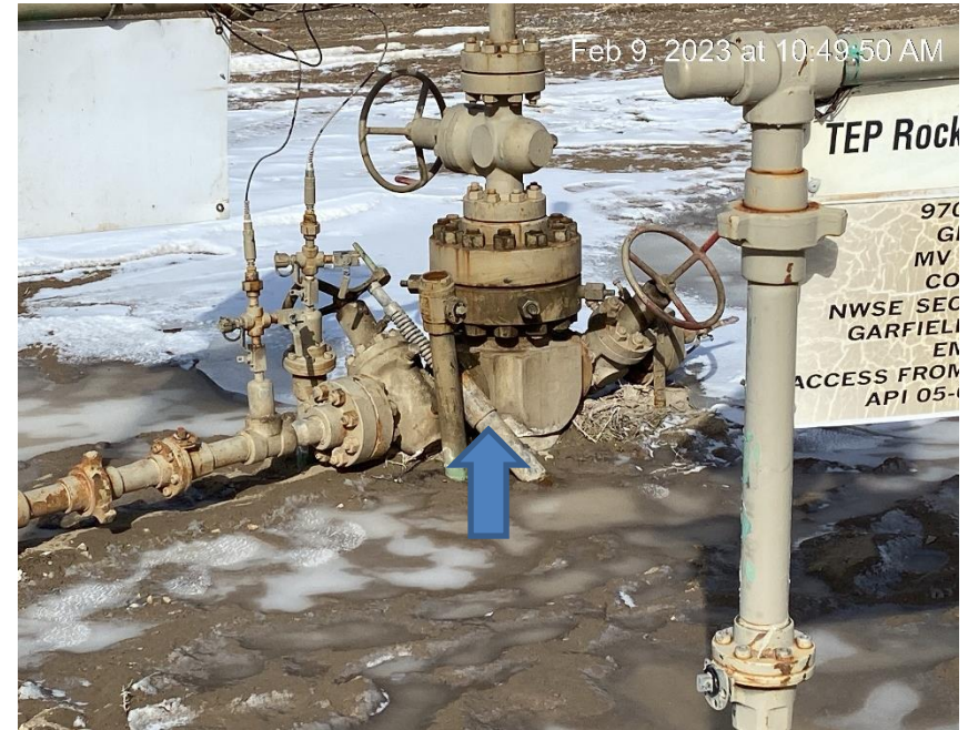
Debris around wellheads