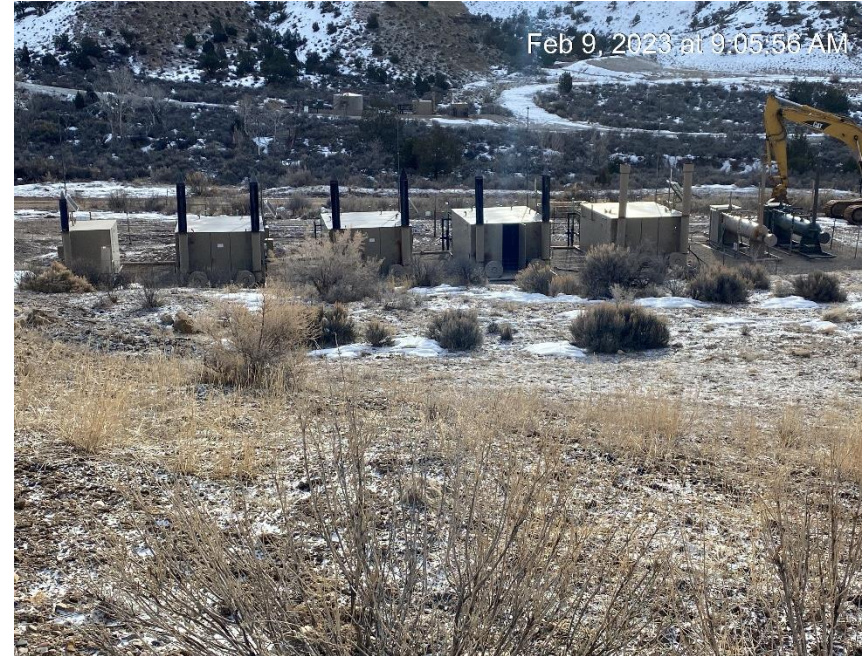
From well pad