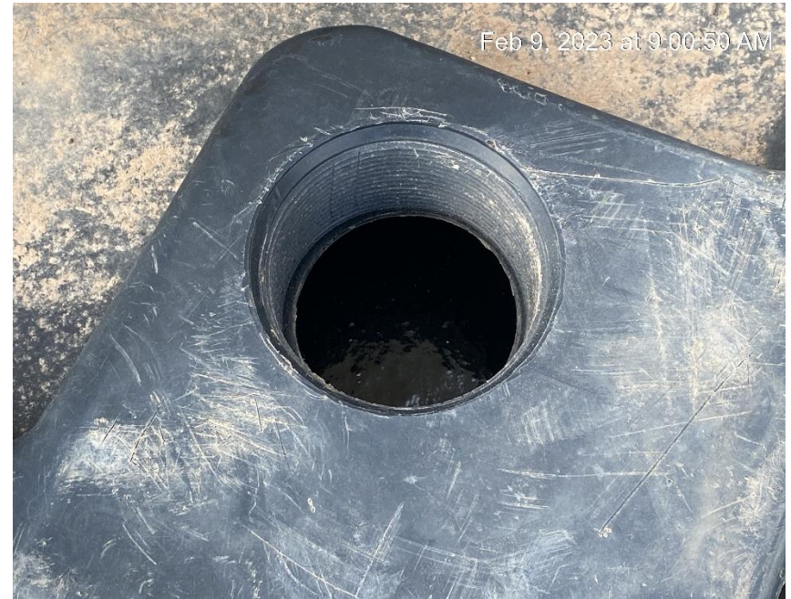
Chemical containment full of liquid