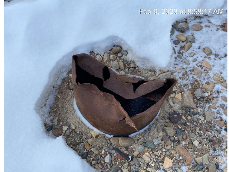
Northern exposed mousehole