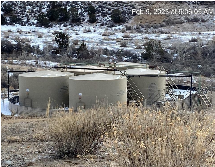
From well pad