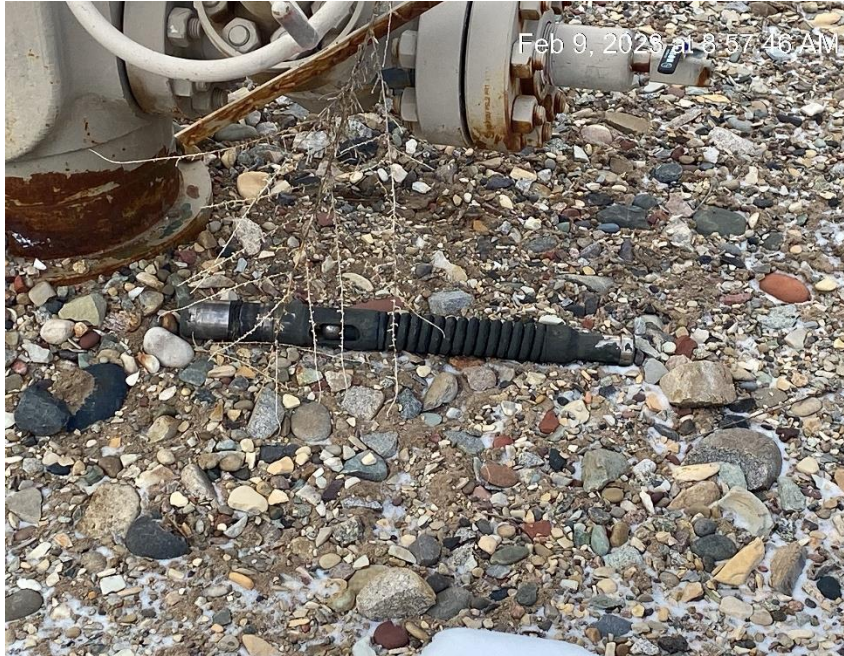
Random debris around several wellheads