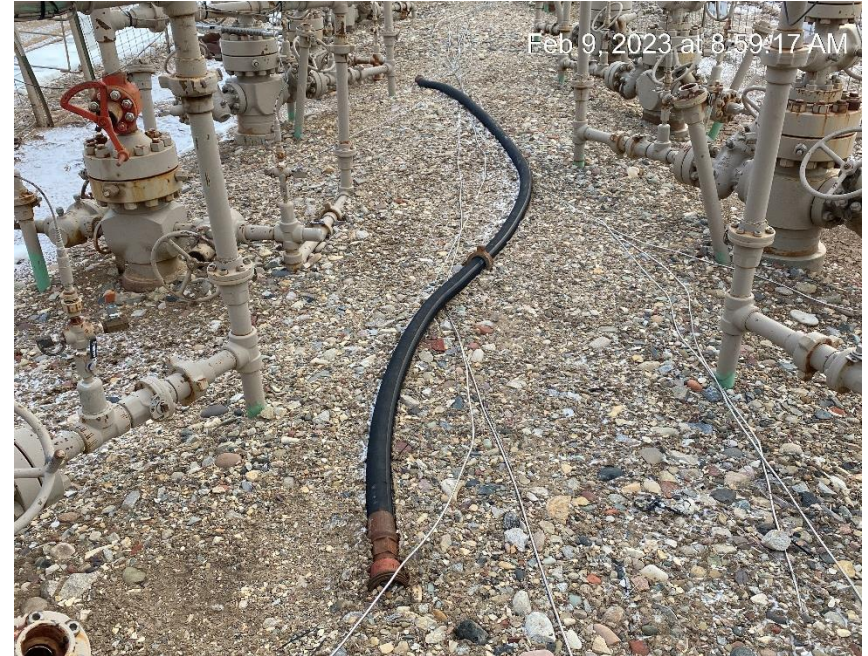
Random debris around wellheads including piping