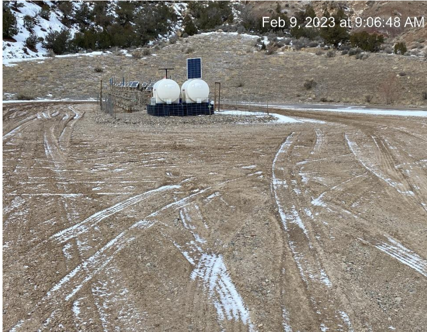
Entrance to location