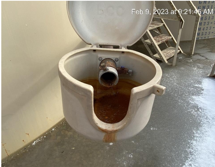
Open end loadlines on condensate and produced water tanks