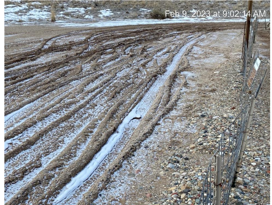
Lack of stabilization