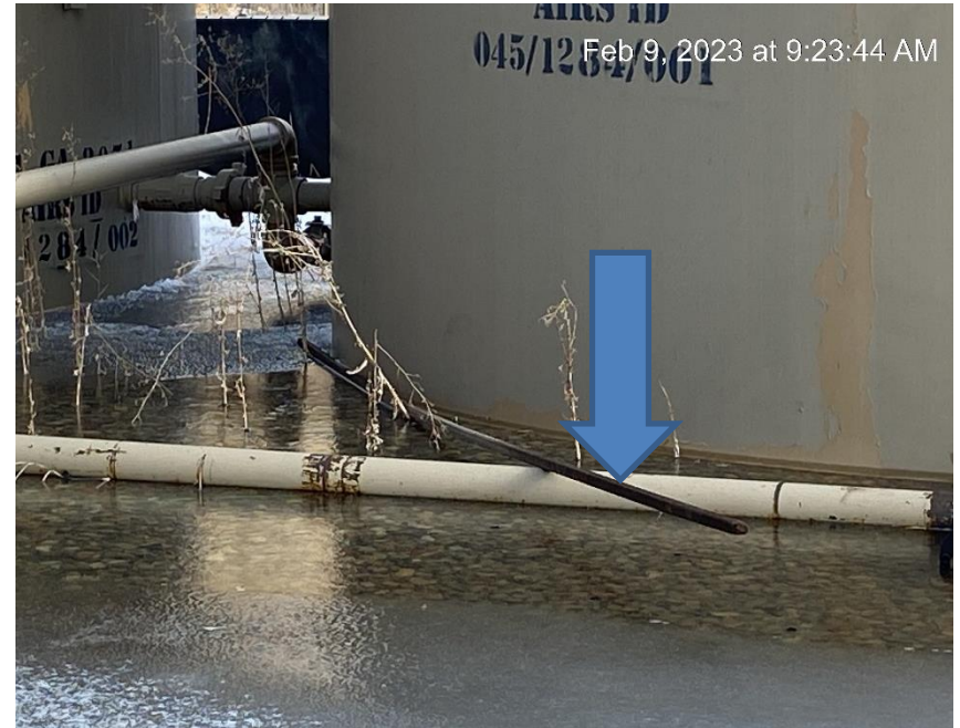
Debris inside tank battery containment