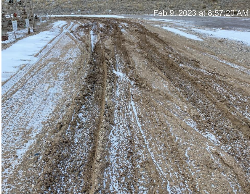
Lack of stabilization