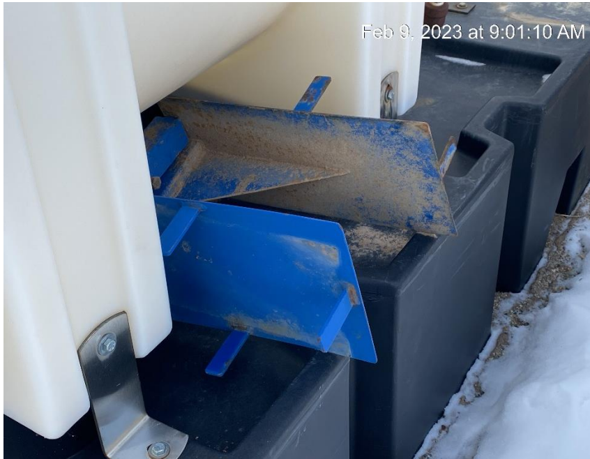
Random debris on chemical tank containments