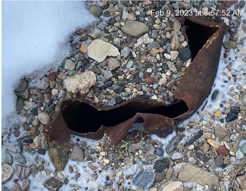
Southern exposed mousehole