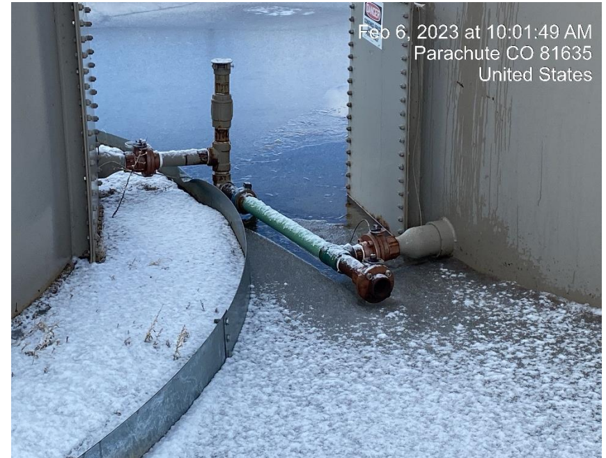
Open end tank valve