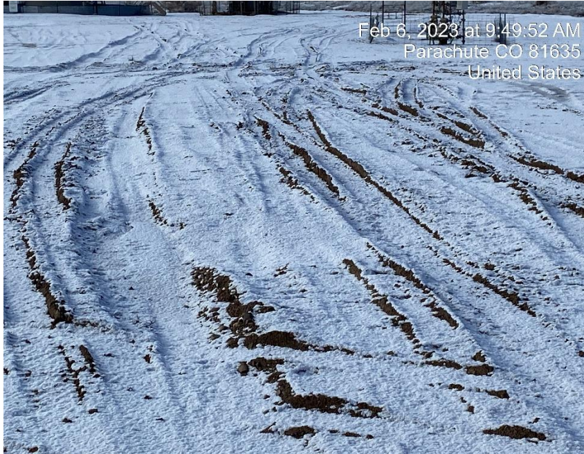
Lack of stabilization