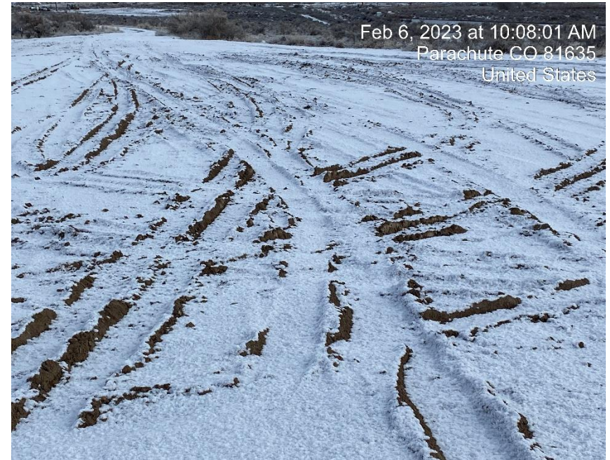
Lack of stabilization