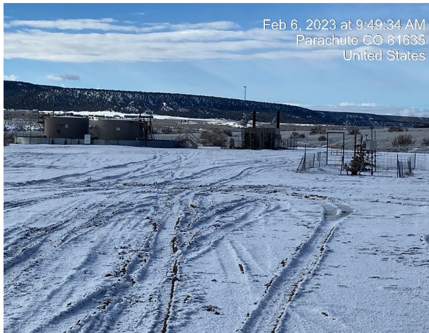
Entrance to location