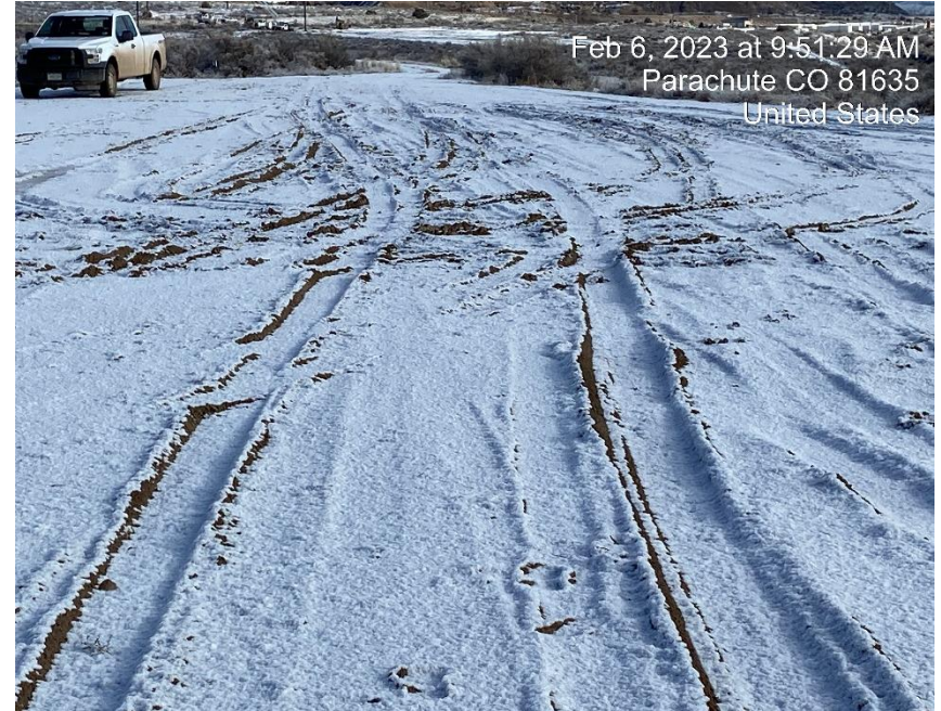
Lack of stabilization