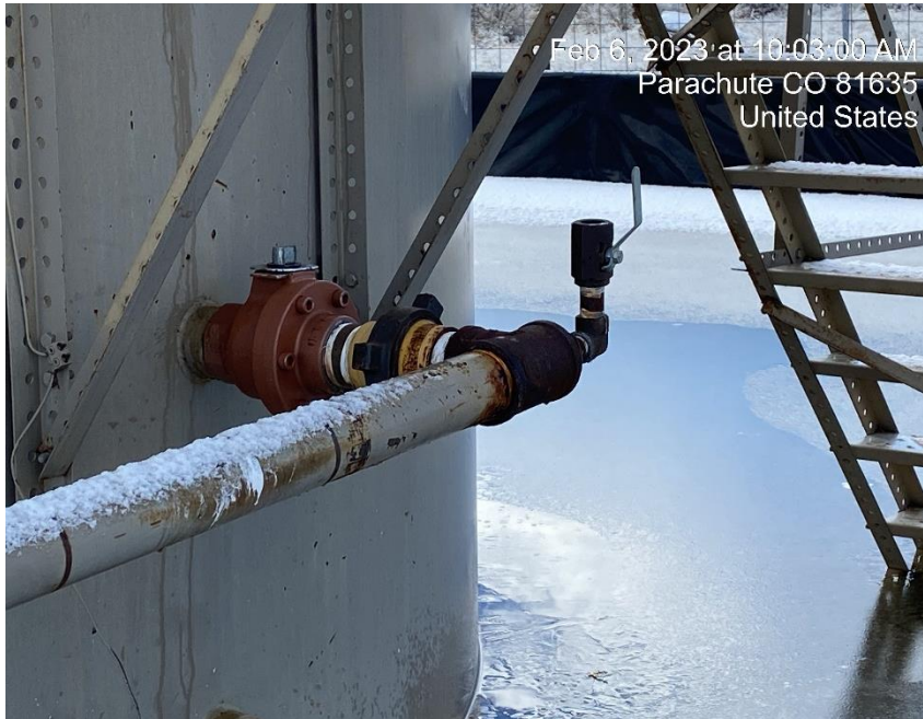
Open valve on loadline