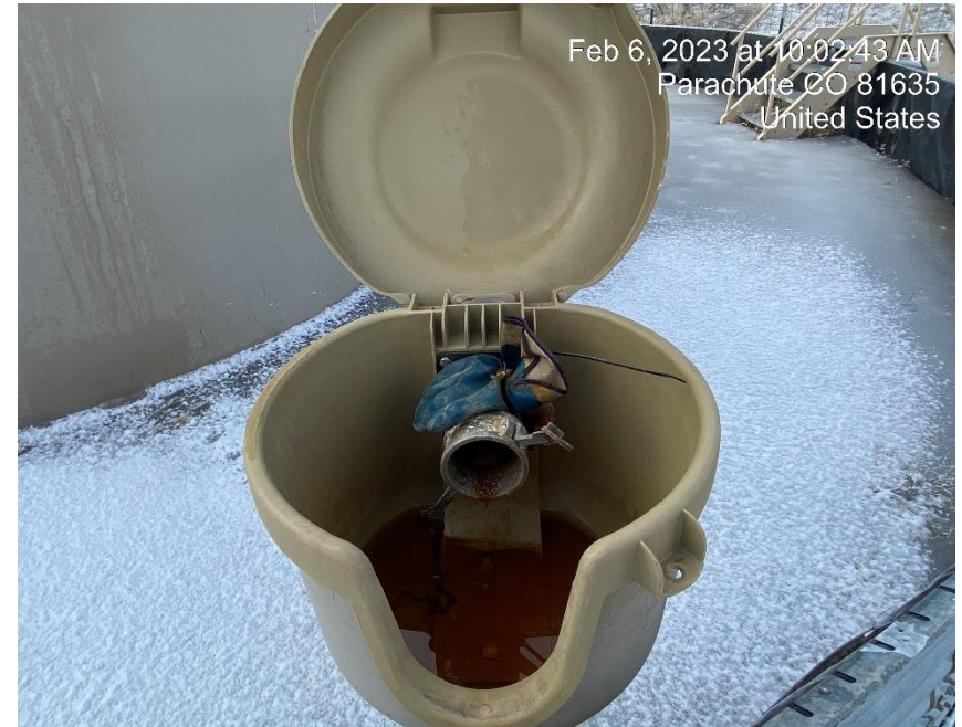
Uncapped loadline on produced water tank