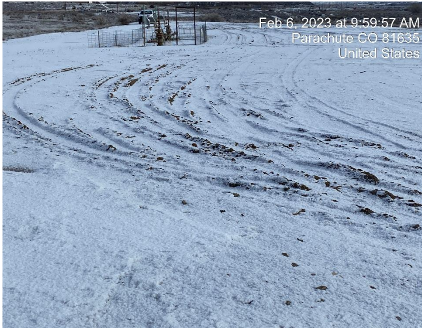
Lack of stabilization