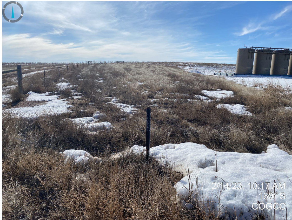
Photo 3. Facing south near the location's entrance; see comments in Photos 1 & 2.