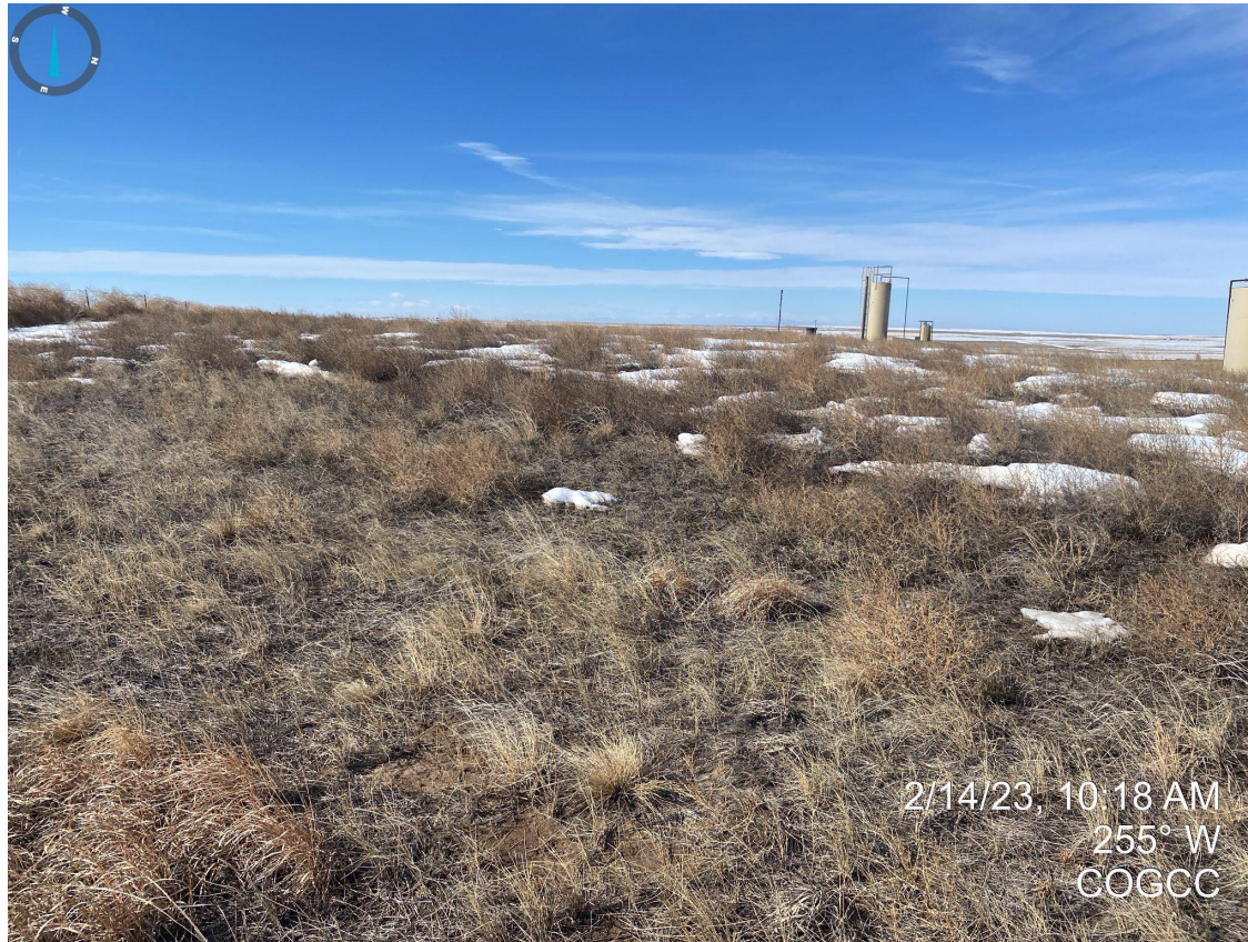
Photo 4. Facing west from the southern portion of the location; see comments in Photos 1 & 2.