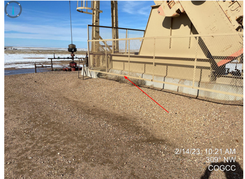
Photos 11 & 12. Close up photos of debris (e.g. glass, metal, tumbleweeds) observed near the pump jack.