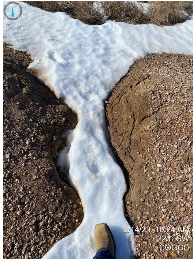
Photo 17. Close-up photo of gully erosion, boot for scale. See comments in Photos 15 & 16.