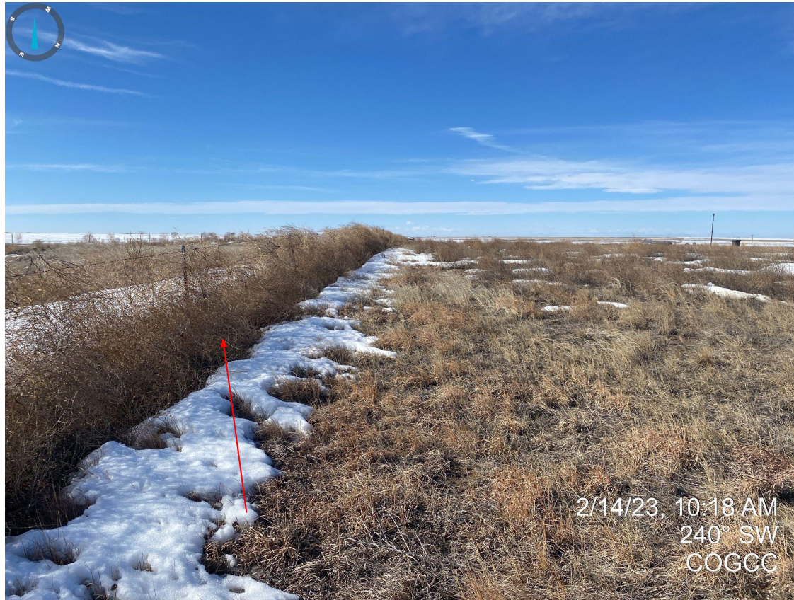
Photo 6. Facing southwest from the southern portion of the location. Photo illustrates tumbleweed accumulations along fence line that are now considered debris and need to be removed.