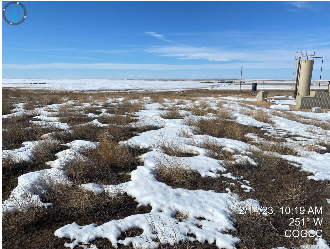
Photo 5. Facing west from the southern portion of the location; see comments in Photos 1 & 2.