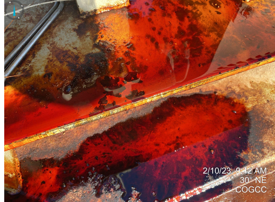
Photos 17 & 18. Unknown red fluid observed on skid of compressor, located on the northeastern portion of the location.