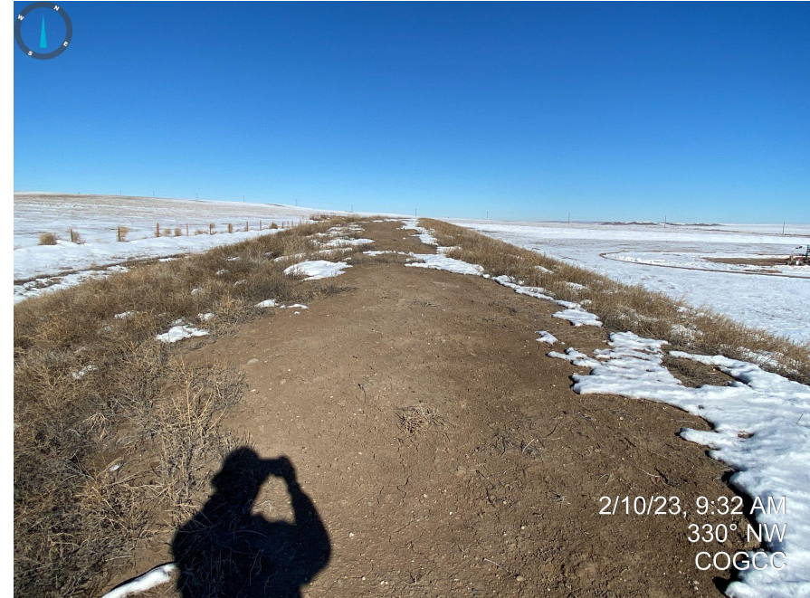
Photos 1 & 2. Facing northwest from the topsoil stockpile. Photos illustrate evidence of bare soil and undesirable vegetation (e.g. kochia and russian thistle).