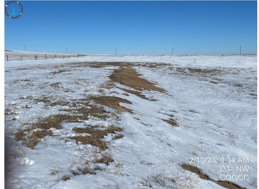
Photos 3 & 4. Facing north and northwest towards interim areas. Evidence of bare soil within the interim area.