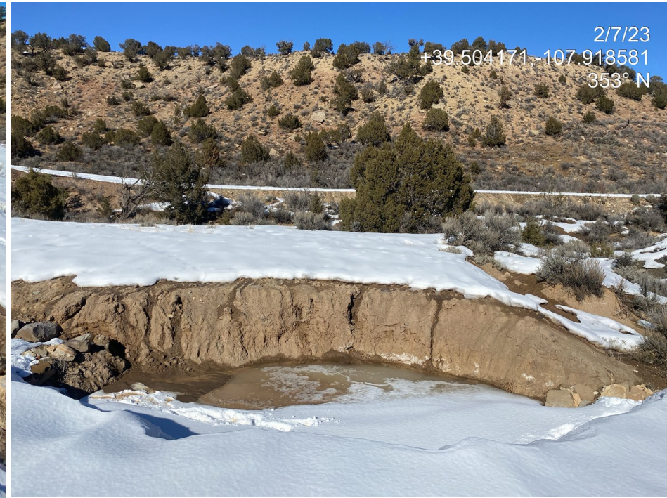
Photo 5. Photos show rill erosion occurring throughout BMPs to the southeast of the location, particularly on sediment trap walls. Trap erosion is acting as an additional sediment source.