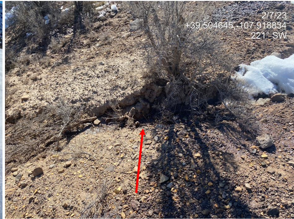
Photo 4. Photos show runoff from the access road causing erosion.