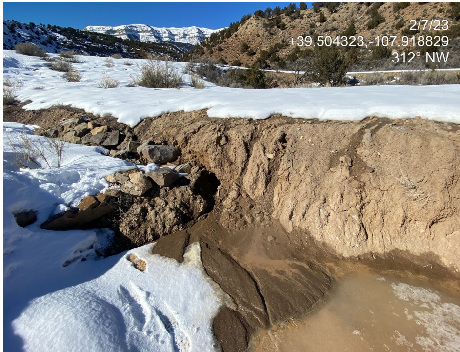
Photo 7. Photos show rill erosion, scouring and undercutting of rock armor occurring throughout BMPs to the southeast of the location.