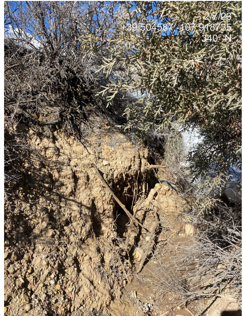
Photo 3. Photos show stormwater BMPs to the south of the access road. Stormwater discharged from the BMPs is causing scouring resulting in gully erosion (right).