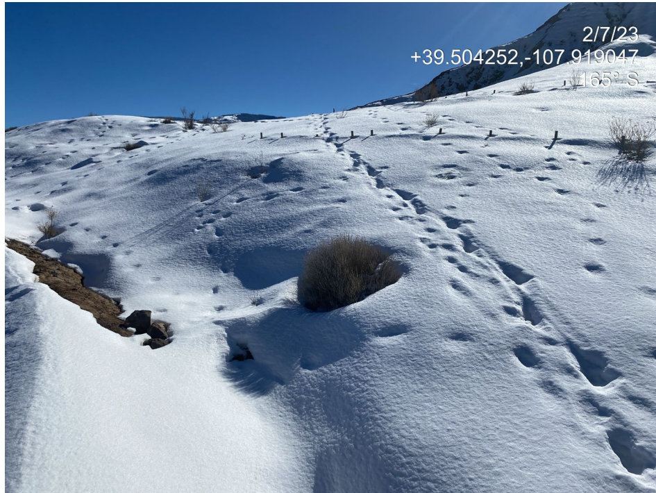
Photo 8. Photos shows additional BMPs which are snow covered. Follow up inspection required to assess snow covered areas. Note erosion degradation in sediment trap to the northwest (right).