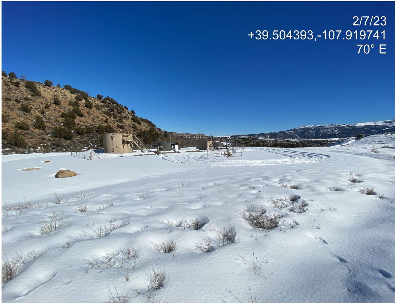
Photo 1. Photos taken from the west shows an overview of production areas.