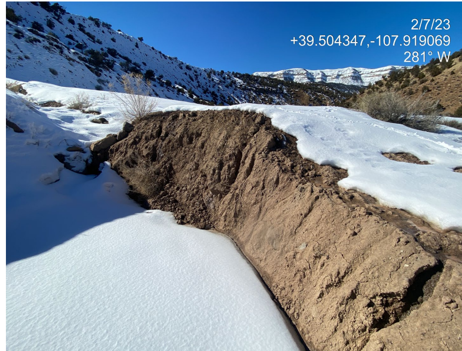
Photo 6. Photos show rill erosion occurring throughout BMPs to the southeast of the location, particularly on sediment trap walls. Trap erosion is acting as an additional sediment source.