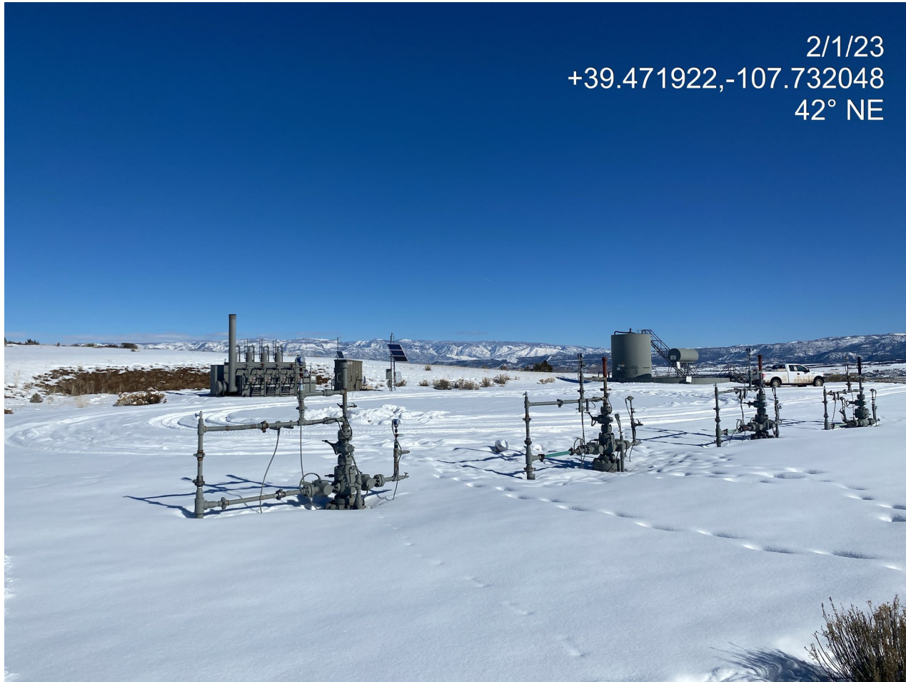
Photo 1. Photo taken from the south shows an overview of the location.