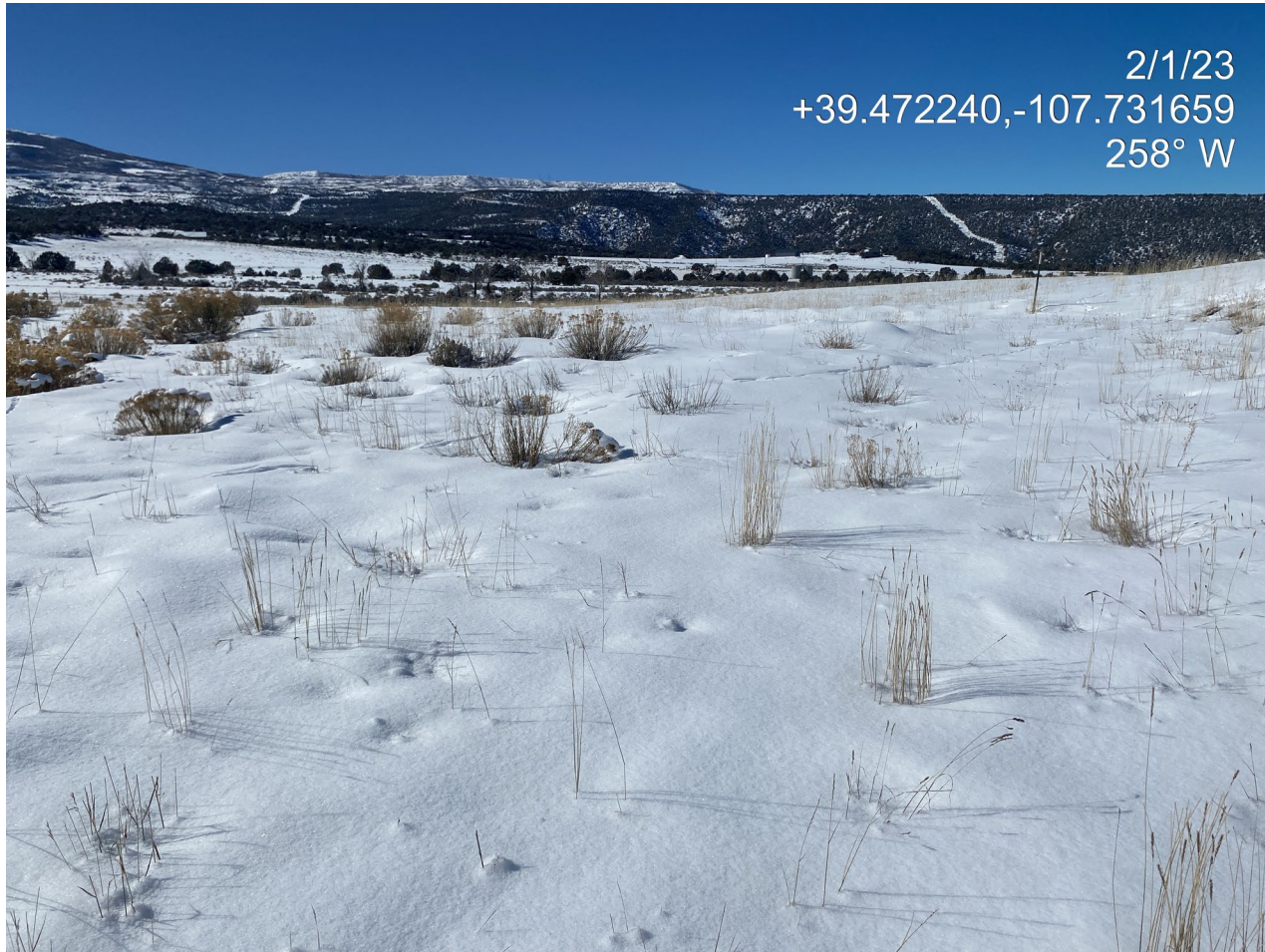
Photo 4. Photo shows an example of interim areas. Perennial grasses appear established.