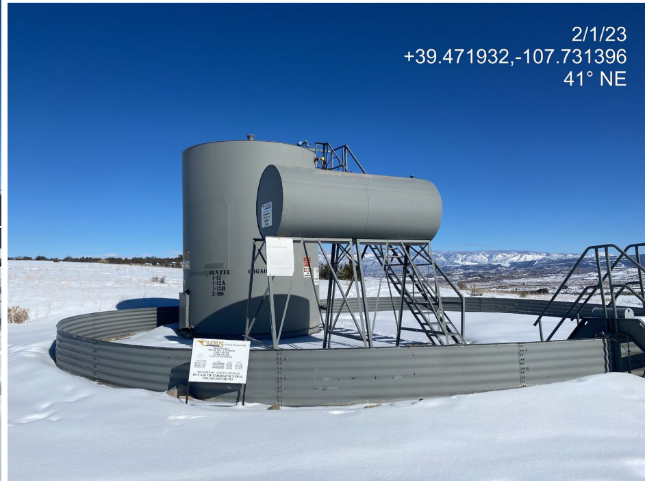
Photo 3. Photos show production areas.