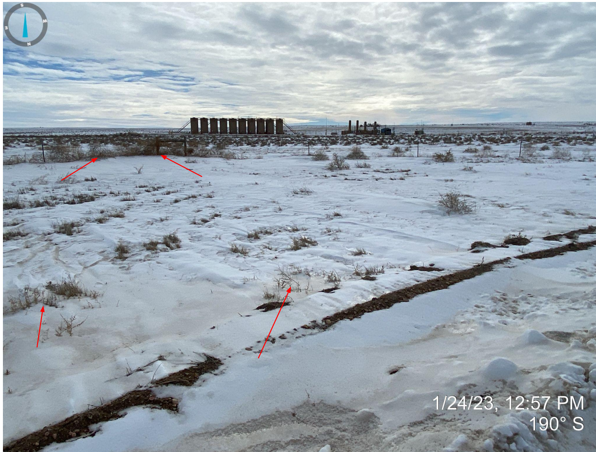
Photo 3. Facing south near the wellheads. Photo illustrates that the disturbance areas appear to have been reclaimed with evidence of vegetation establishment. It should be noted that some undesirable vegetation (e.g. kochia and russian thistle) was observed throughout the reclaimed/interim areas and accumulations of tumbleweeds around fence lines and equipment.