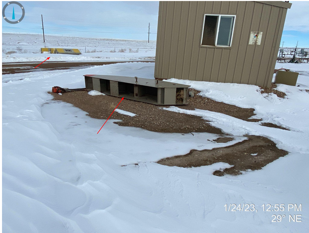
Photo 1. Facing northeast near pump jack. Photo illustrates unused equipment being stored on location.