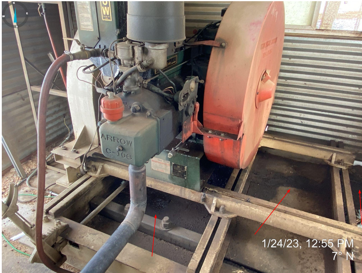
Photo 2. Close-up photo of pump jack motor, indicating fresh oil and oil staining on foundation of motor skid.