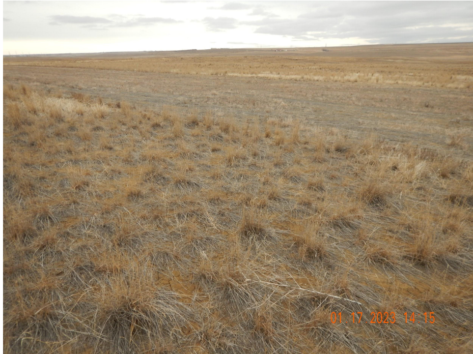
Photo 11. Photo taken from a portion of a previous access road that was reclaimed, facing East. Photo illustrates the access road lacks desirable vegetation and consists of annual weeds which is not reflective of reference area vegetative levels.