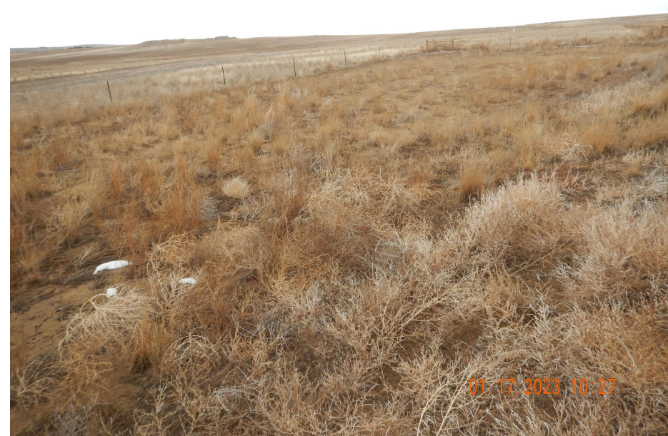
Photo 2. Photo taken from the southeastern perimeter of location, facing Southeast. Photo illustrates an area with predominantly weedy vegetation and bare soil, which is not reflective of reference area vegetative levels.