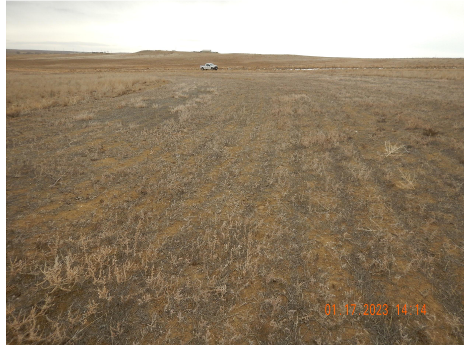
Photo 12. Photo taken from a portion of a previous access road that was reclaimed, facing South. See comments under Photo 11.