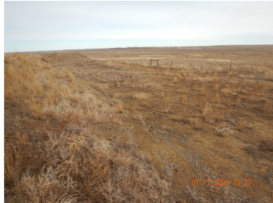
Photo 4. Photo taken from the previous photo location, facing North. See comments under Photo 2.