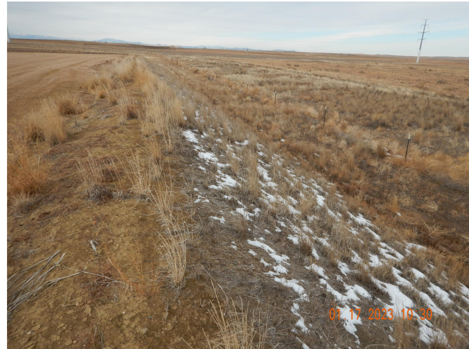
Photo 6. Photo taken from the northeastern perimeter of location, facing West. Photo illustrates the Operator has seeded the fill slopes and stormwater BMP areas.

Note- trash was observed along the perimeter of location and shall be removed.