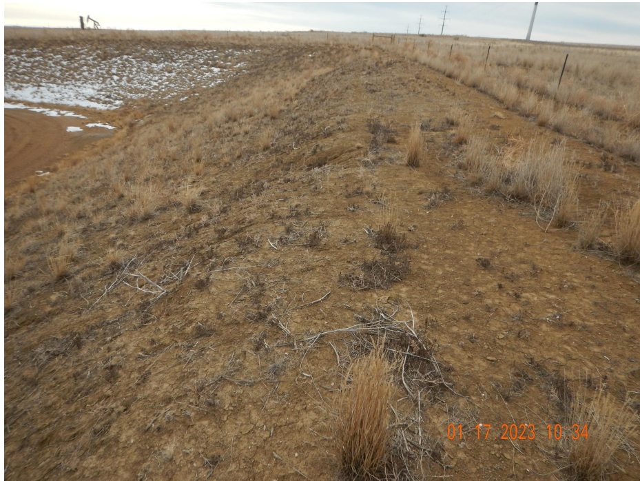
Photo 9. Photo taken from the previous photo location, facing south. See comments under Photo 8.