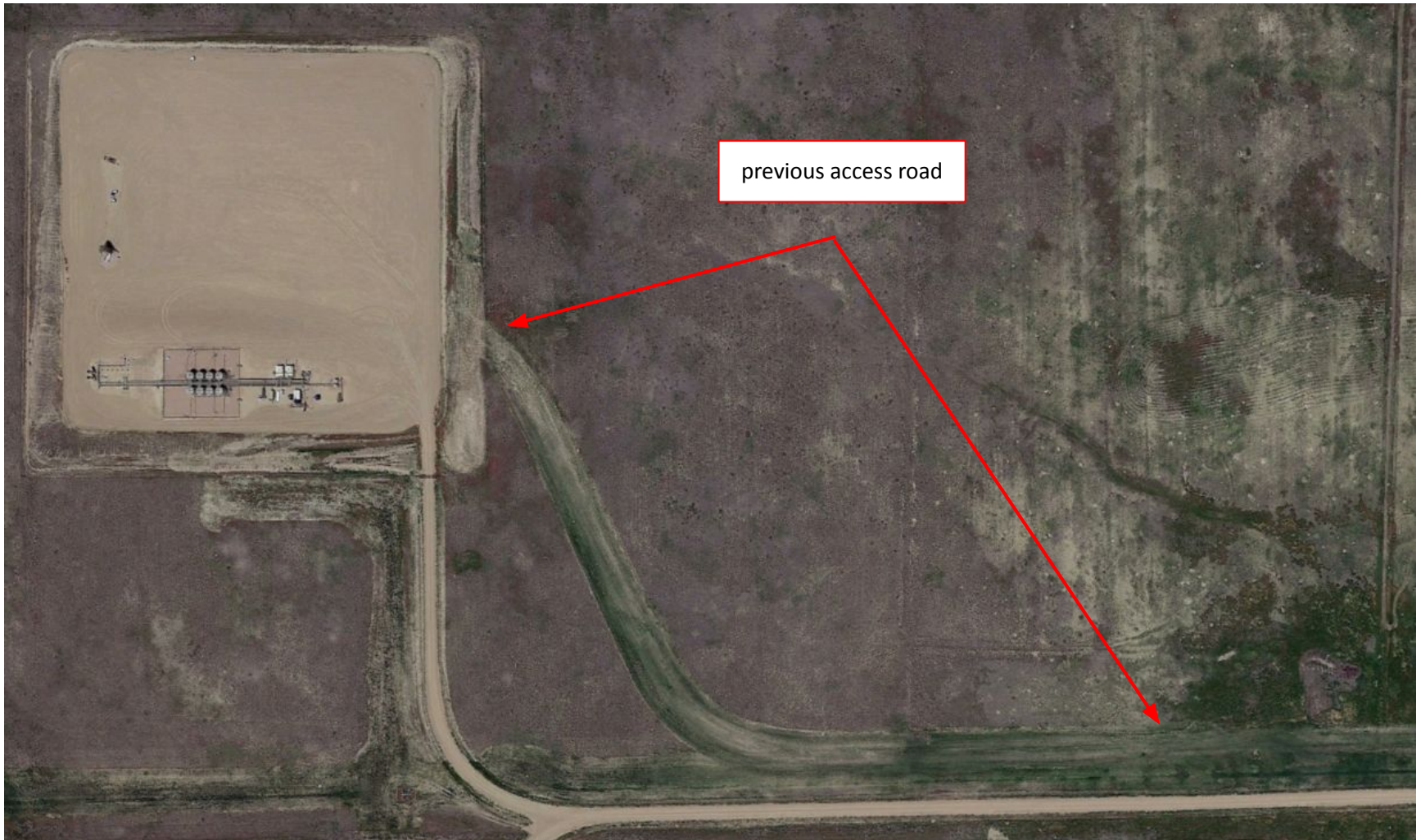
Photo 13. Google Earth aerial imagery from 6/11/2021 illustrates a portion of a previous access road that was reclaimed but fails to meet Rule 1003 vegetative requirements.