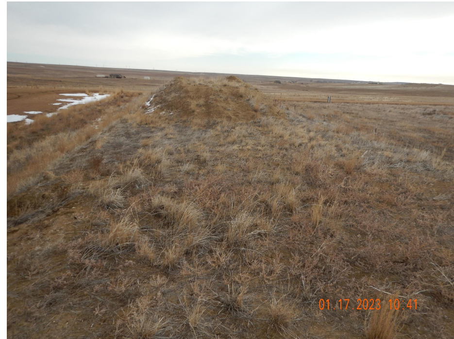
Photo 10. Photo taken from the southeastern perimeter of location, facing East. Photo illustrates the Operator stockpiled additional topsoil onto the original topsoil stockpile and failed to properly stabilize the stockpiles.