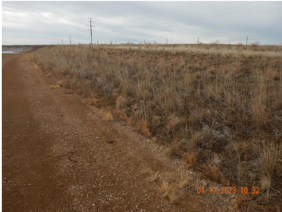
Photo 7. Photo taken from the northwestern perimeter of location, facing South. Photo illustrates the Operator has seeded the cut slopes and stormwater BMP areas.