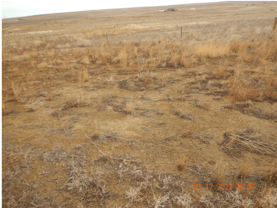
Photo 3. Photo taken from the previous photo location, facing East. See comments under Photo 2.