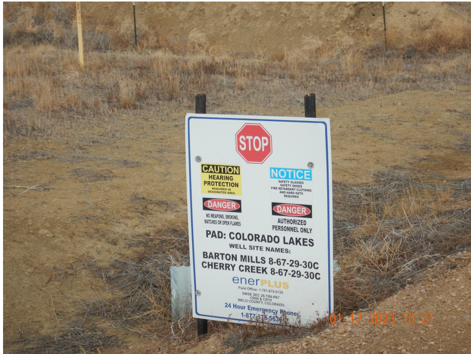
Photo 1. Photo taken from the entrance of location, facing North. Photo illustrates the Operator sign.