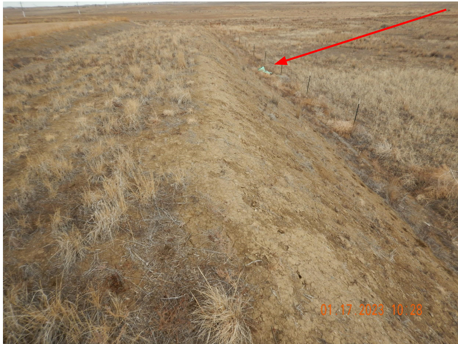
Photo 5. Photo taken from the eastern topsoil stockpile, facing North. Photo illustrates east-facing side of topsoil is not properly stabilized. COGCC staff recommends additional stabilization.

Note- trash was observed along the perimeter of location and shall be removed.