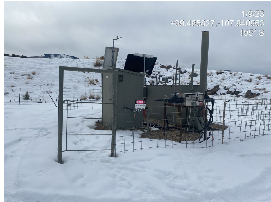
Photo 1. Photos show production areas.