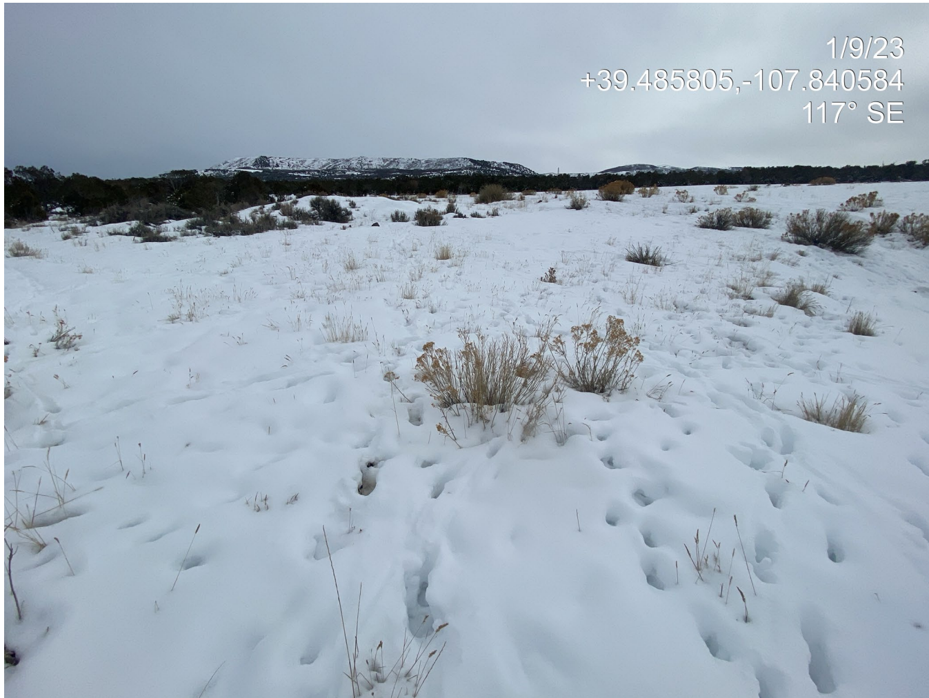
Photo 5. Photo shows interim areas appear vegetated with perennial grasses.