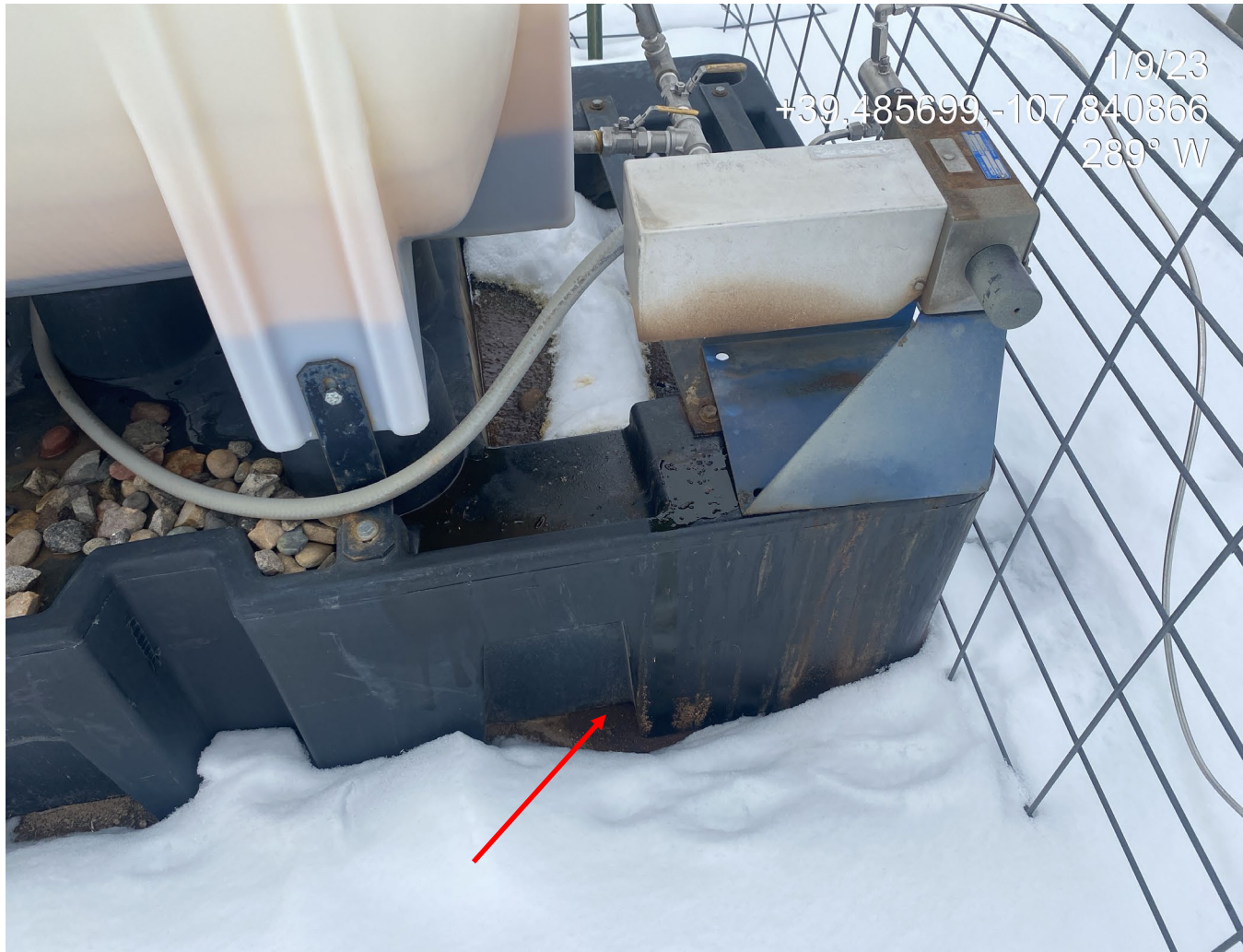
Photo 4. Photo shows a leaking corrosion inhibitor tank and stained soils.