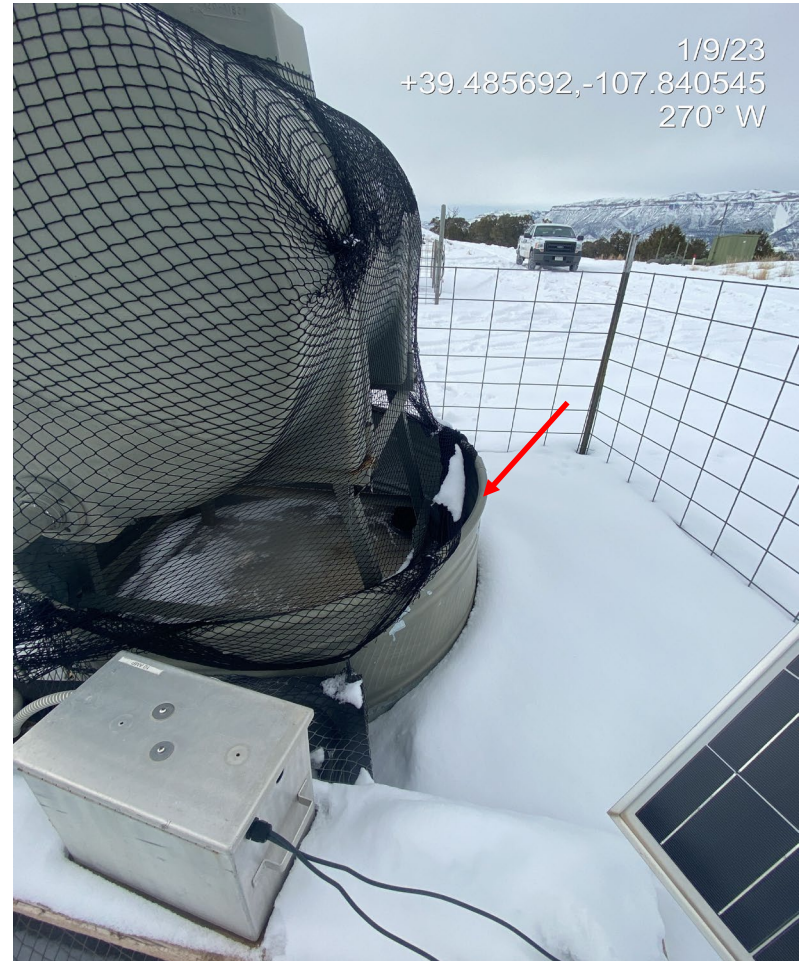
Photo 3. Photos show the wildlife protection netting is not in proper functioning condition due to being weighed down by snow.