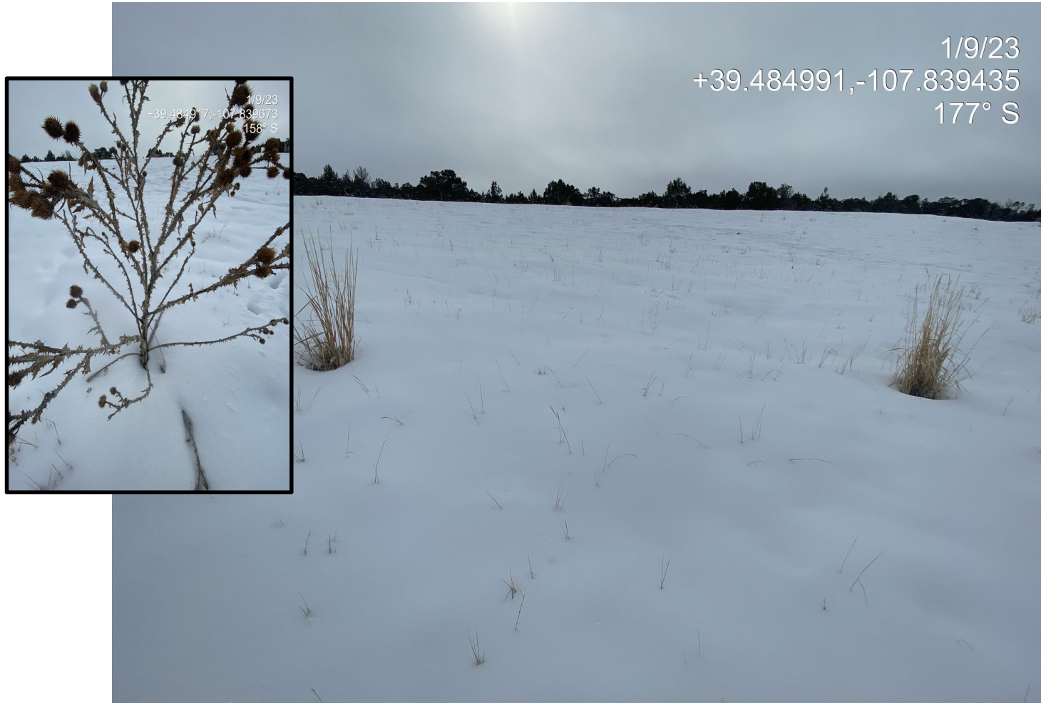
Photo 4. Photo shows an example of interim areas. Perennial grasses appear established. One noxious thistle observed (inset).