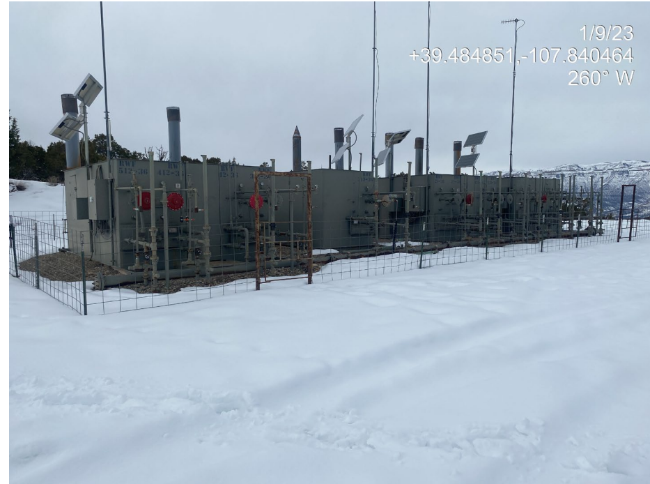
Photo 1. Photos show production areas.