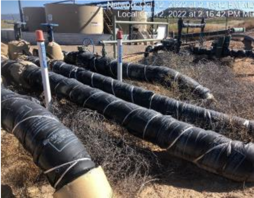
Photo #8040 From inspection #699805051 conducted on 10/12/22.