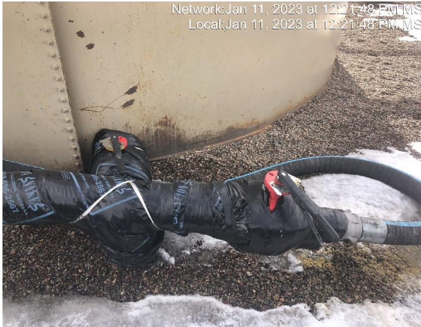
Photo #8775 Drain valves open with stained gravel under valve and hose.