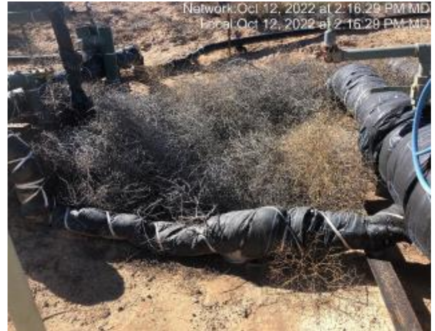
Photo #8039 From inspection #699805051 conducted on 10/12/22.