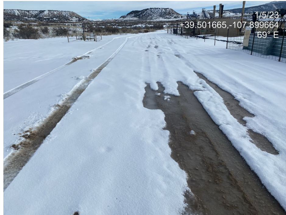
Photo 3. Photos show lack of stabilization/compaction.