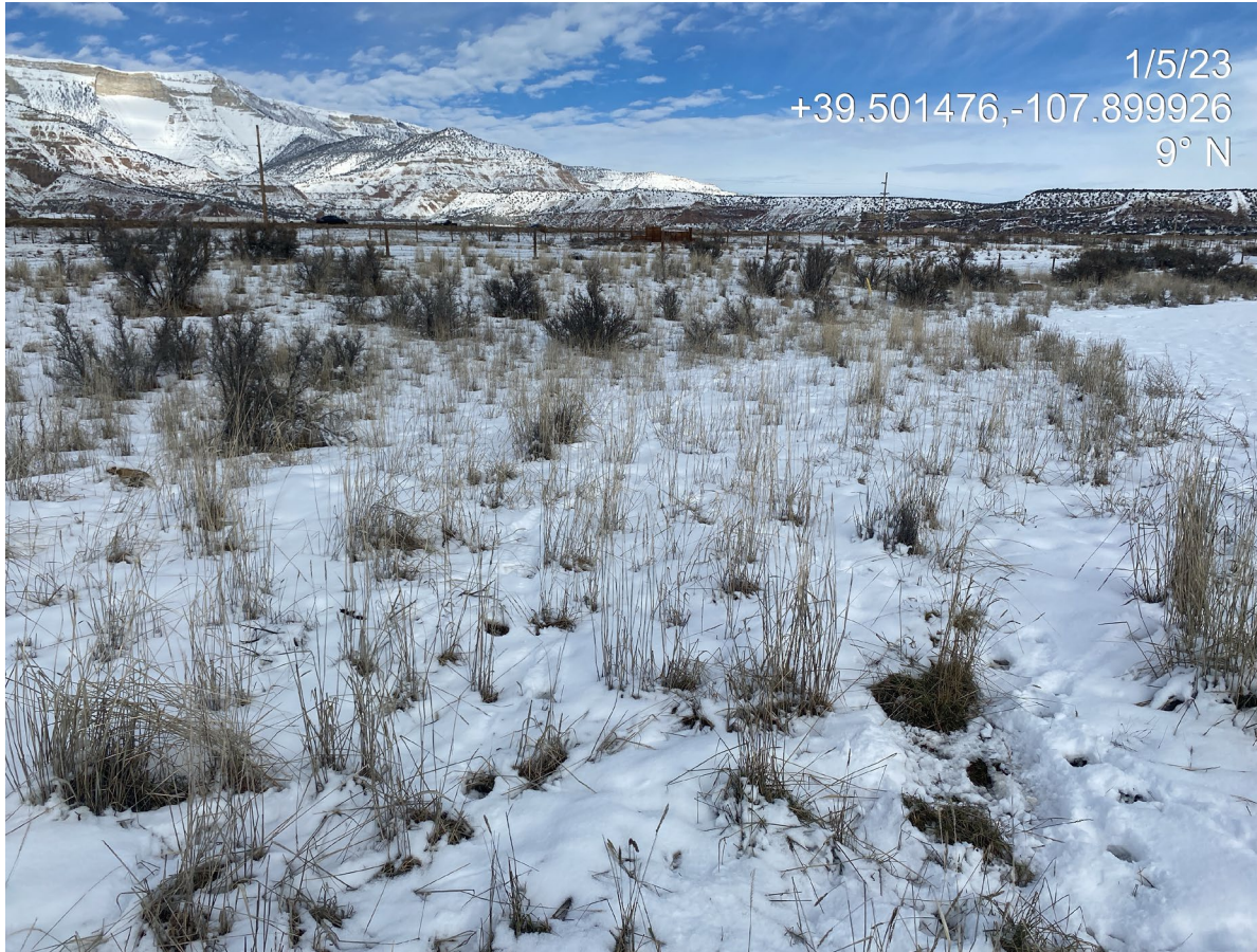
Photo 4. Photo shows an example of the interim areas. Introduced perennial grasses appear established.