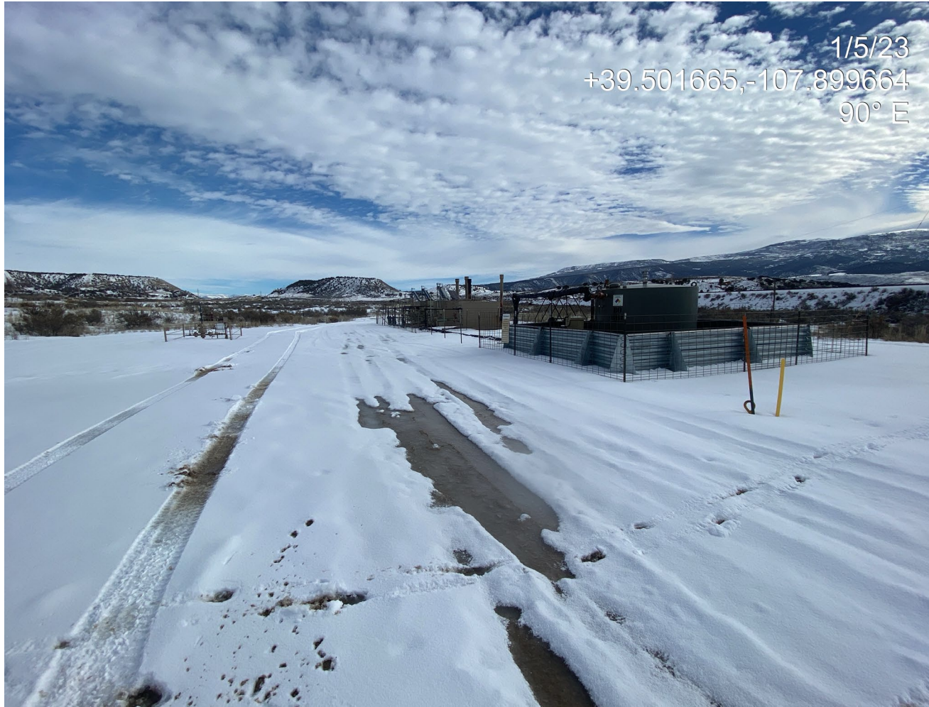
Photo 1. Photo taken from the west shows an overview of the location.