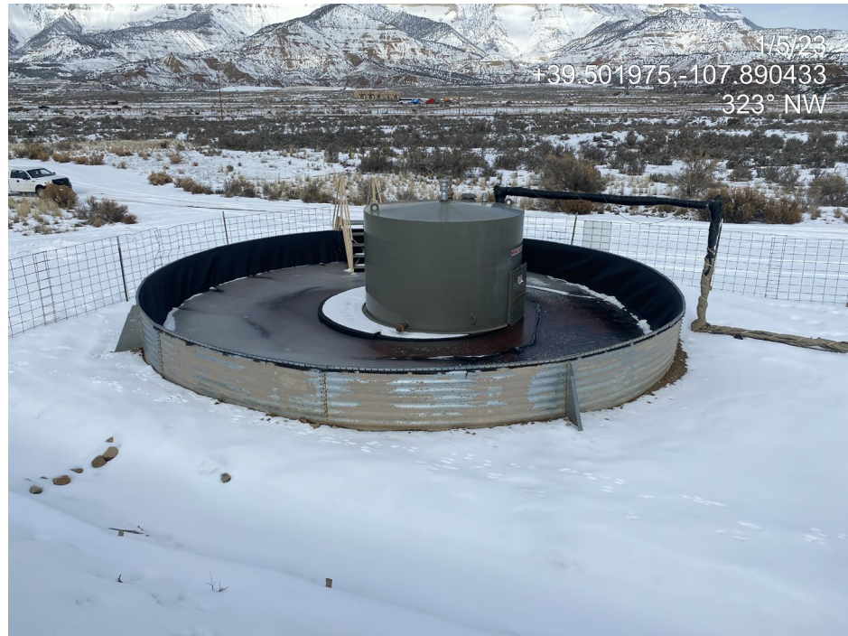
Photo 1. Photos show production areas.