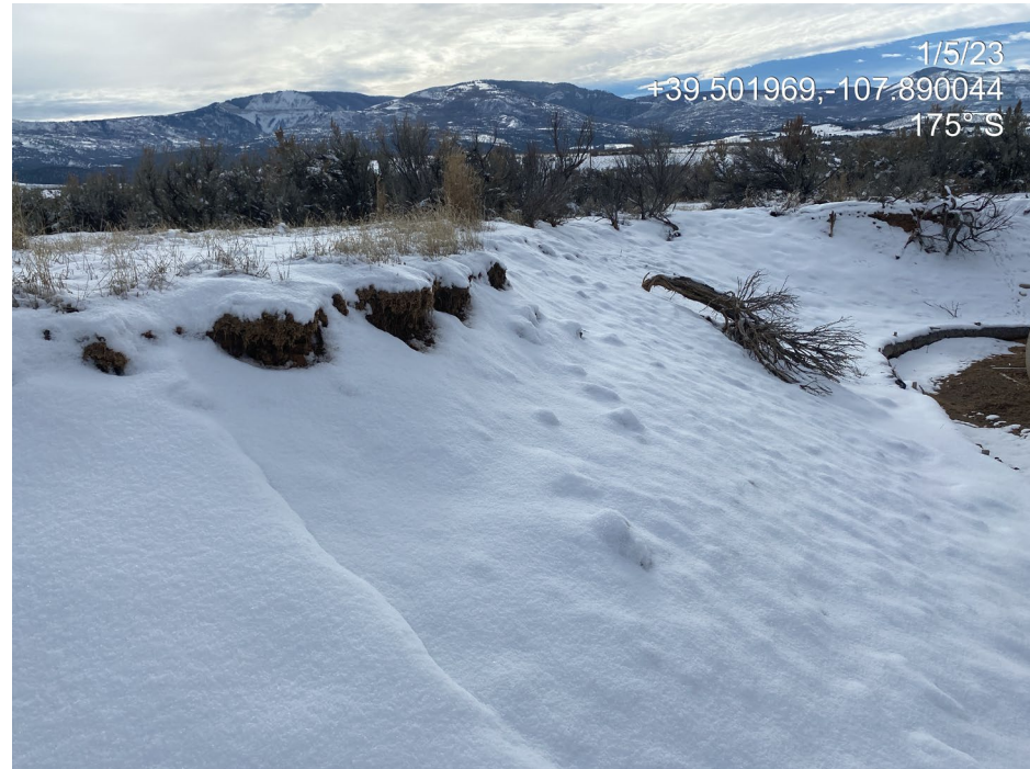
Photo 3. Photos show the cut slope at the southeast of the location. BMPs have been installed at the base of the slope, which continues to erode. Photos show site degradation from undercutting, causing soil loss and exposed plant roots.