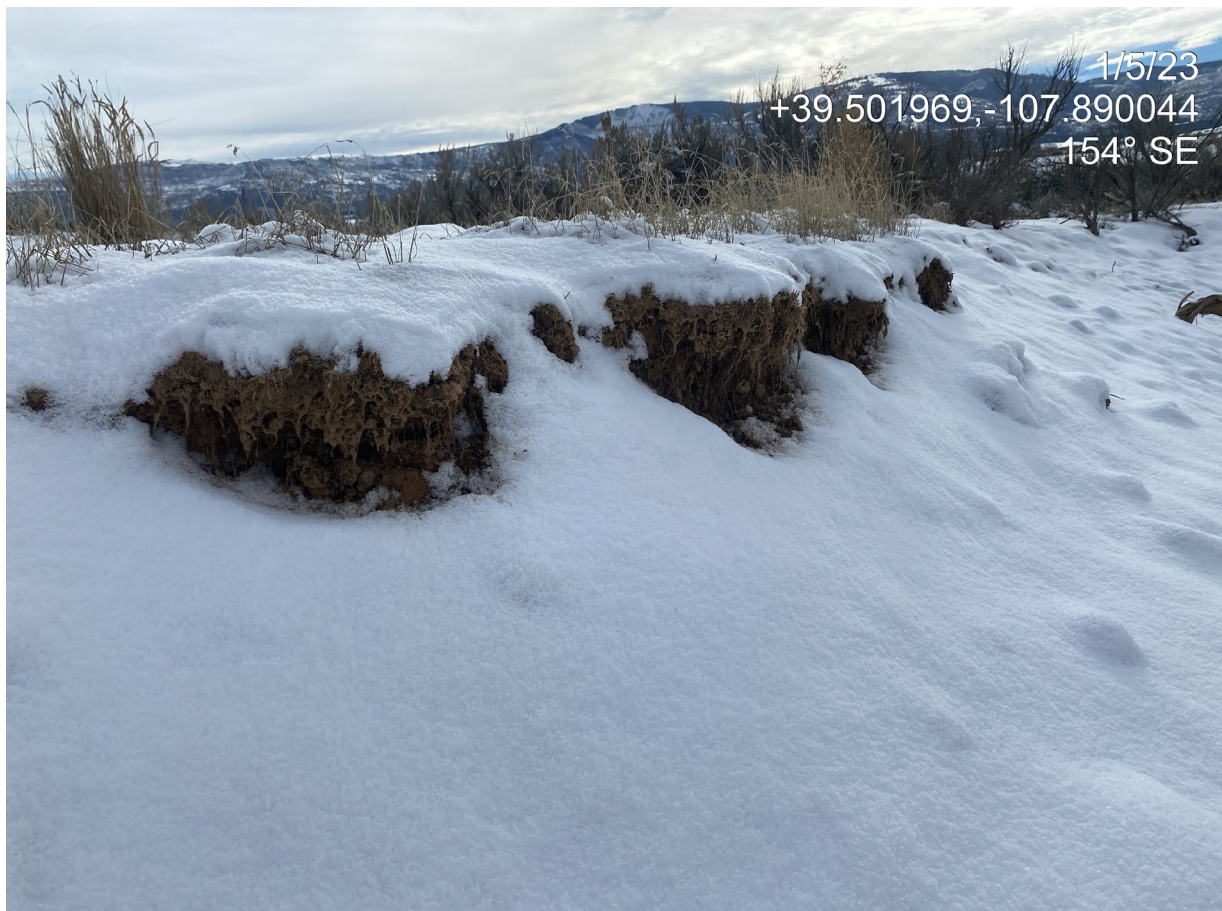
Photo 4. Photo shows the eroding cut slope at the southeast of the location.