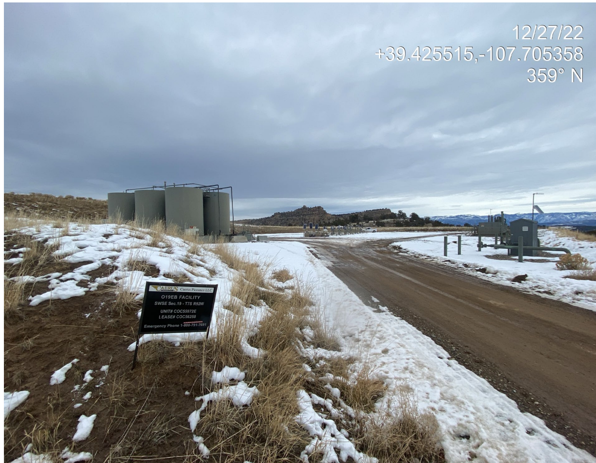
Photo 1. Photo taken from the entrance shows an overview of the location.