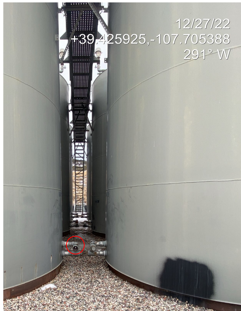
Photo 4. Photos show bull plugs not installed on tank drain line.