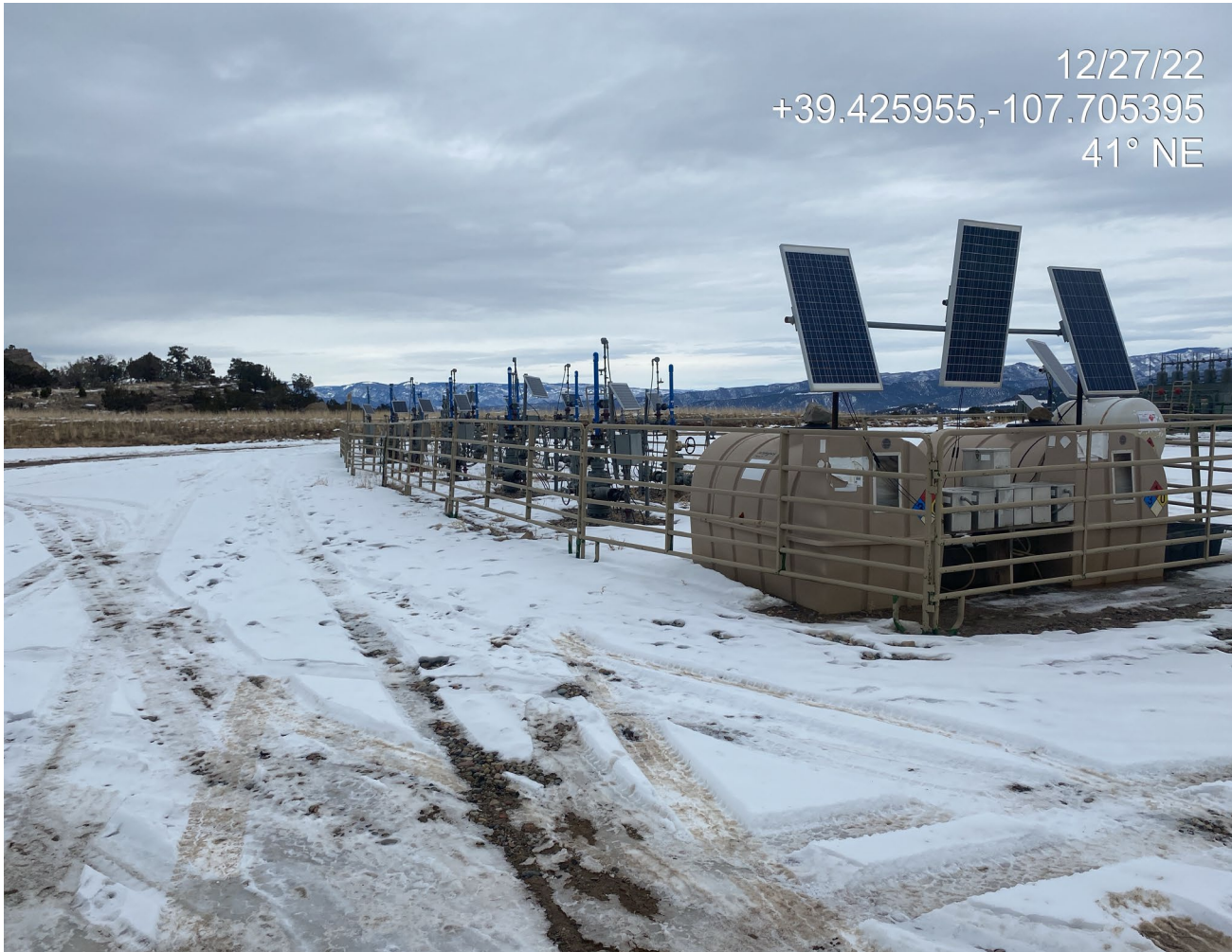
Photo 3. Photo shows production areas.