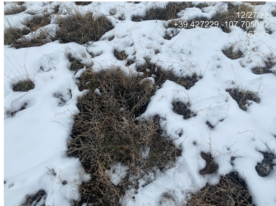
Photo 5. Photos show interim areas at the north (left). Portions of the interim areas appear poorly vegetated with perennials and dominated by annuals (left polygon and right). Snow cover and dormant season prevented full vegetation assessment.