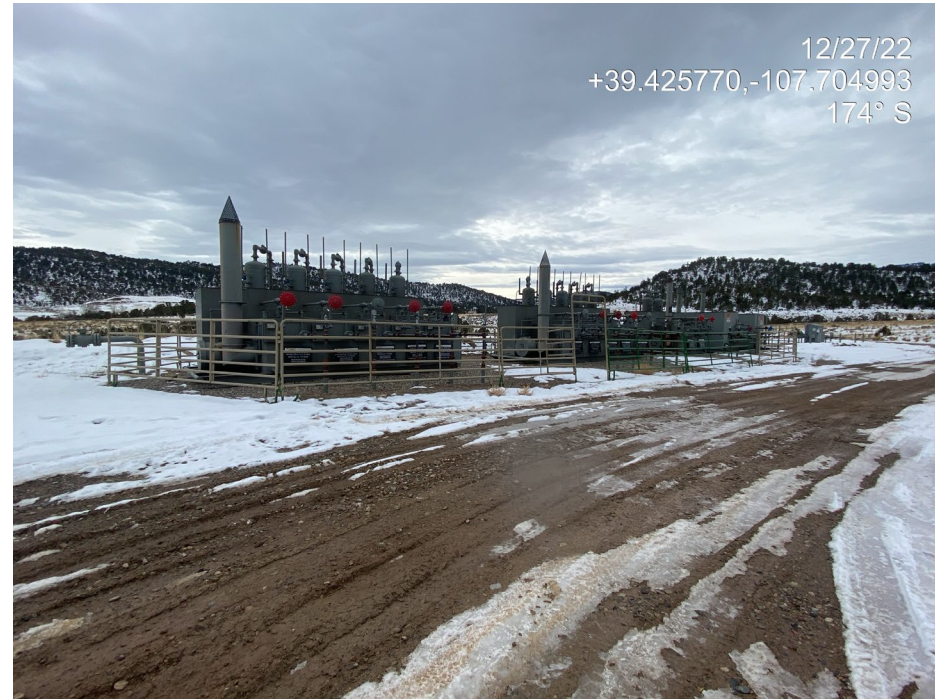
Photo 2. Photos show production areas. Note lack of tank battery sign (left).