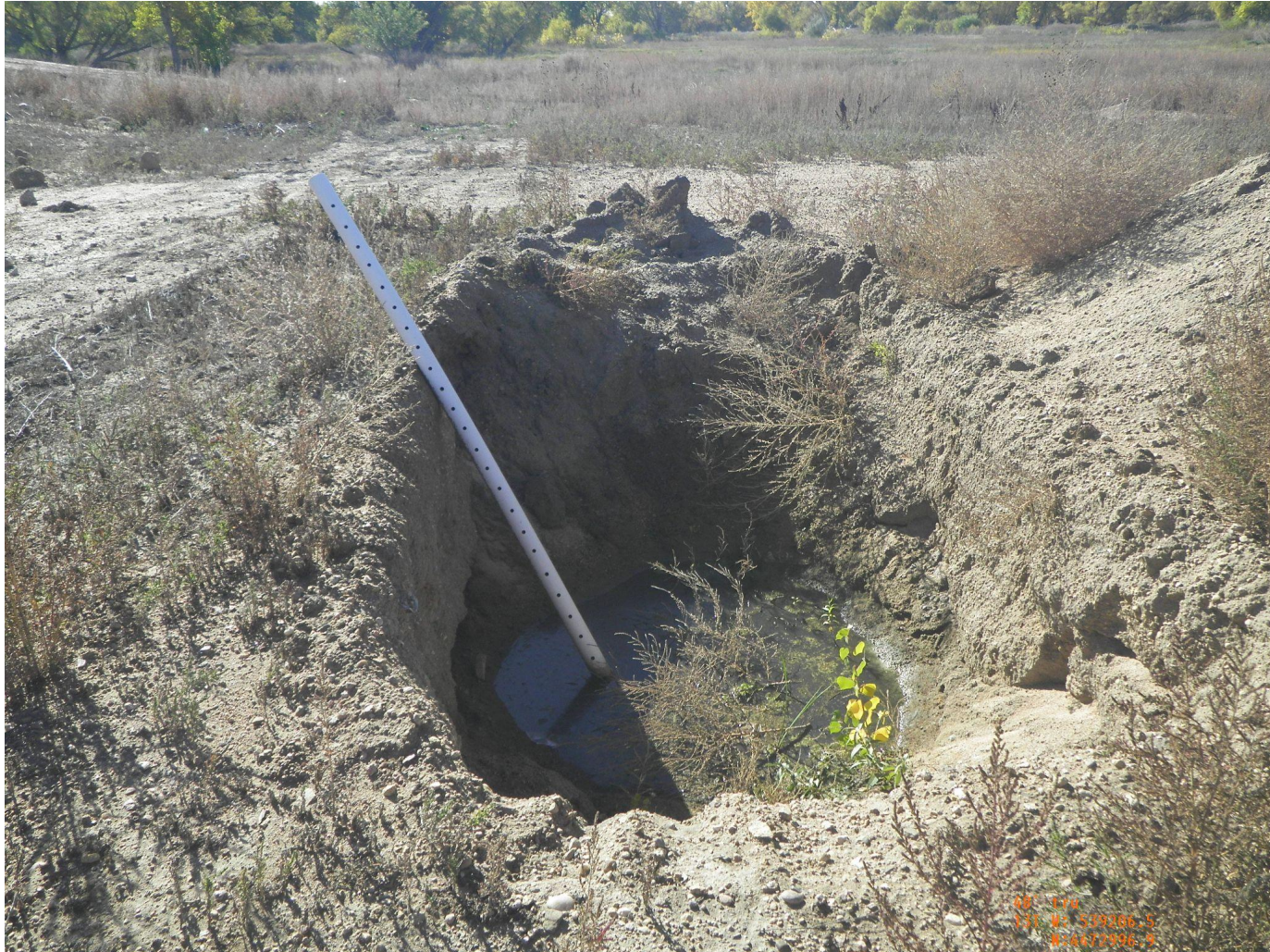
Photo 9. Pit and large gravel pile remains at the tank battery location.