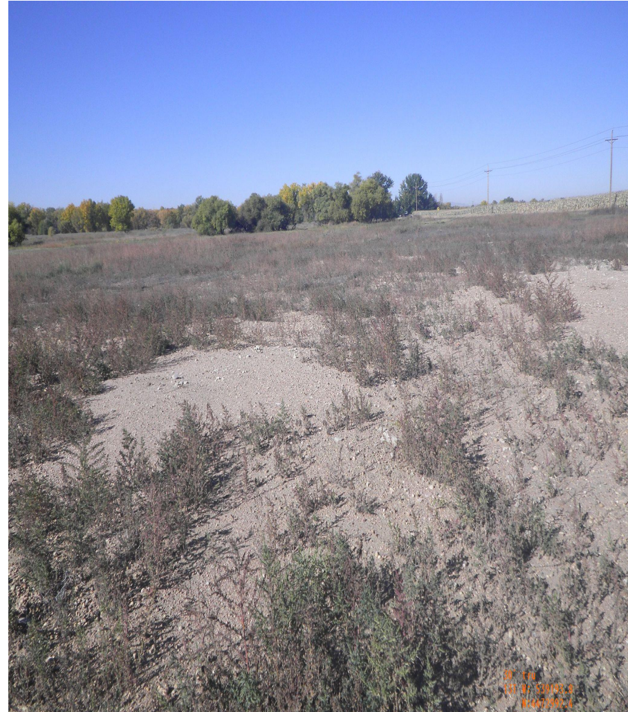
Photo 8. Cardinal photos taken at ground level from the middle of the tank battery. Left photo facing south, right photo facing west.