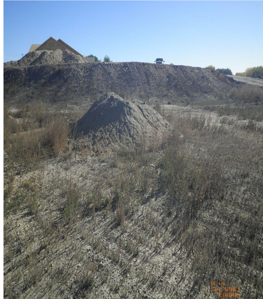
Photo 7. Cardinal photos taken at ground level from the middle of the tank battery. Left photo facing north, right photo facing east.