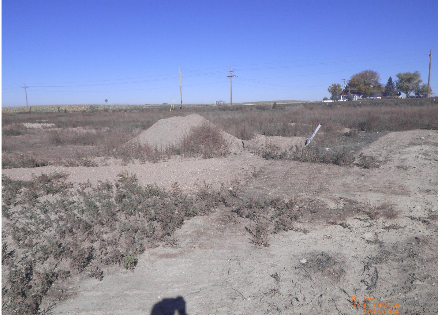
Photo 6. Overview photo of the tank battery taken at ground level from the southern edge facing north.