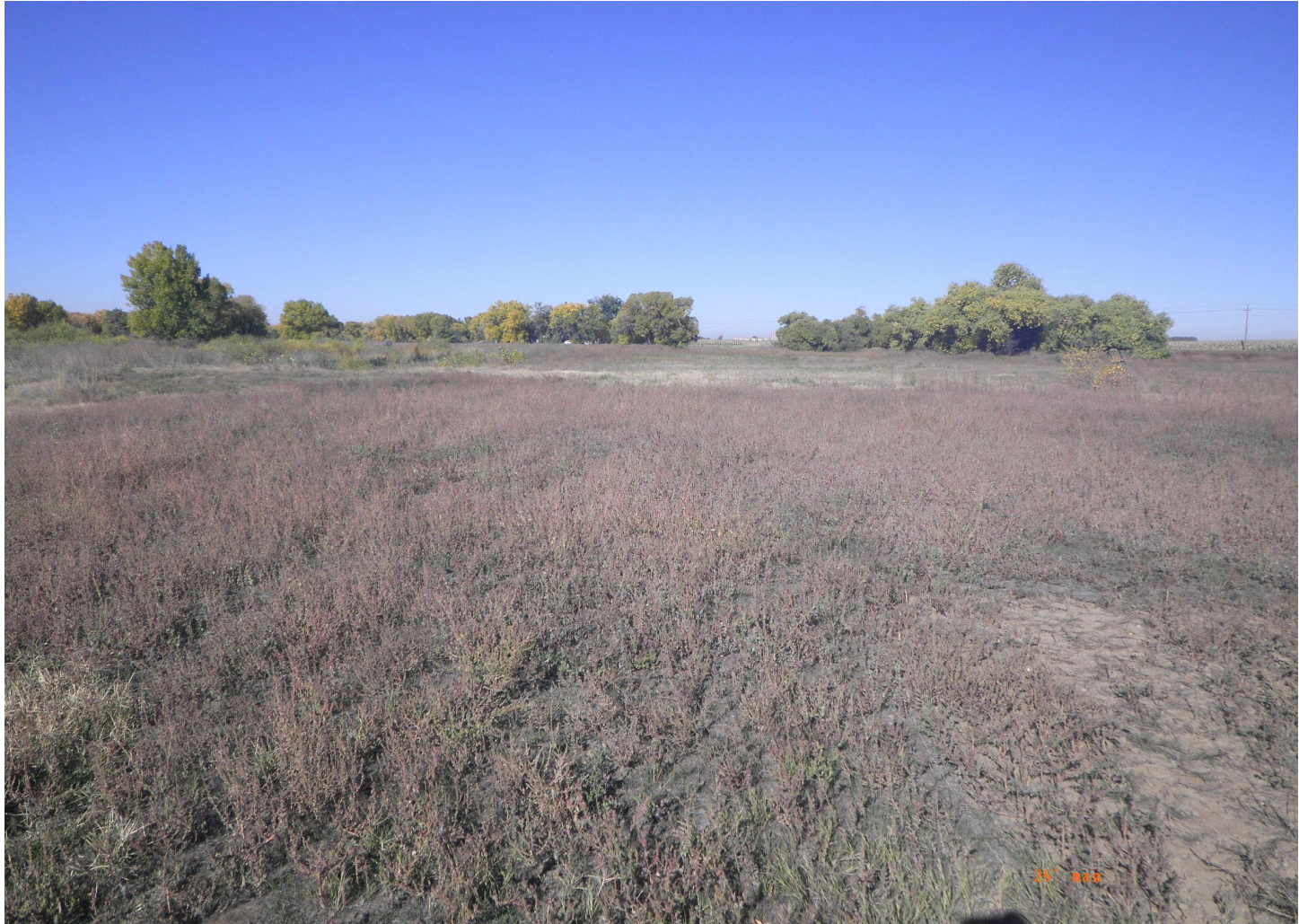
Photo 2. Overview photo of the well pad taken at ground level from the eastern edge facing west.