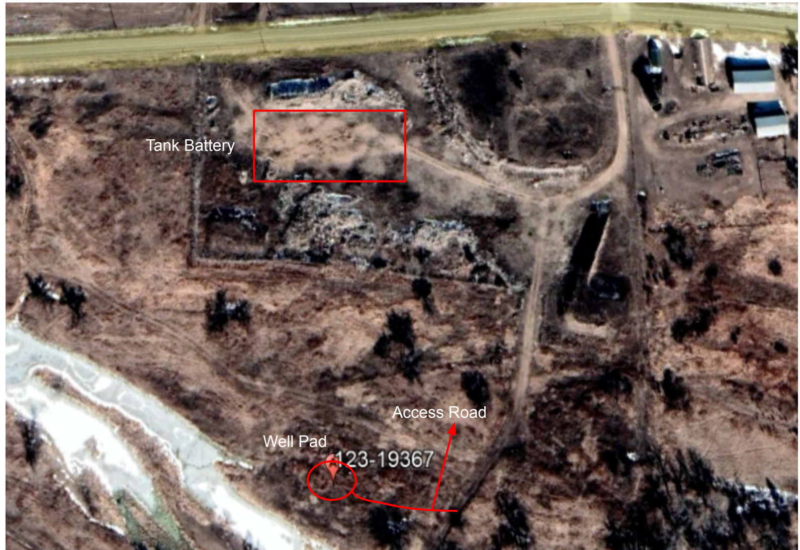
Photo 1. 2020 aerial imagery of the well pad, access road and tank battery.