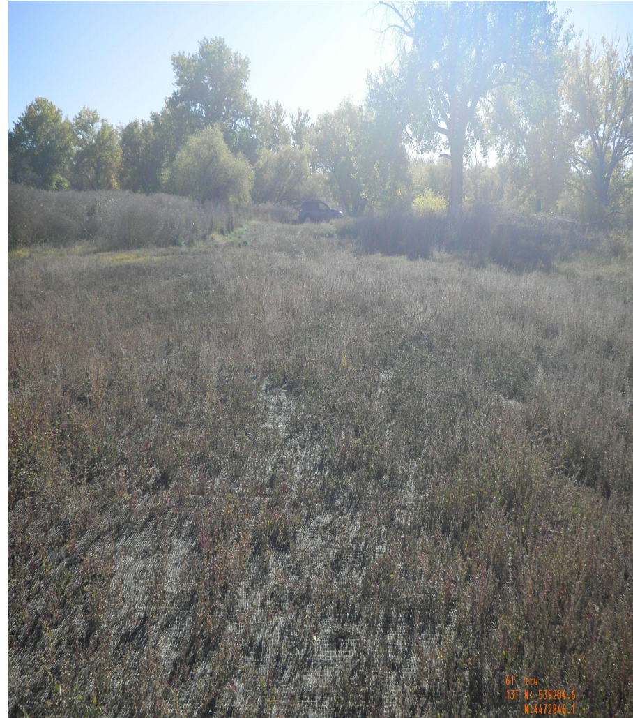
Photo 3. Cardinal photos taken at ground level from the middle of the well pad. Left photo facing north, right photo facing east.