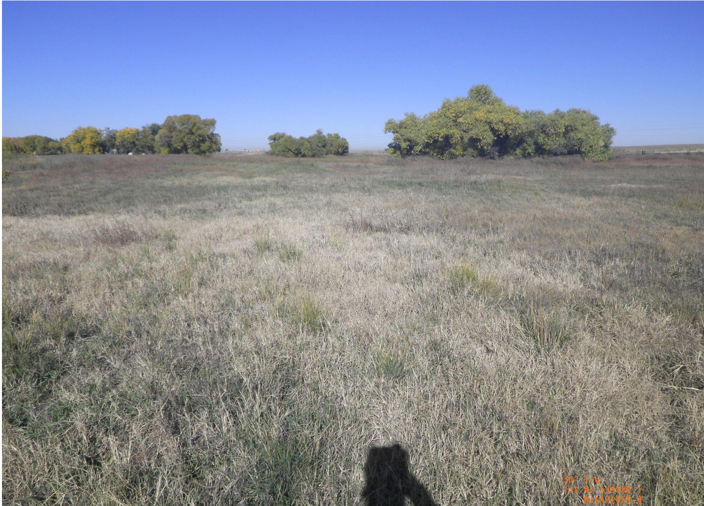
Photo 5. Well pad reference area.