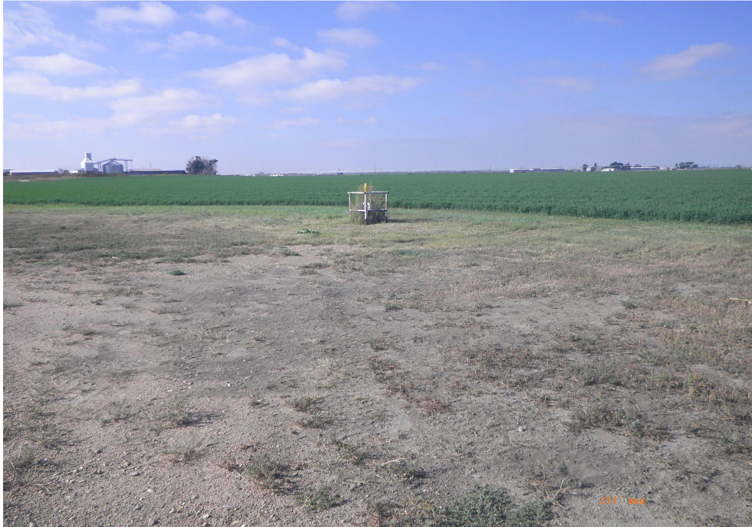
Photo 3. Overview photo of the tank battery taken at ground level from the northern edge facing south.