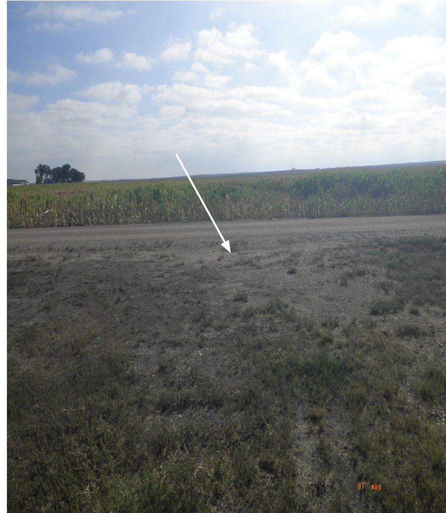
Photo 4. Cardinal photos taken from the middle of the tank battery. Left photo facing north, right photo facing east. Note: gravel remains on site at access point.