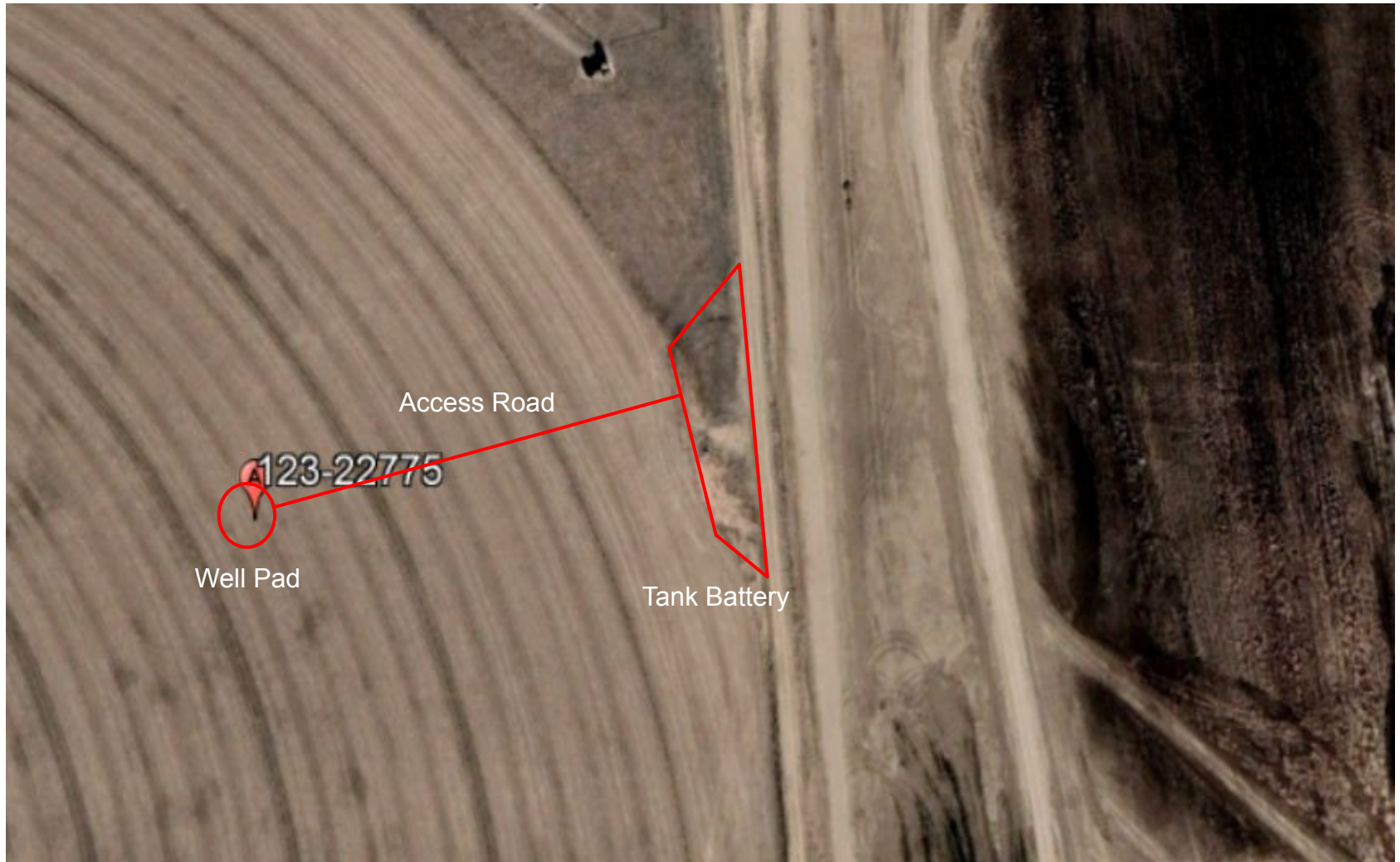
Photo 1. 2021 aerial imagery of the well pad, access road and tank battery.