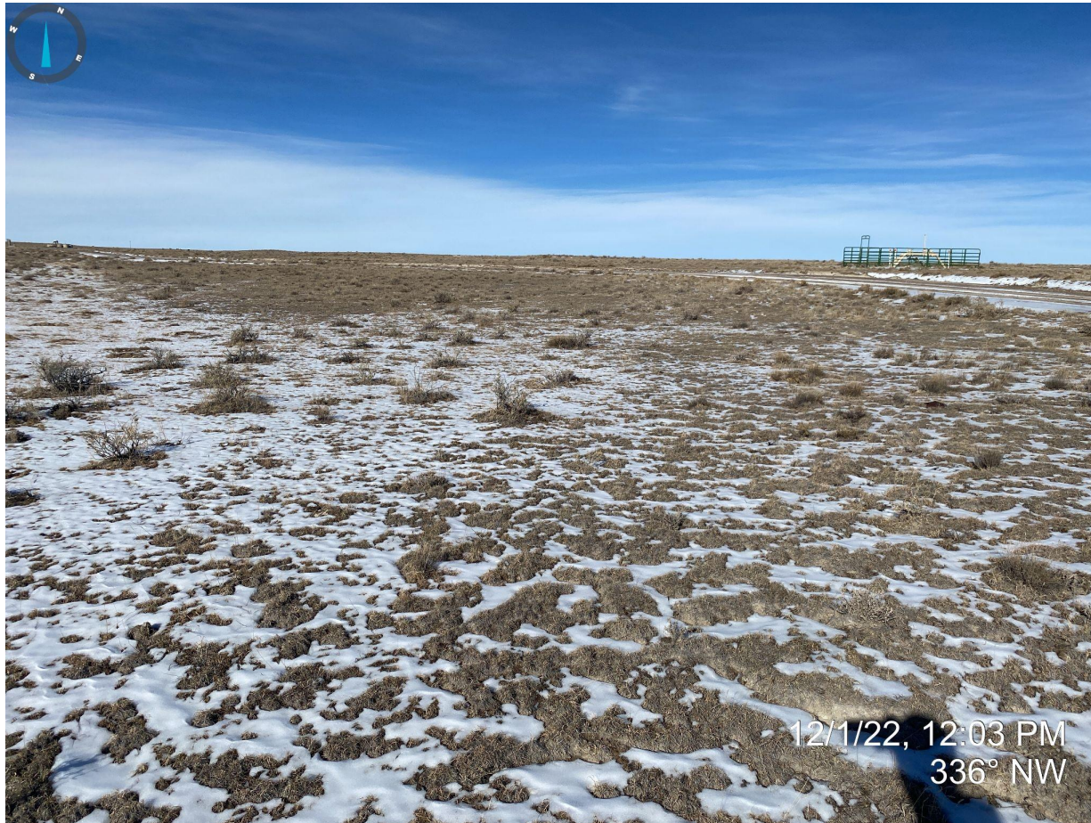
Photo 1. Reference area photo taken west of location, facing north. Reference area is predominantly buffalo grass with sand sagebrush and fourwing saltbrush also identified.