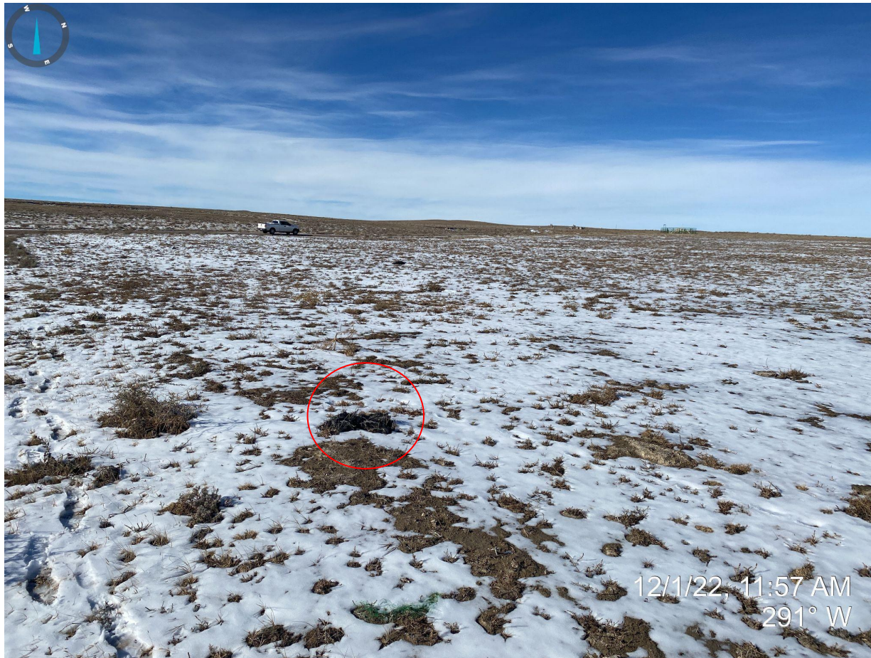
Photo 1. Taken from the southern portion of the location, facing west. Photo illustrates debris (e.g. netting) observed on location that needs to be removed and properly disposed of.