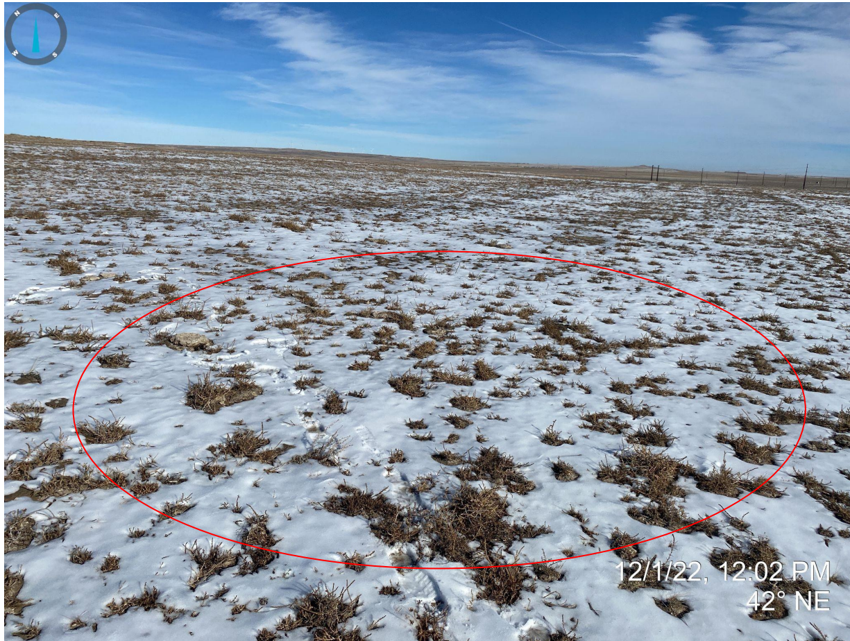
Photo 5. Taken from the northwest corner, facing northeast. Photo illustrates presence of russian thistle throughout the location.