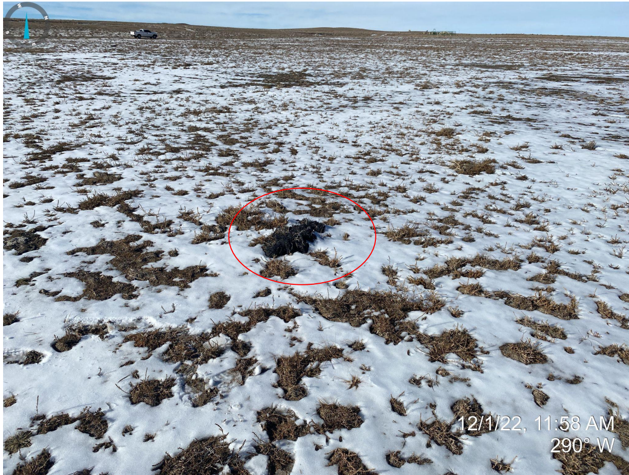
Photo 2. Taken near the southeastern corner of the location, facing west. See comments in Photo 1.