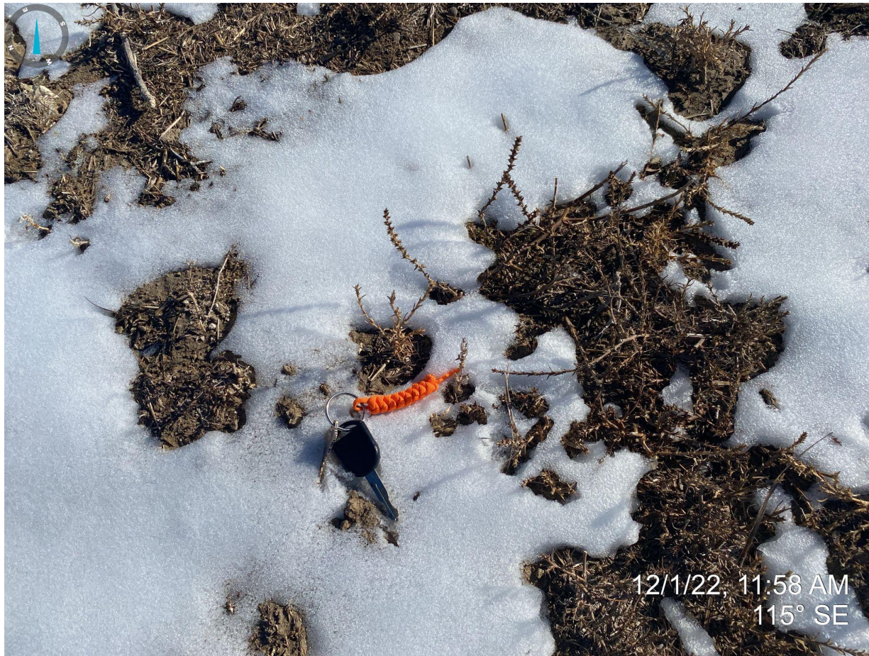
Photo 3. Close up photo of russian thistle, key for scale. The location consisted predominantly of russian thistle and bare soil. Some desirable vegetation was also observed in sparse amounts.