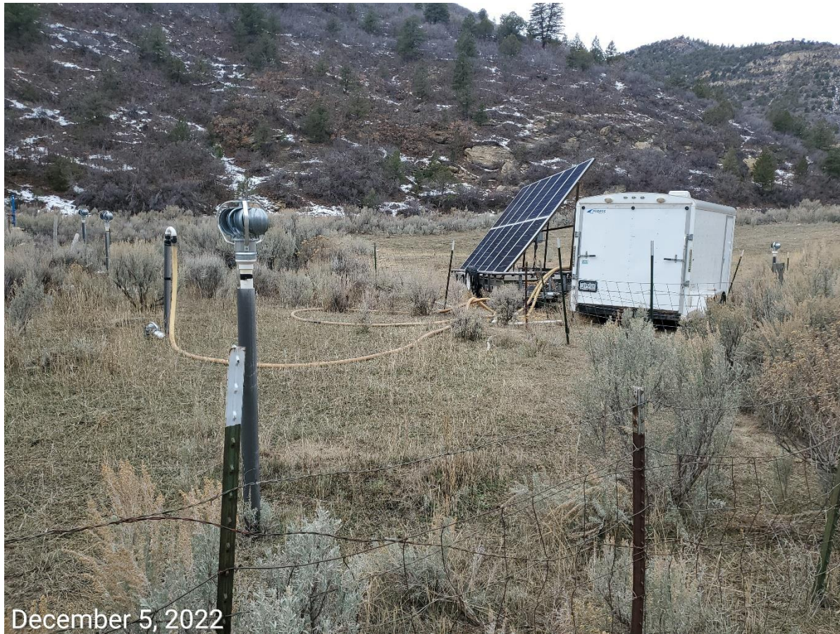
Photo 5: Photo shows solar equipment and 5 SVE wells associated with remediation project #9341.