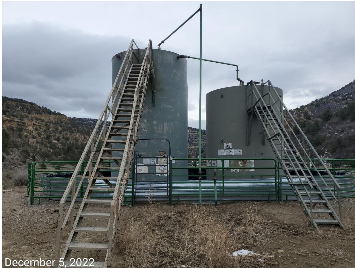
Photo 3: Photo shows tank battery facility on the east end of the Location. Facility signage not observed at battery.