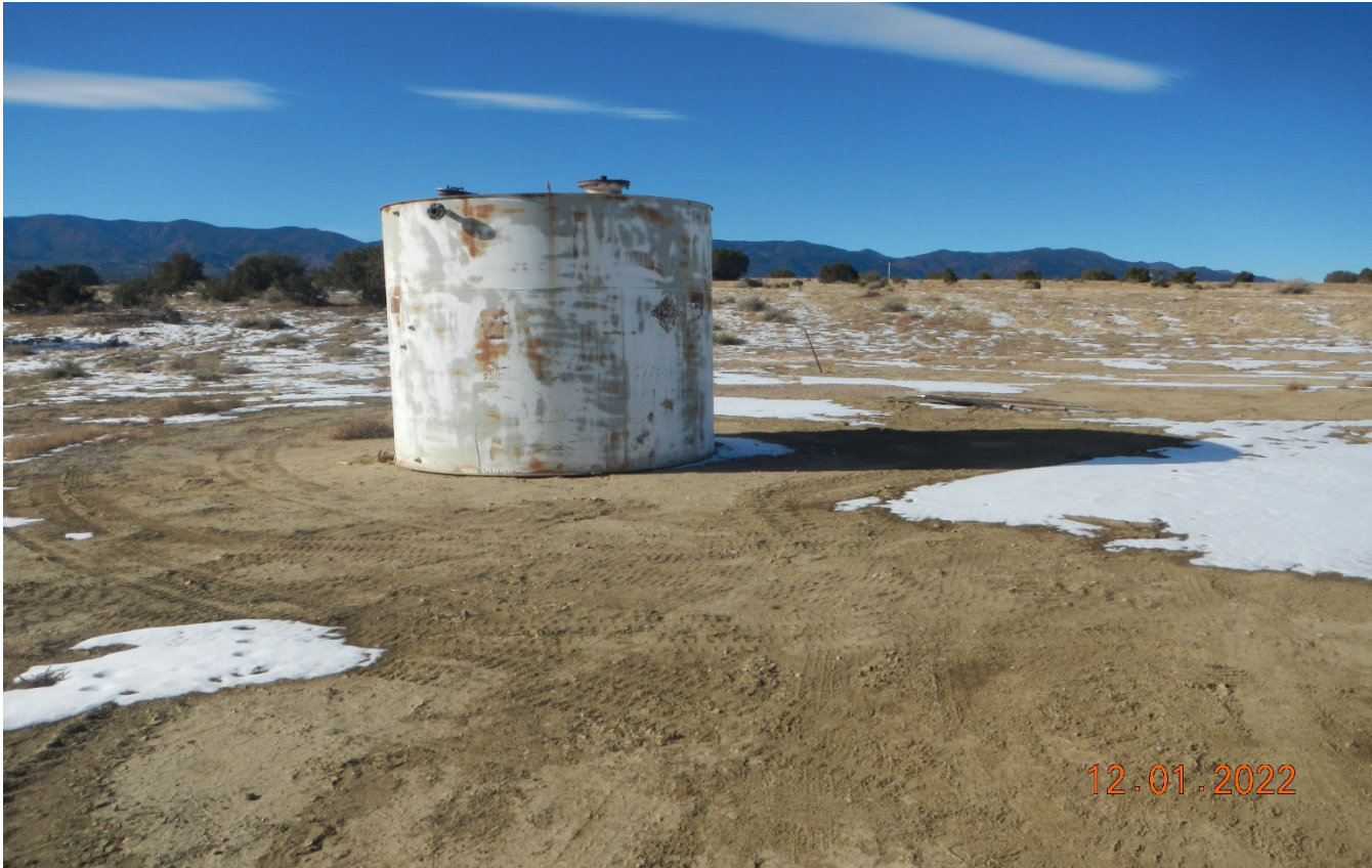
Photo 3. There is an unused tank that still remains at the location.