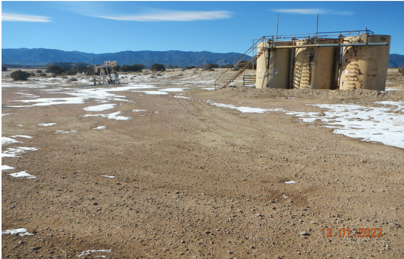
Photo 1. Facing southwest toward the location.