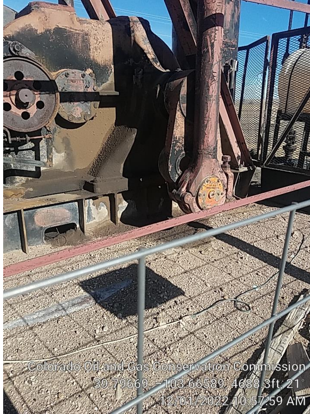
Pumping unit leak.

Colorado Oil and Gas Conservation Commission 39 79669 -103 66589 4688.3ft, 21° 12/01/2022 10:57:59 AM