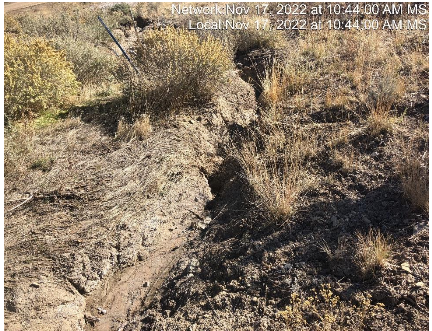
Phot #8412 Gully erosion occurring in access road ditch