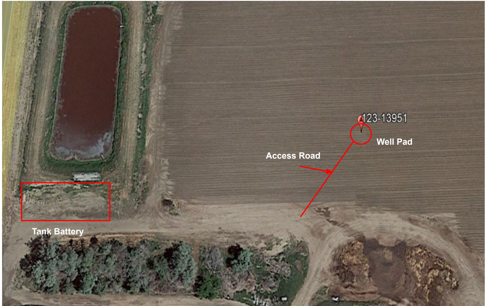
Photo 1. 2021 aerial imagery of the well pad, access road and tank battery.