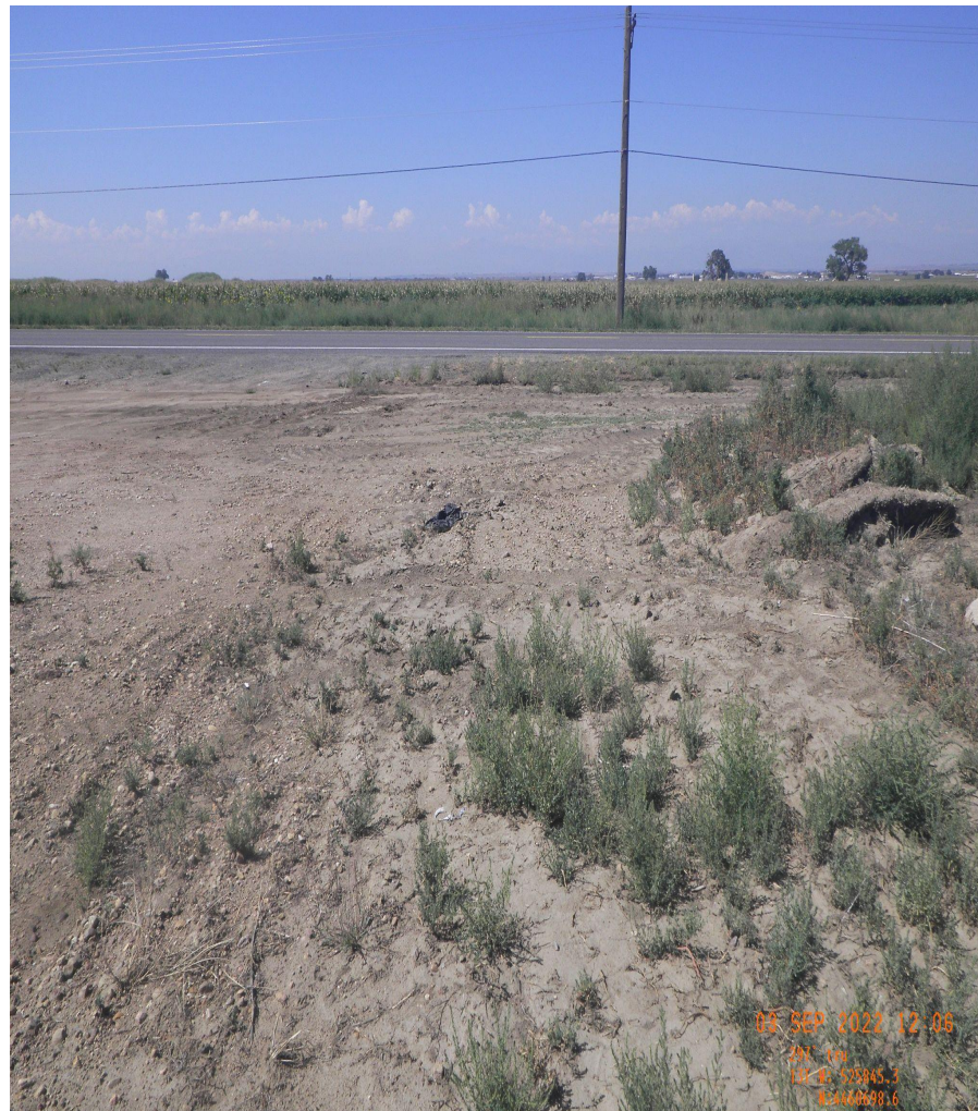
Photo 5. Cardinal photos taken from the middle of the tank battery. Left photo facing south, right photo facing west. Note: sign falls within an unmanaged area along the edge of the agriculture access road. No signs of oil or gas operations observed.