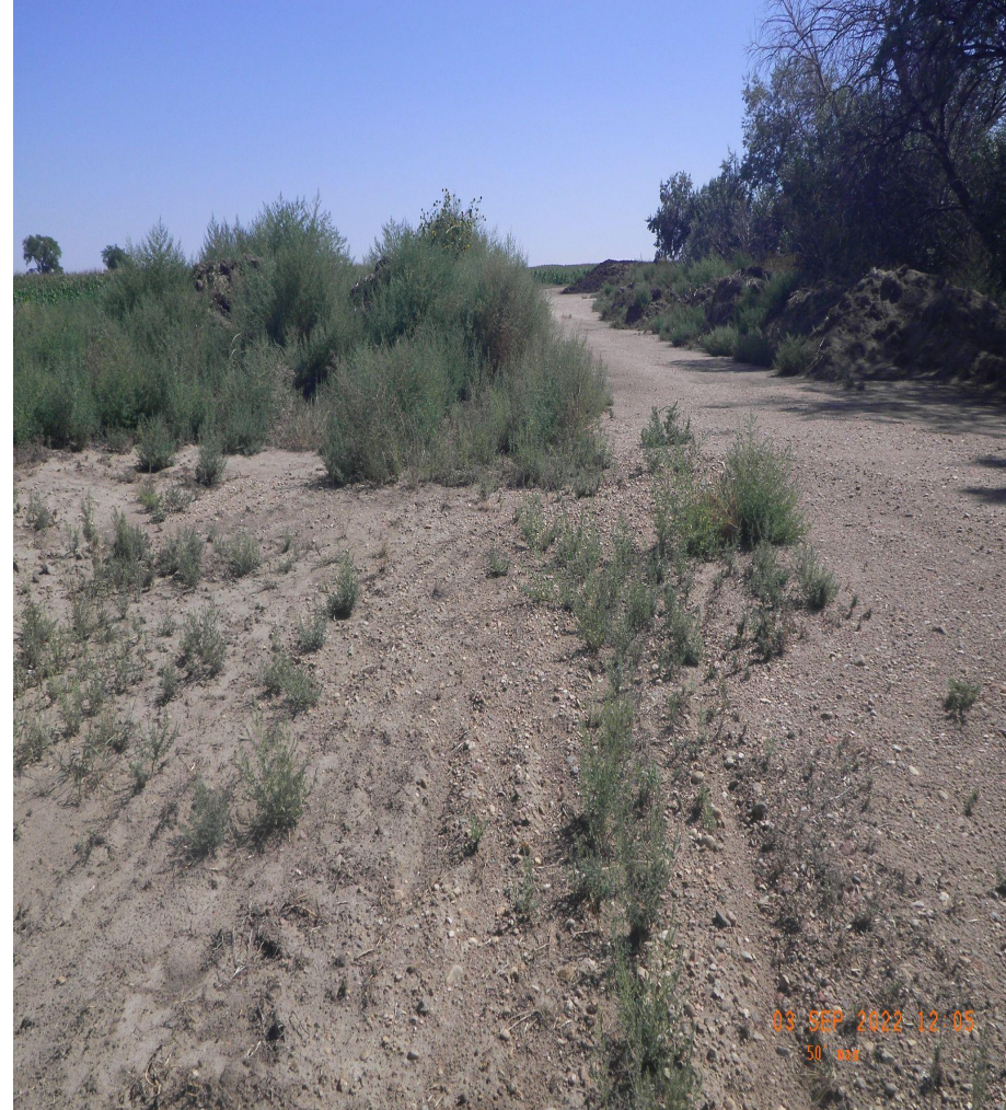
Photo 4. Cardinal photos taken from the middle of the tank battery. Left photo facing north, right photo facing east.