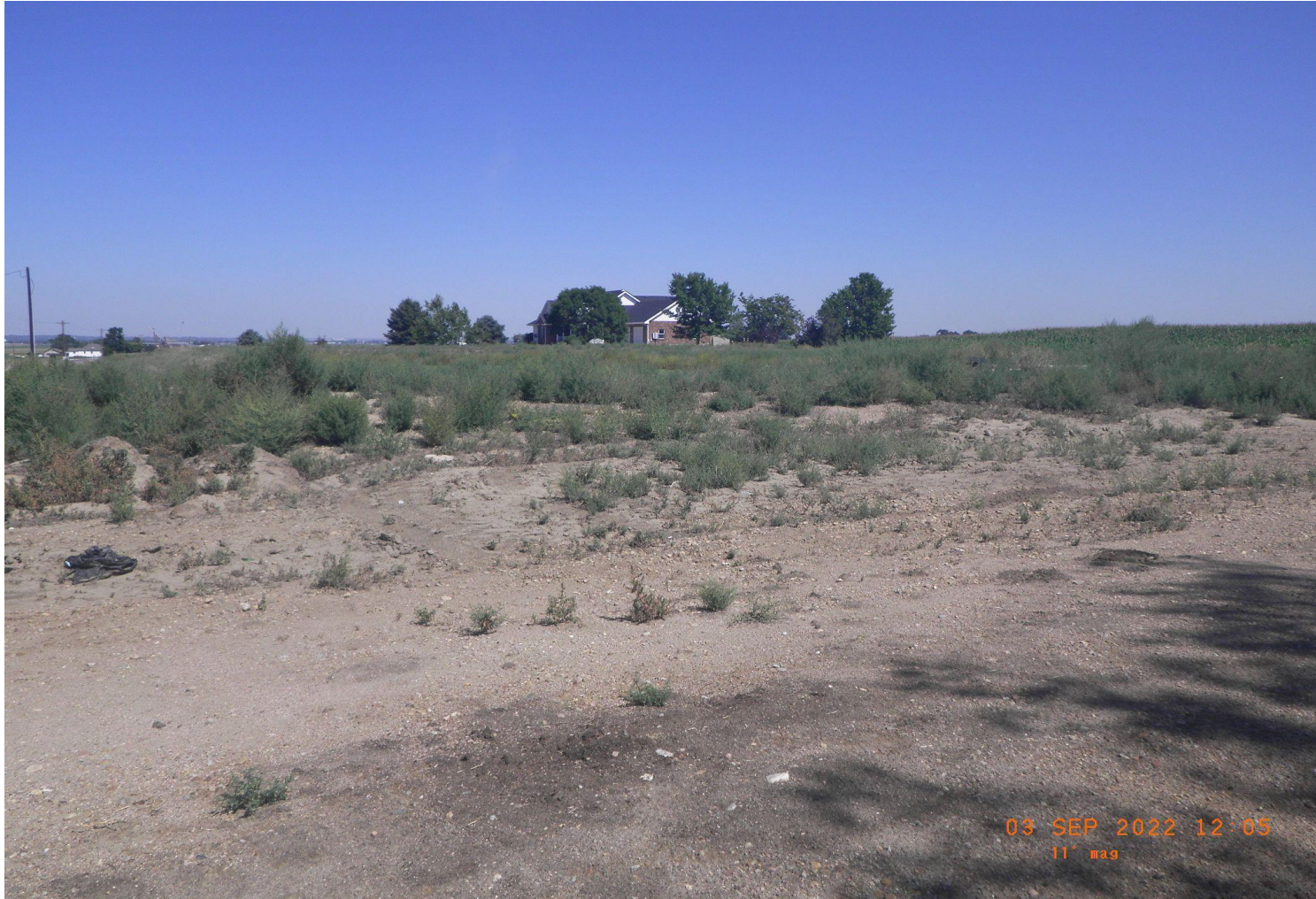
Photo 3. Overview photo of the tank battery taken at ground level from the eastern edge facing north.