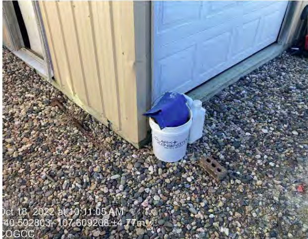
Debris/storage of equipment