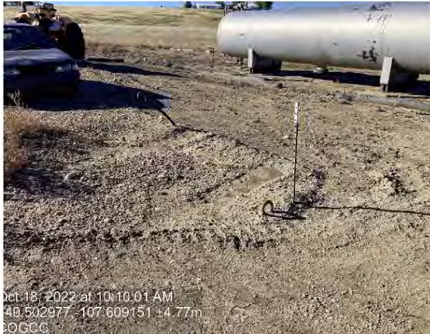
Dead man not marked properly