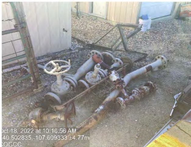
Unmarked tank/stored equipment

Bayless has been actively working on disposal of empty, unused butane tank. Will continue trying to get this removed.