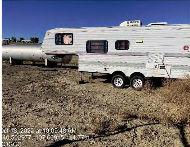
Storage of equipment next to production equipment