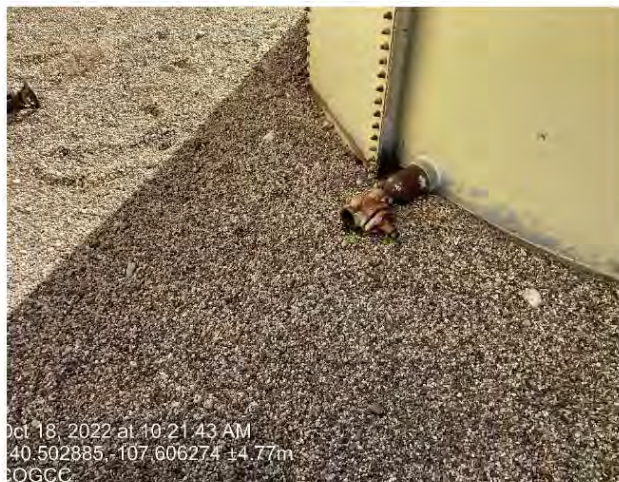
Load line missing cap/plug