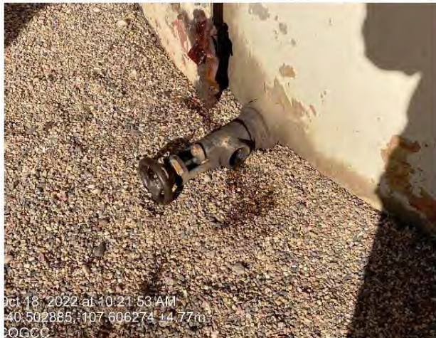
Load line missing cap/plug and some staining