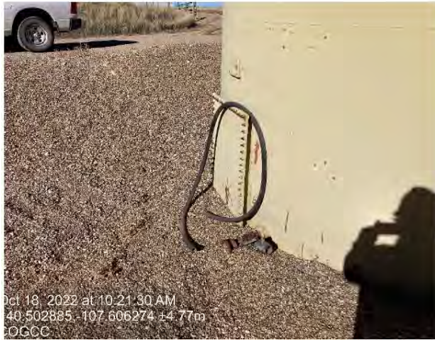
Load line missing cap/plug and debris