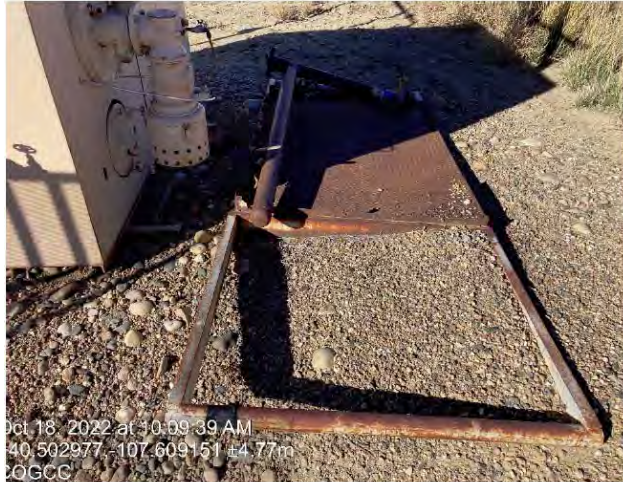
Debris/storage of equipment