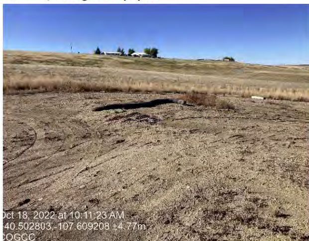
Debris/storage of equipment