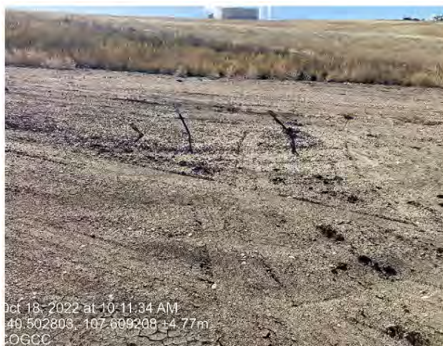
Dead men not marked properly