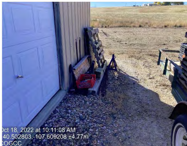
Debris/storage of equipment