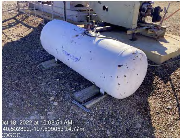
Unmarked propane? tank