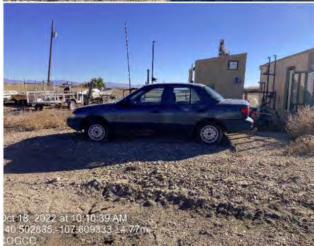
Storage of equipment next to production equipment