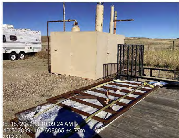
Storage of equipment next to production equipment