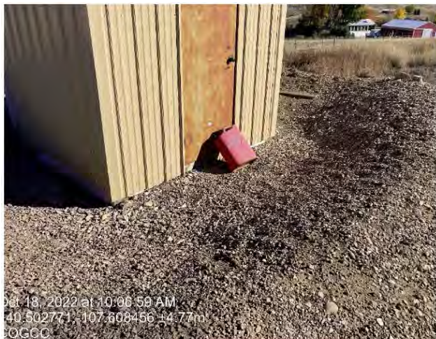
Debris/ unmarked can