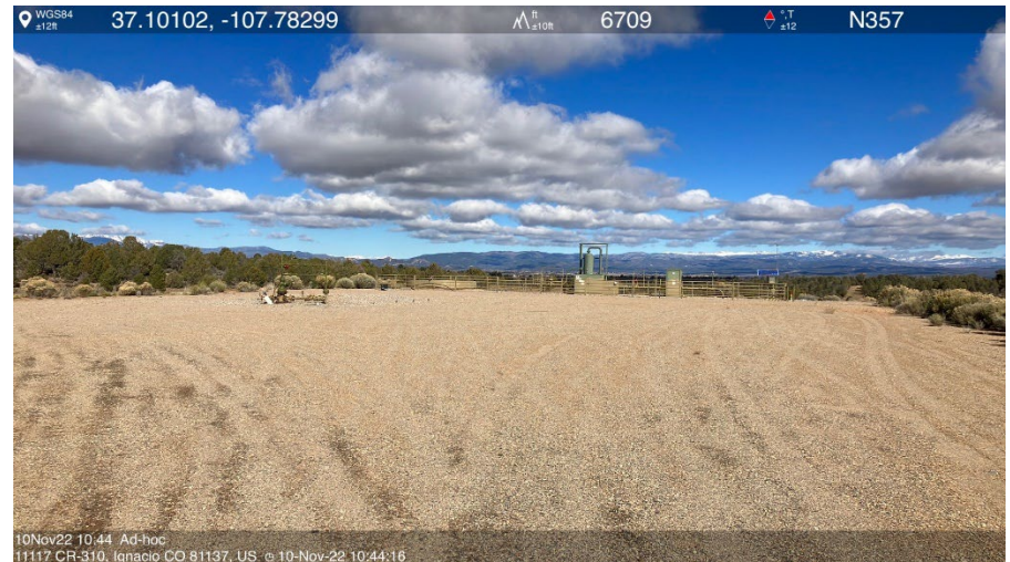
IMG 02 Location overview