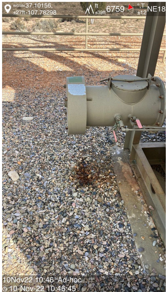
IMG 03 Produced water release