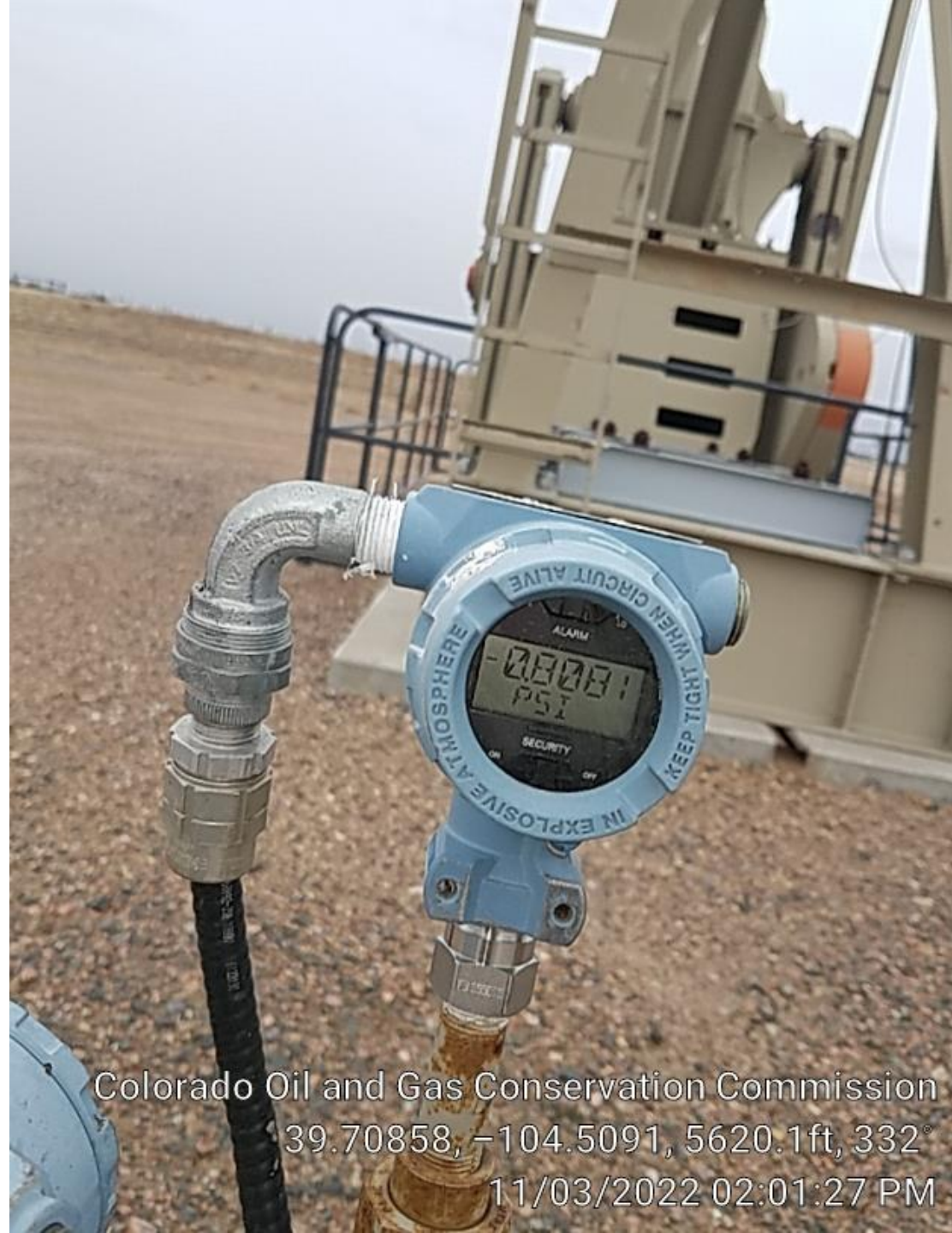
Krout Bradenhead pressure.

Colorado Oil and Gas Conservation Commission 39.70858, -104.5091, 5620.1ft, 332° 11/03/2022 02:01:27 PM