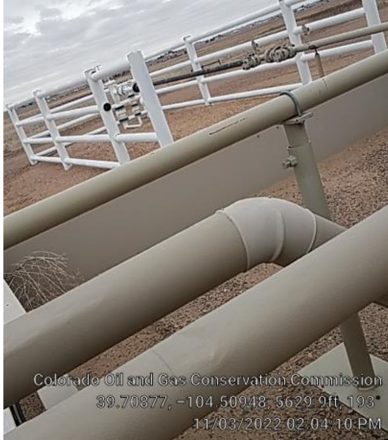
Abandoned Third Creek gas sales line.

Colorado Oil and Gas Conservation Commission 39.70877, -104.50948, 5629.9ft, 193° 11/03/2022 02:04:10 PM