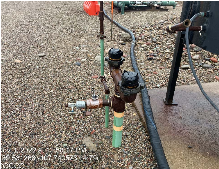
Lines disconnected from stored equipment