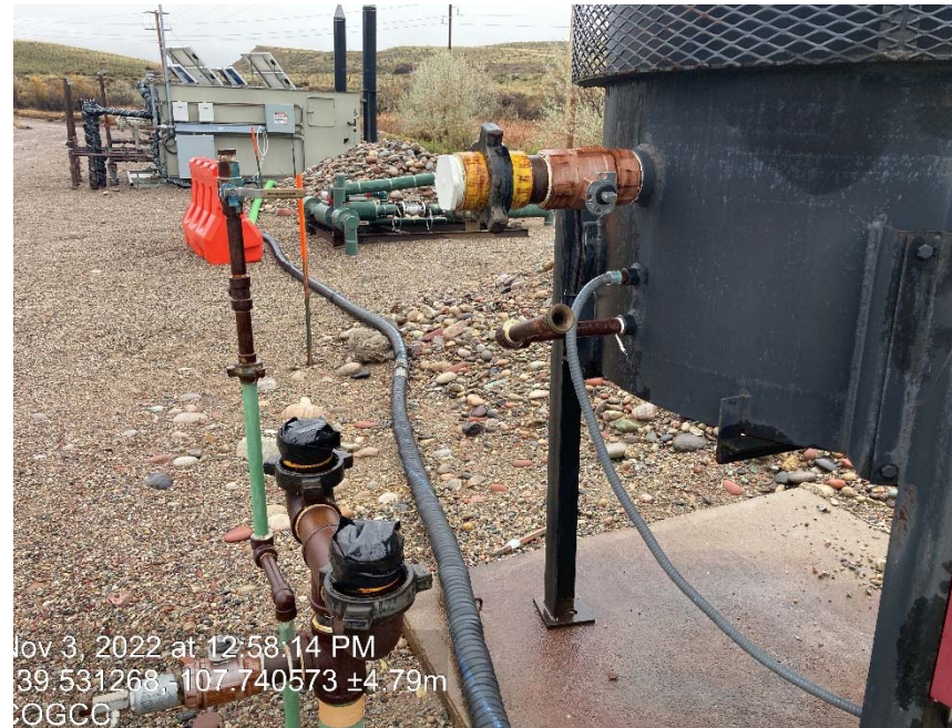
Lines disconnected from stored equipment