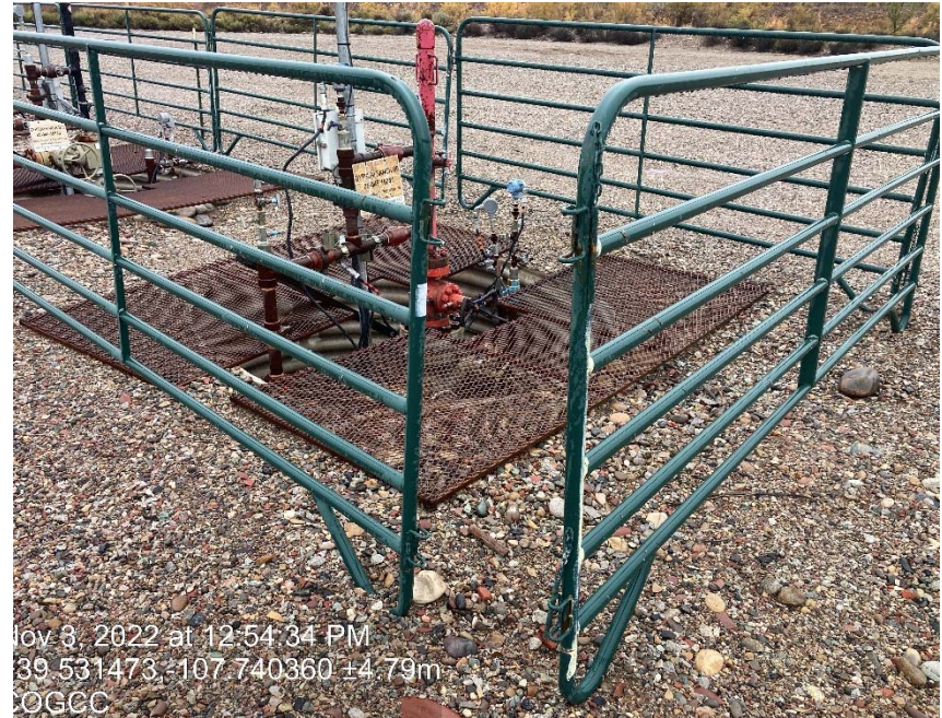
Fencing is open to well heads