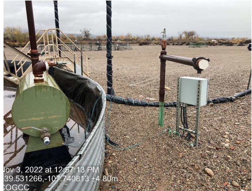
Lines disconnected from stored equipment