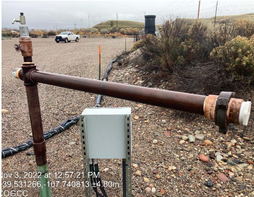
Lines disconnected from stored equipment