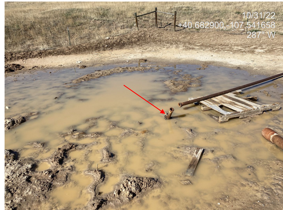
Photo 3. Photo taken from the northwest shows a pipe remaining at the produced water tank facility. Pipe must be removed. Photo also shows waste/debris.