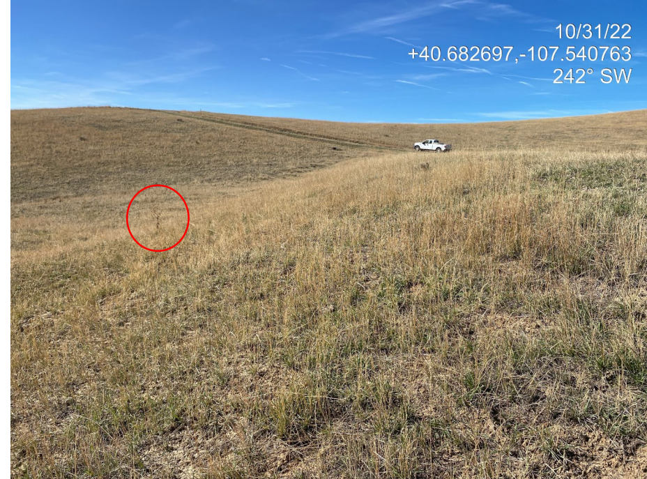
Photo 9. Photo shows interim areas at the south of the Location are well vegetated with perennial grasses. Red circle indicates a List B noxious thistle.