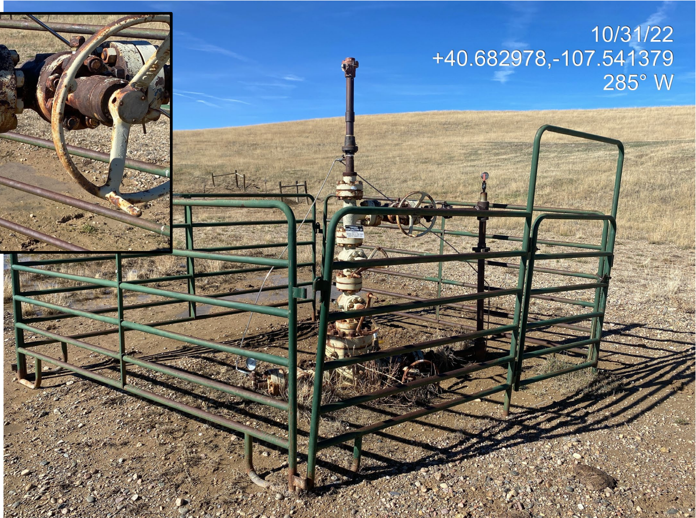
Photo 7. Photo shows the wellhead. Wellhead sign does not comply with Rule 605.d.