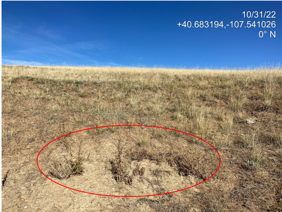
Photo 8. Photo shows an example of Canada thistle (List B Noxious) found occasionally throughout the Location.