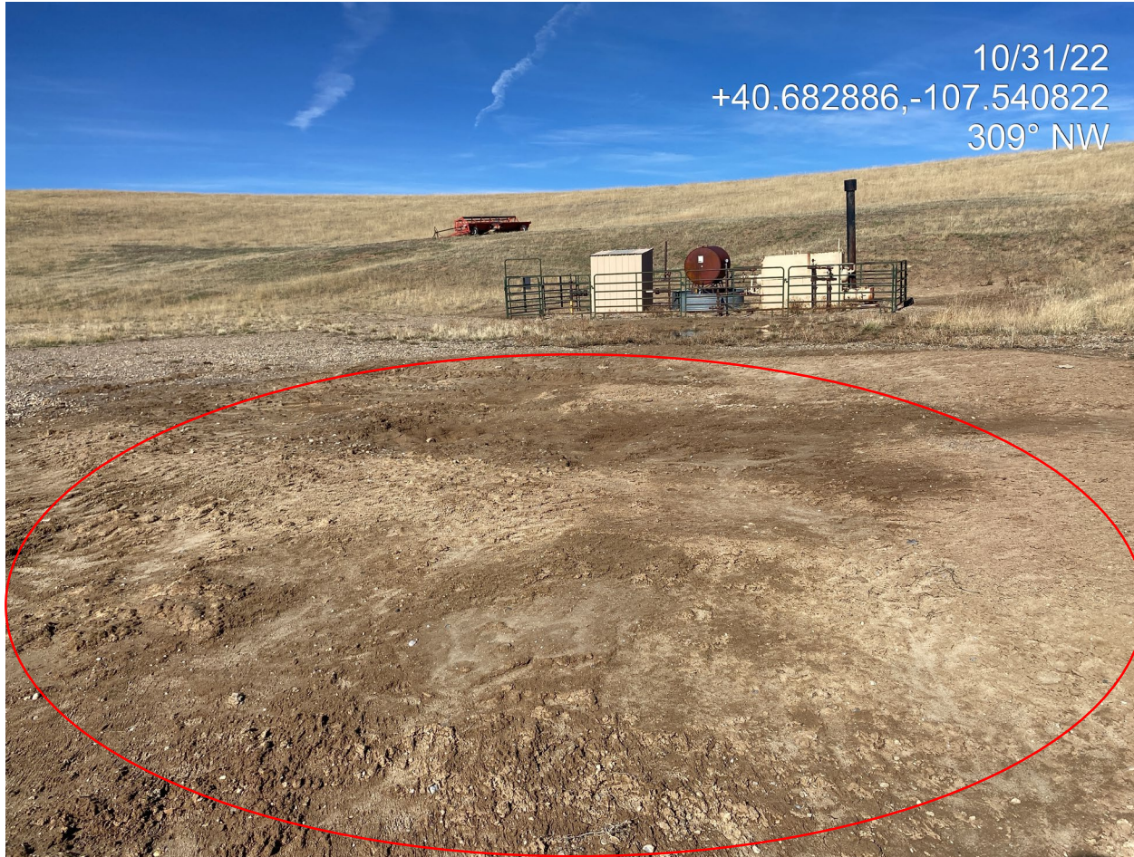
Photo 4. Photo taken from the southeast of the Location shows a decommissioned partially buried vessel facility. Decommissioned facilities require site investigation and remediation followed by interim reclamation after compliance with 915-1 standards.