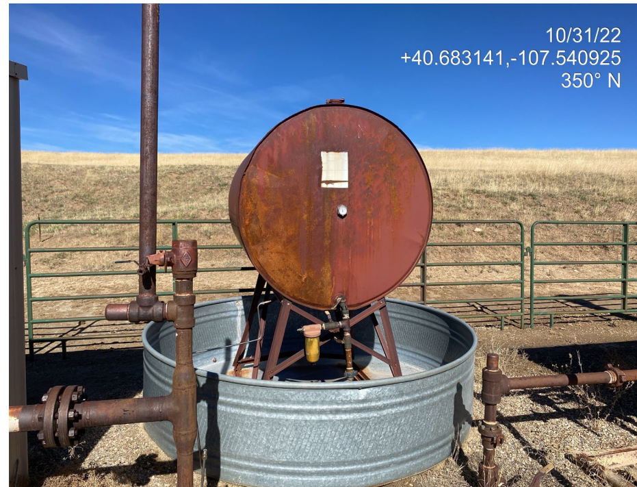
Photo 6. Photo taken from the northeast. The methanol tank secondary containment lacks wildlife protection BMPs. Tank label is faded and illegible.