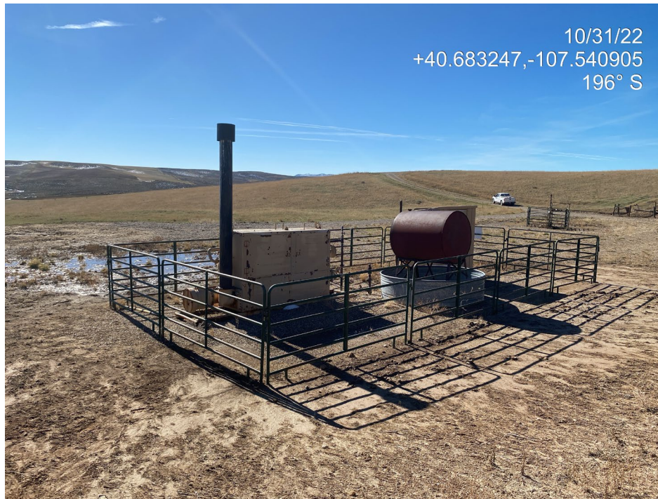
Photo 5. Photo taken from the northeast shows equipment.