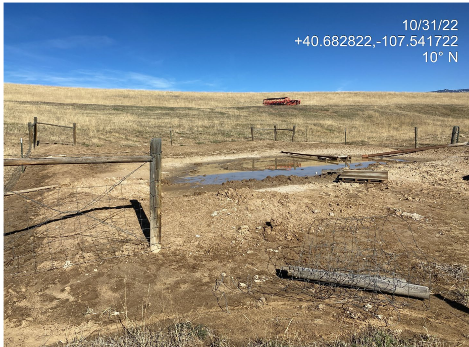
Photo 2. Photo taken from the northwest shows a decommissioned produced water tank facility. Decommissioned facilities require site investigation and remediation followed by interim reclamation after compliance with 915-1 standards. Photo also shows waste/debris.