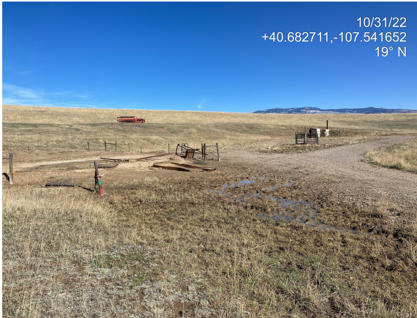
Photo 1. Photo taken from the southwest shows an overview of the Location.