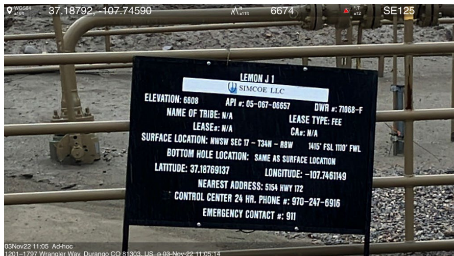
IMG 01 Well sign