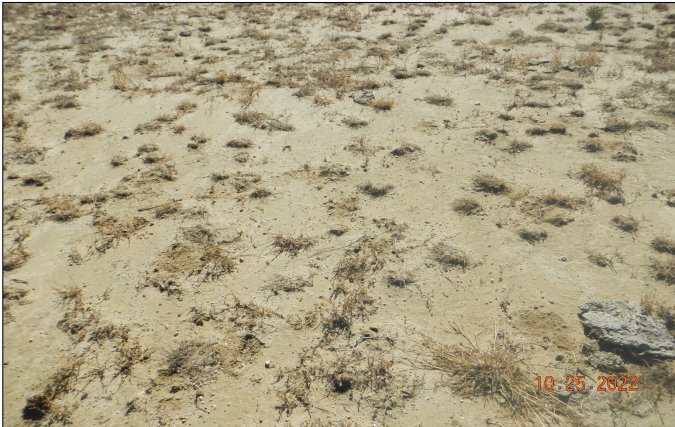
Photo 6. View of ground cover.