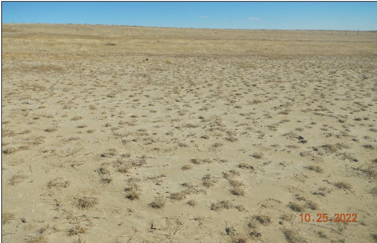
Photo 5. Facing east at the center of the location.