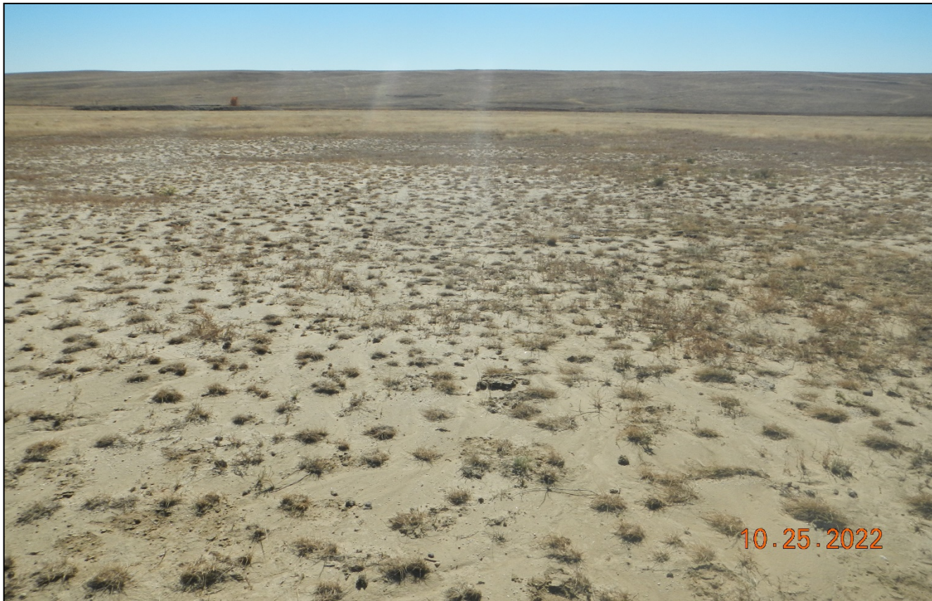
Photo 4. Facing south at the center of the location.