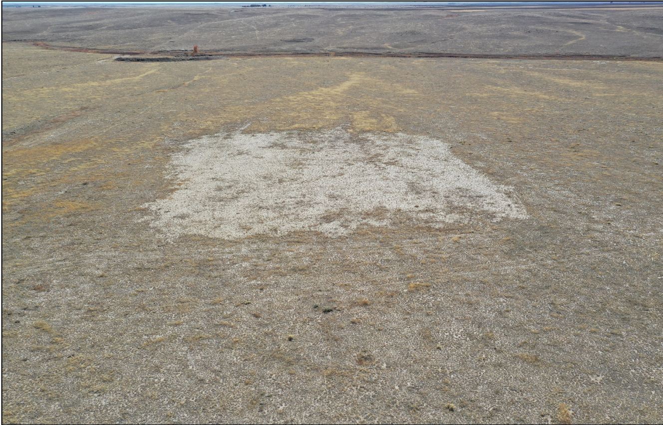
Photo 1. Drone aerial photo facing south down toward the location. There are areas of the location that have not adequately established vegetation cover.