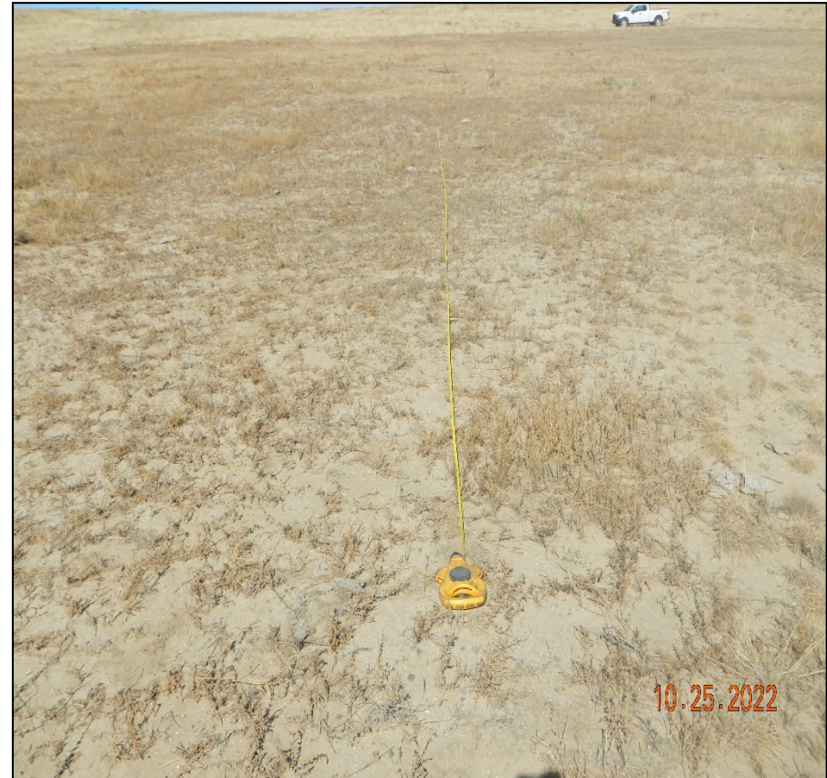
Photo 8. Facing north at the end of the transect at the location.