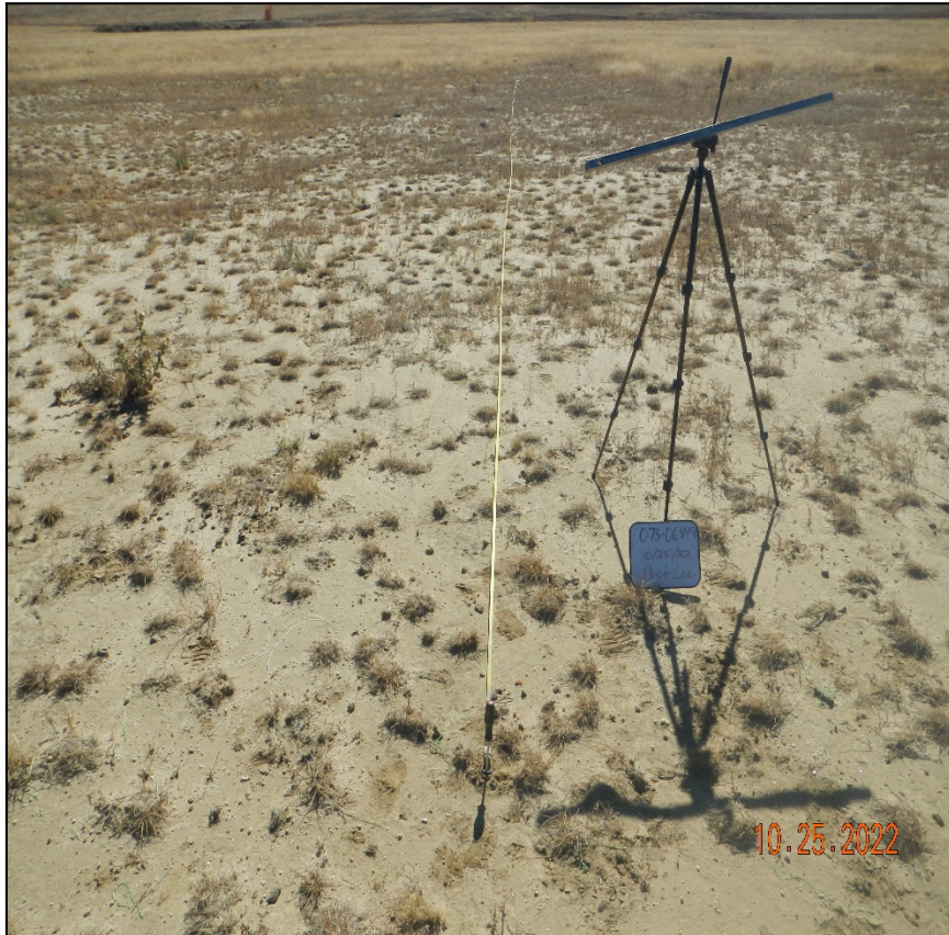
Photo 7. Facing south at the beginning of the transect at the location.