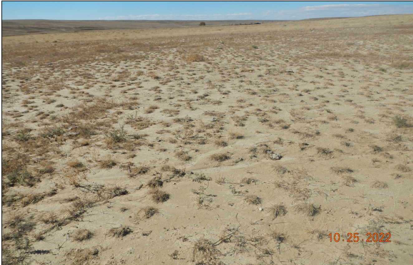
Photo 3. Facing west at the center of the location.