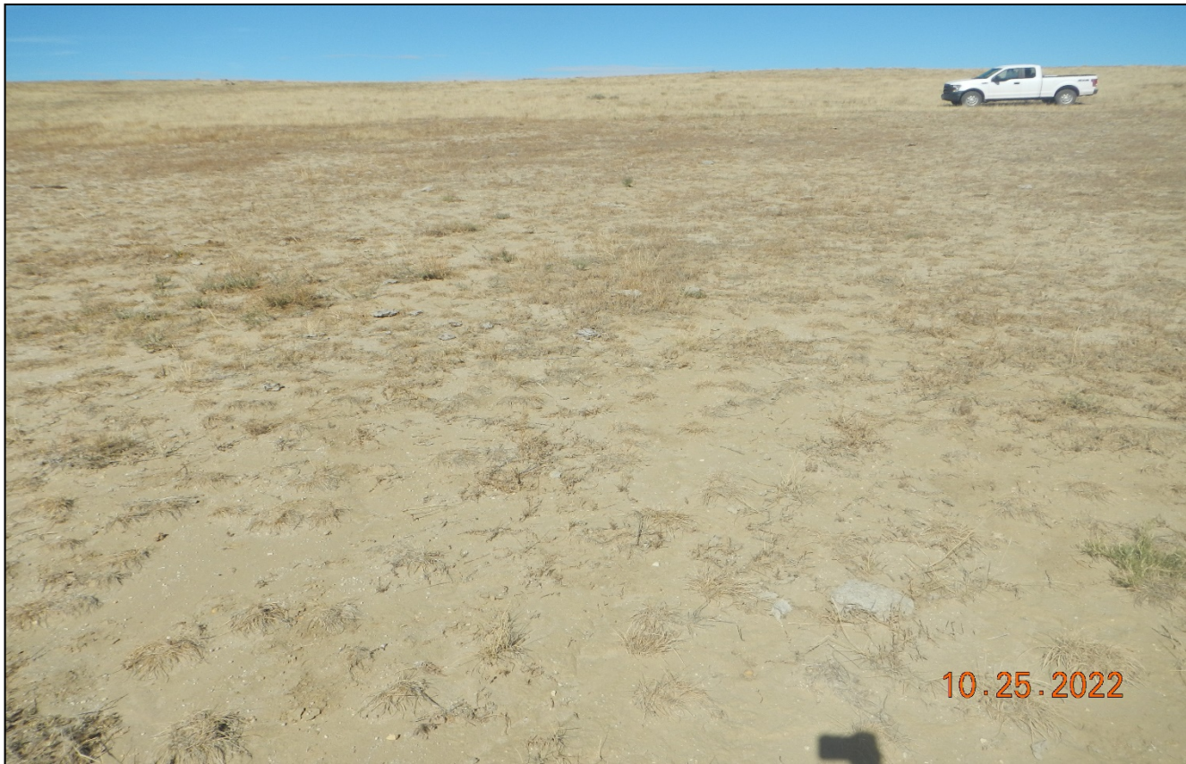
Photo 2. Facing north at the center of the location.