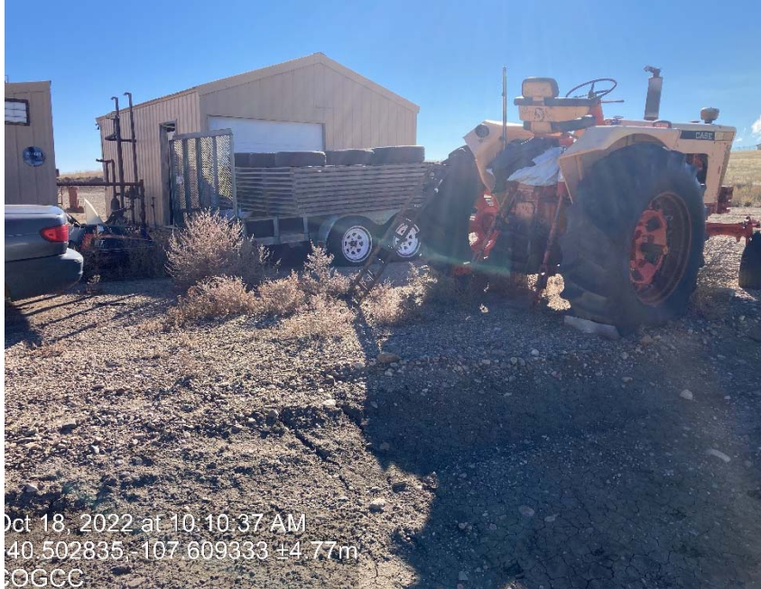
Storage of equipment next to production equipment