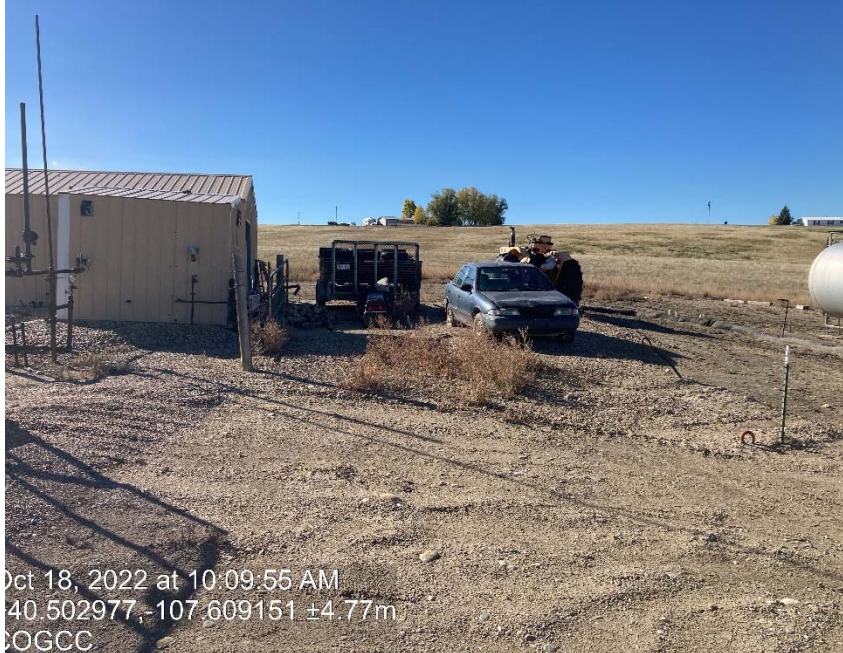
Storage of equipment next to production equipment