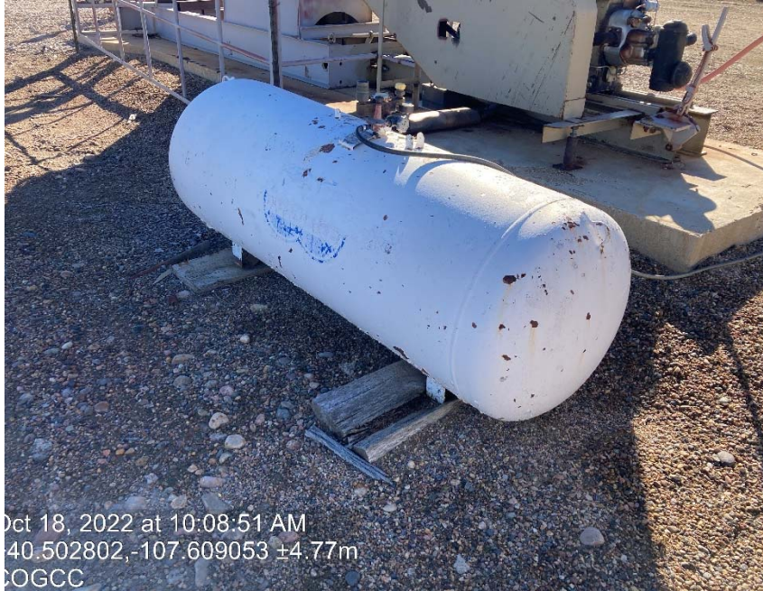
Unmarked propane? tank