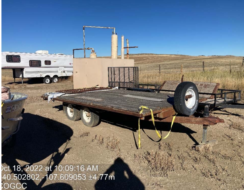
Storage of equipment next to production equipment