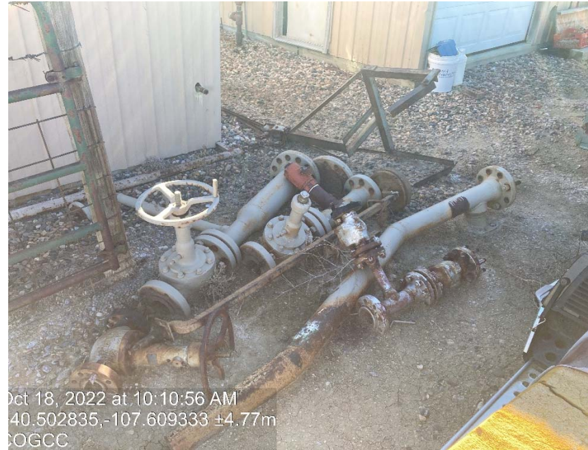
Debris/storage of equipment