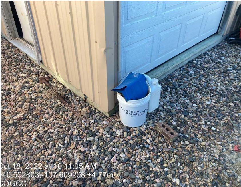
Debris/storage of equipment