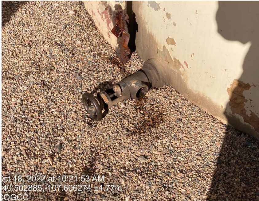
Load line missing cap/plug and some staining