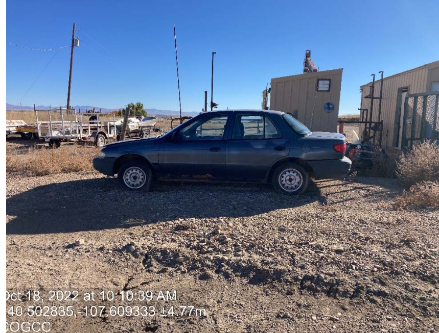
Storage of equipment next to production equipment