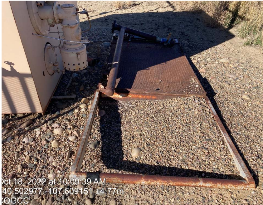
Debris/storage of equipment