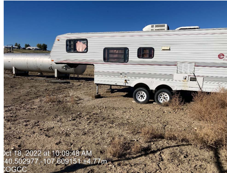
Storage of equipment next to production equipment