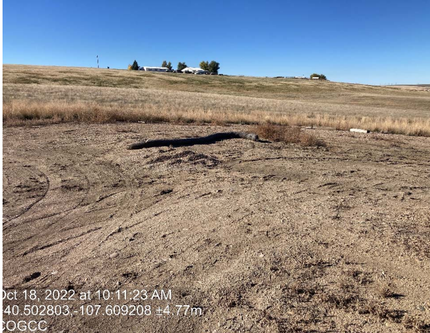
Debris/storage of equipment