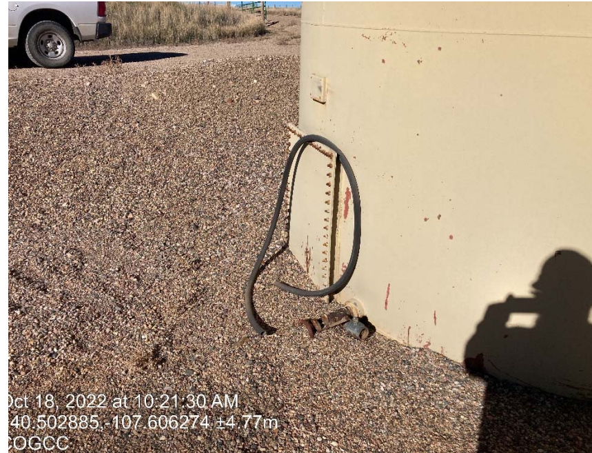
Load line missing cap/plug and debris