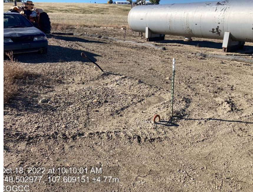
Dead man not marked properly