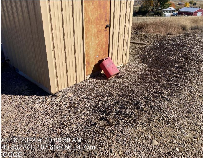
Debris/ unmarked can