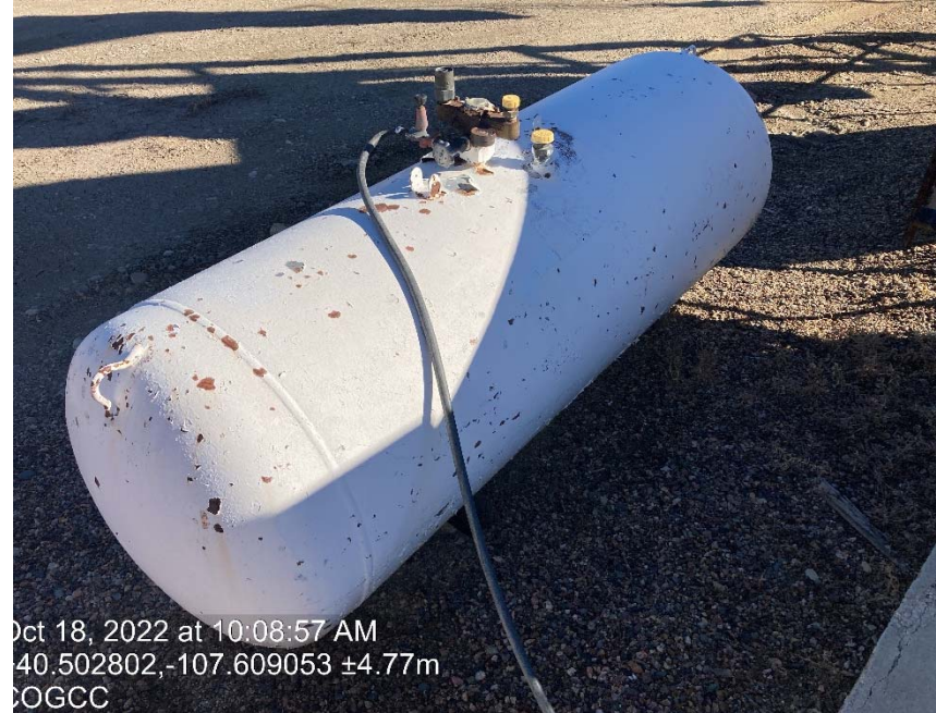
Unmarked propane? tank