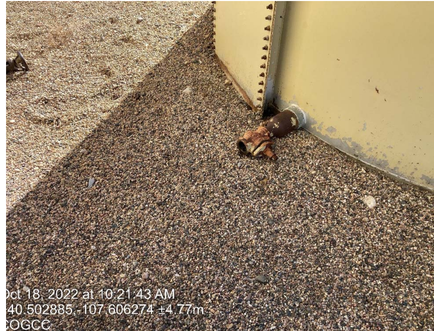
Load line missing cap/plug