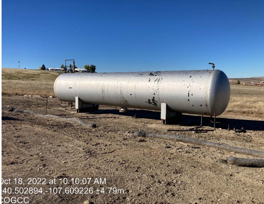
Unmarked tank/stored equipment