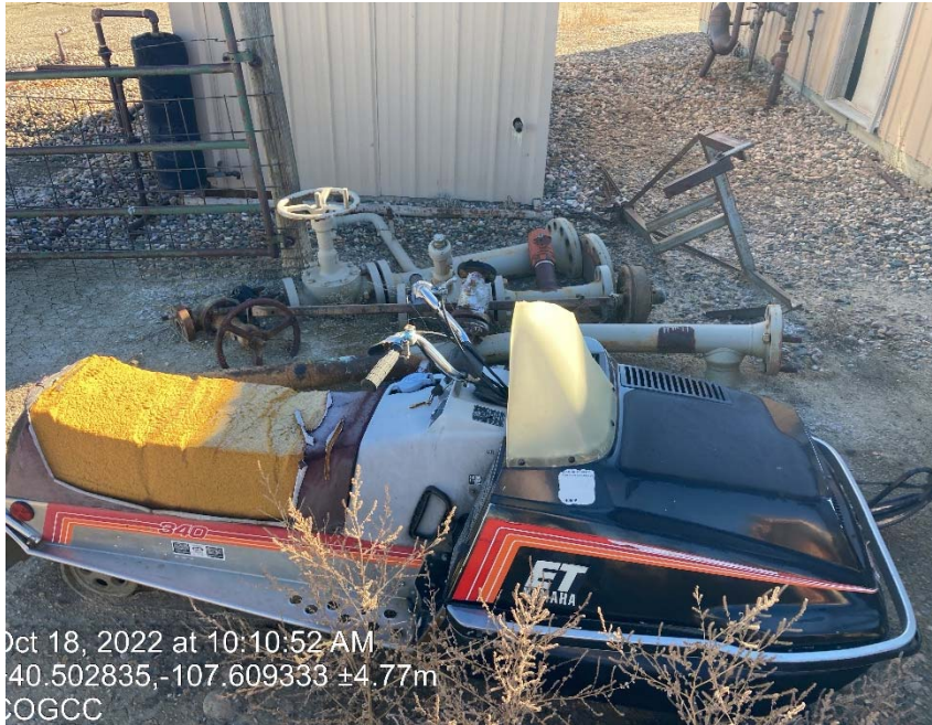
Debris and Storage of equipment next to production equipment