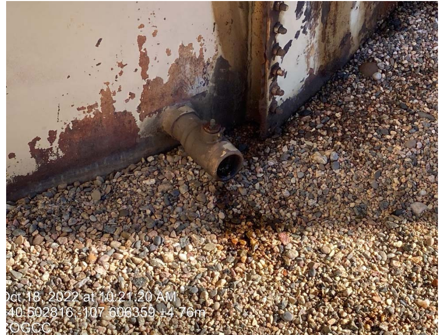
Load line missing cap/plug and leaking