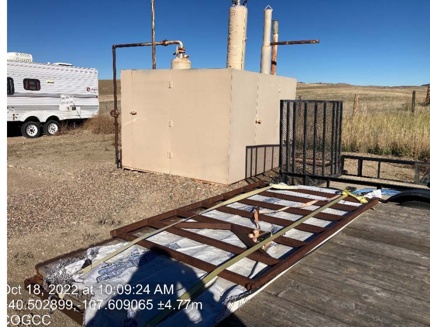
Storage of equipment next to production equipment