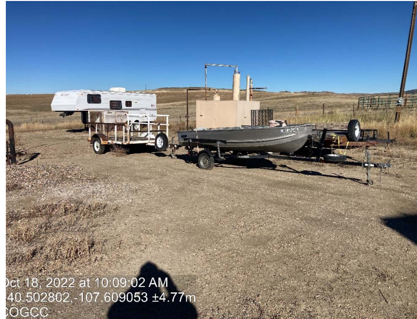
Storage of equipment next to production equipment