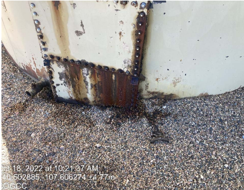
Load line missing cap/plug and manway is leaking with staining