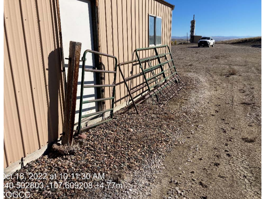
Debris/storage of equipment