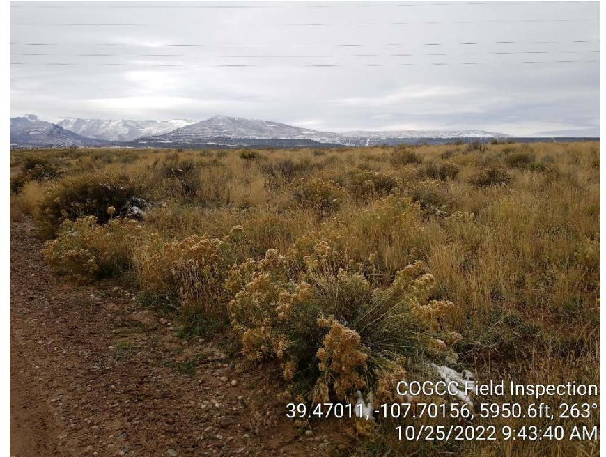
Photo #3 – Overview of reported Spill/Release location, looking west.