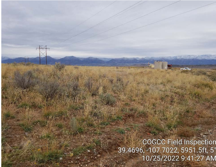
Photo #2 – Overview of reported Spill/Release location, looking northeast.