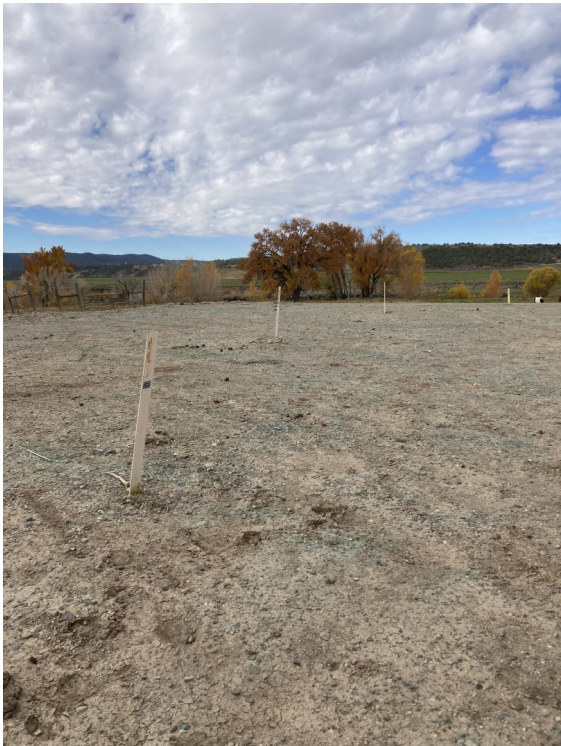
Replaced all of the damaged rig anchor markers on the location.