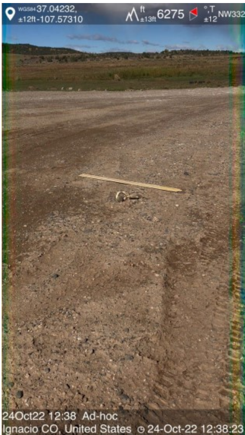
Picture of downed rig marker from the INC.

: Rig anchors not secured properly (IMG 07).