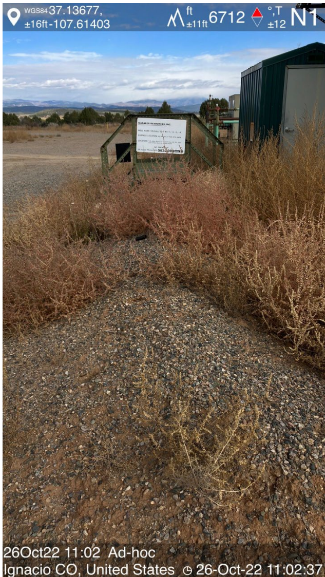
IMG 05 Weeds on berms