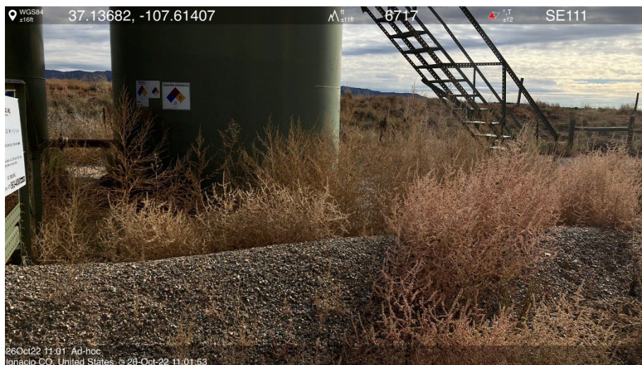
IMG 03 Weeds at produced water tank