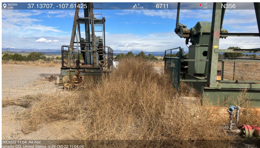
IMG 07 Weeds at 4-1 and 4-2 pump jack