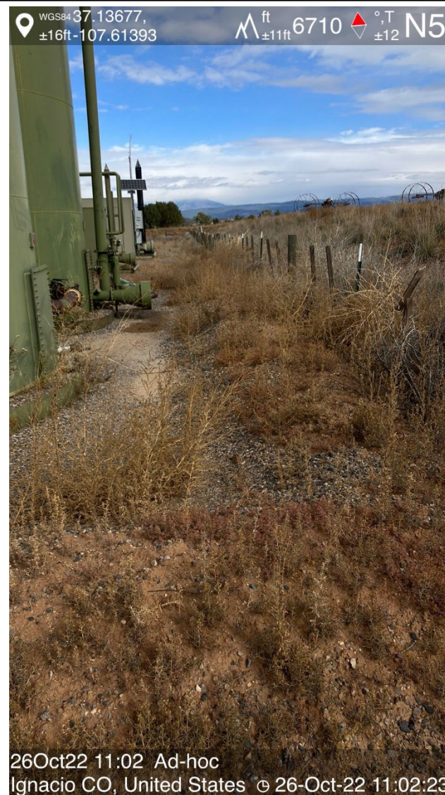
IMG 04 Weeds on berms