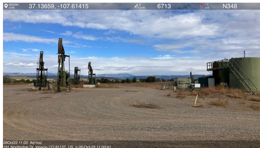
IMG 02 Location overview