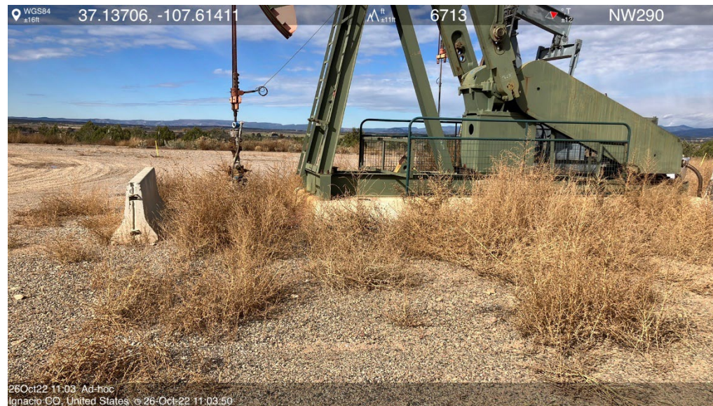
IMG 06 Weeds at 4-2 pump jack