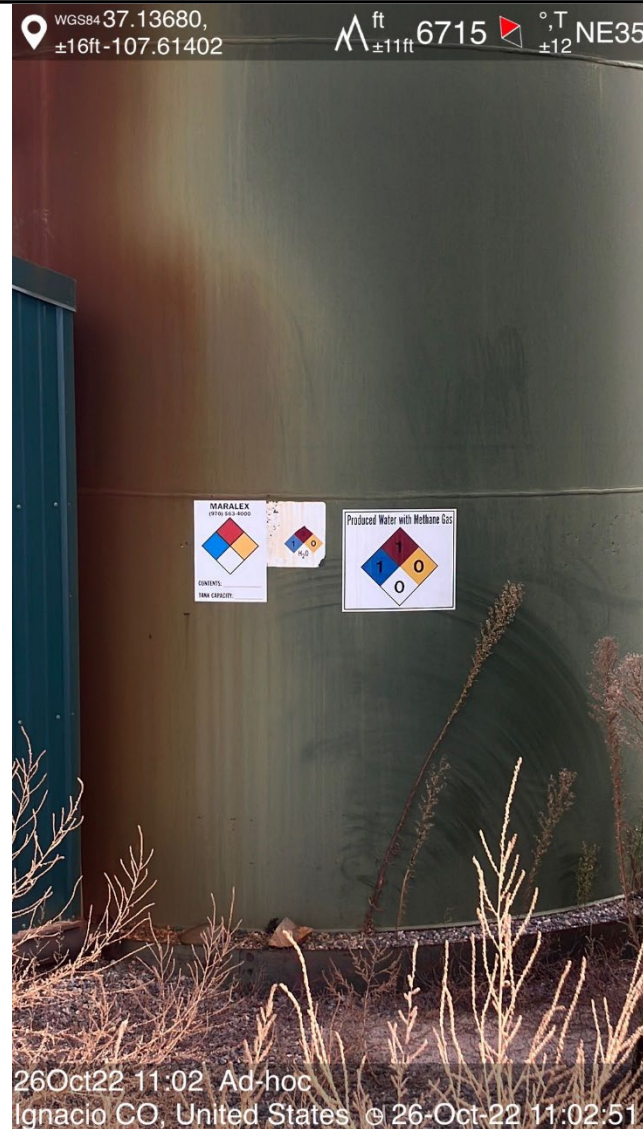
IMG 08 Tank capacity not labeled.