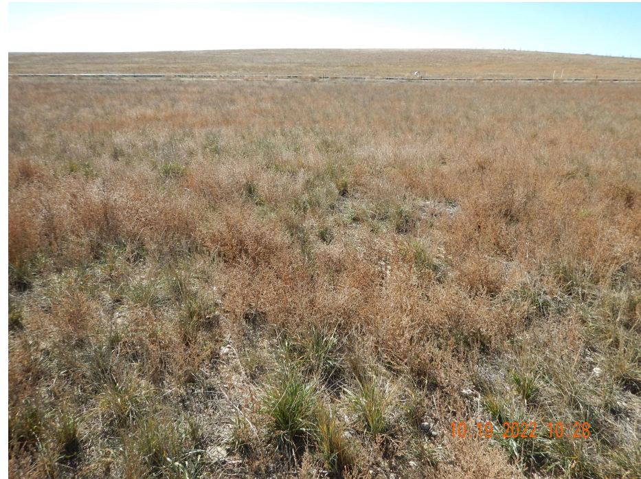
Photo 2. Photo taken from the central location, facing South. Photo illustrates the establishment of mostly introduced grass species and Kochia with some natives.