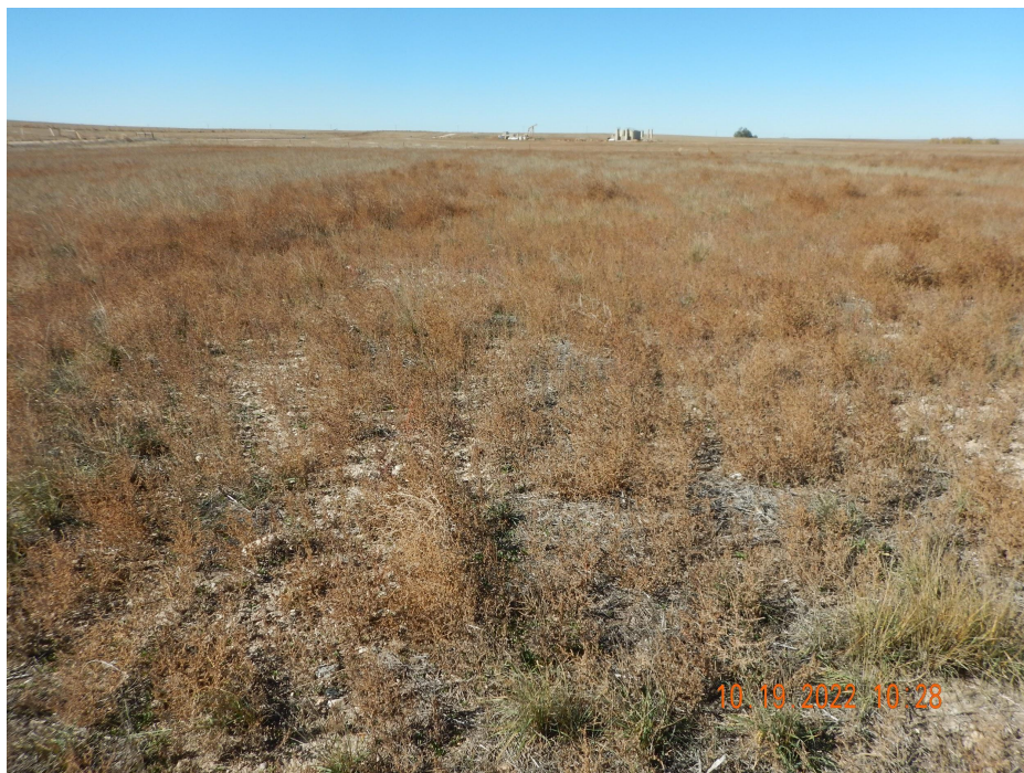
Photo 3. Photo taken from the central location, facing West. See comments under Photo 2.