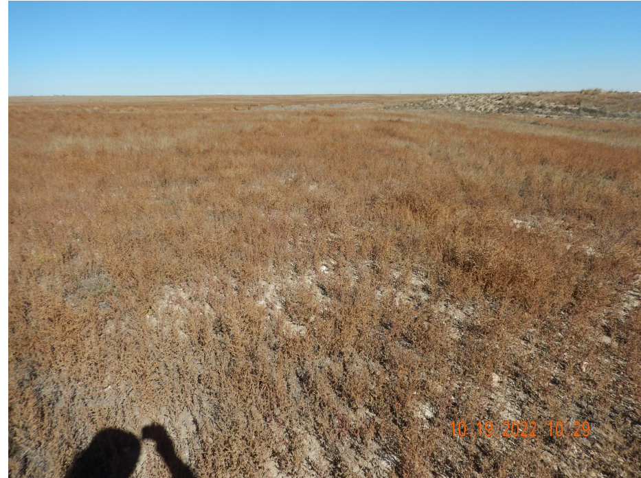
Photo 6. Photo taken from the northern location, facing North. See comments under Photo 5.