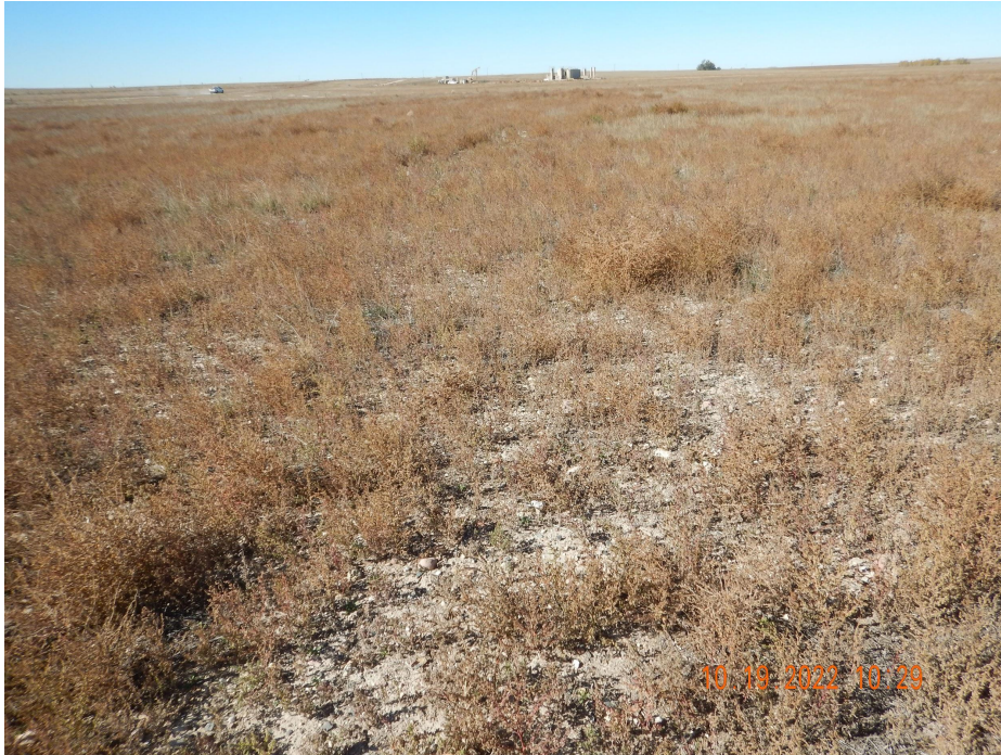
Photo 5. Photo taken from the northern location, facing West. Photo illustrates an area of annual, weedy Kochia establishment.