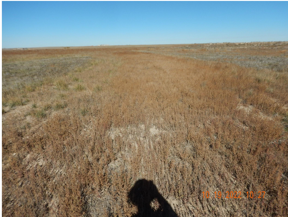
Photo 1. Photo taken from the former entrance of location, facing North. Photo illustrates the establishment of annual, weedy Kochia.