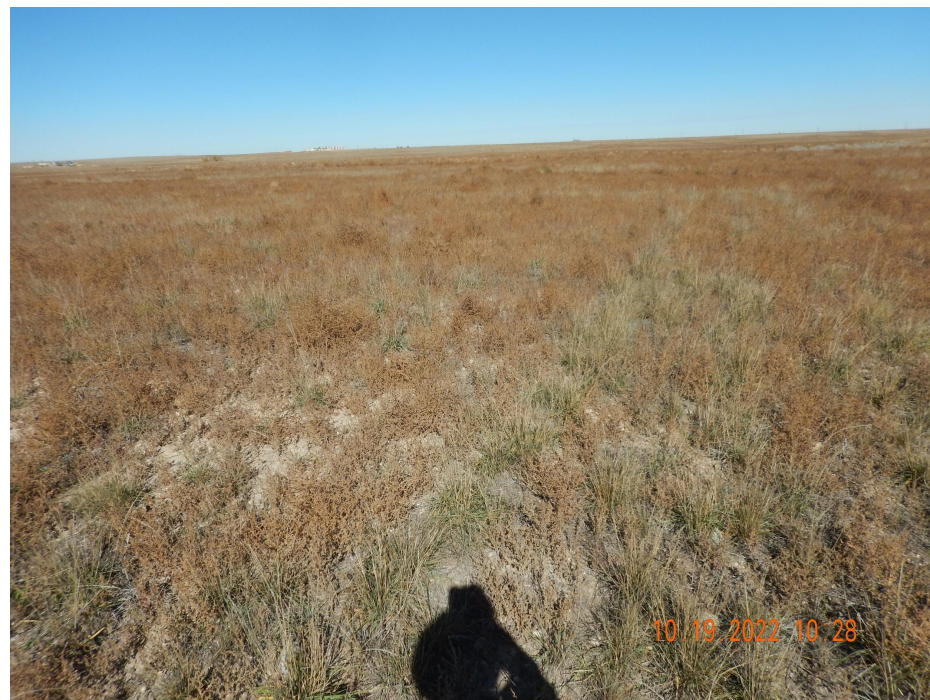
Photo 4. Photo taken from the central location, facing North. See comments under Photo 2.