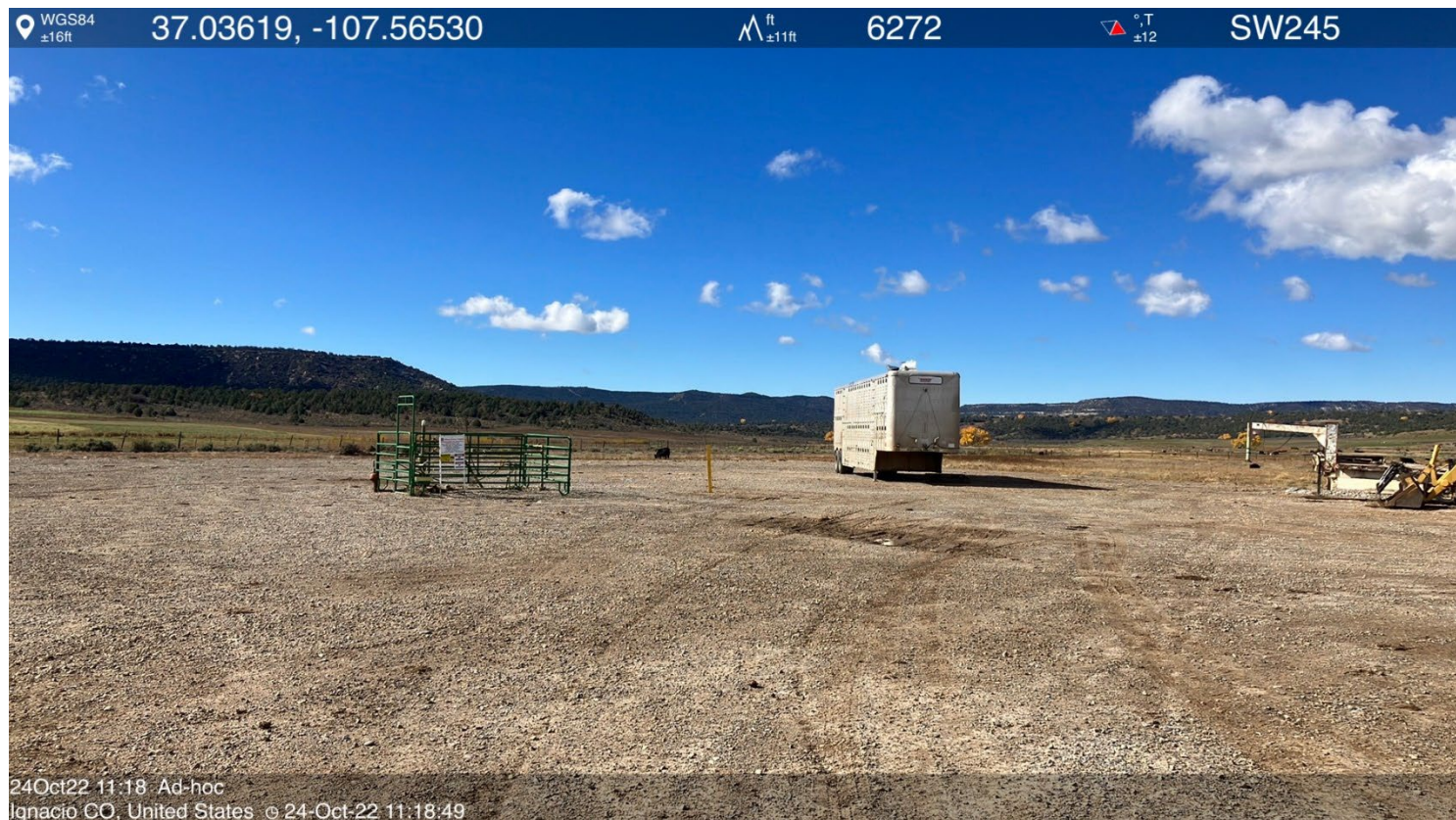
IMG 03 Landowner trailer