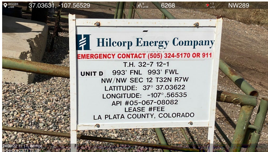
IMG 01 Well sign