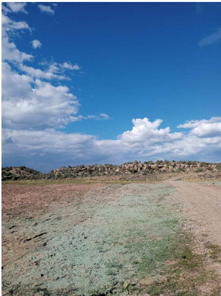
Hydroseed bare areas