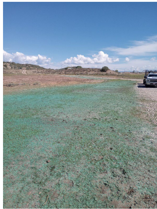
Hydroseed bare areas