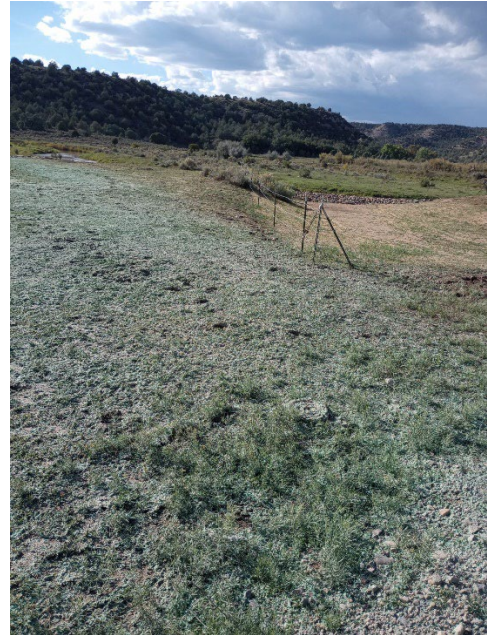
Hydroseed bare areas