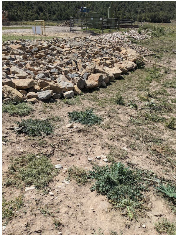
Selective weed control