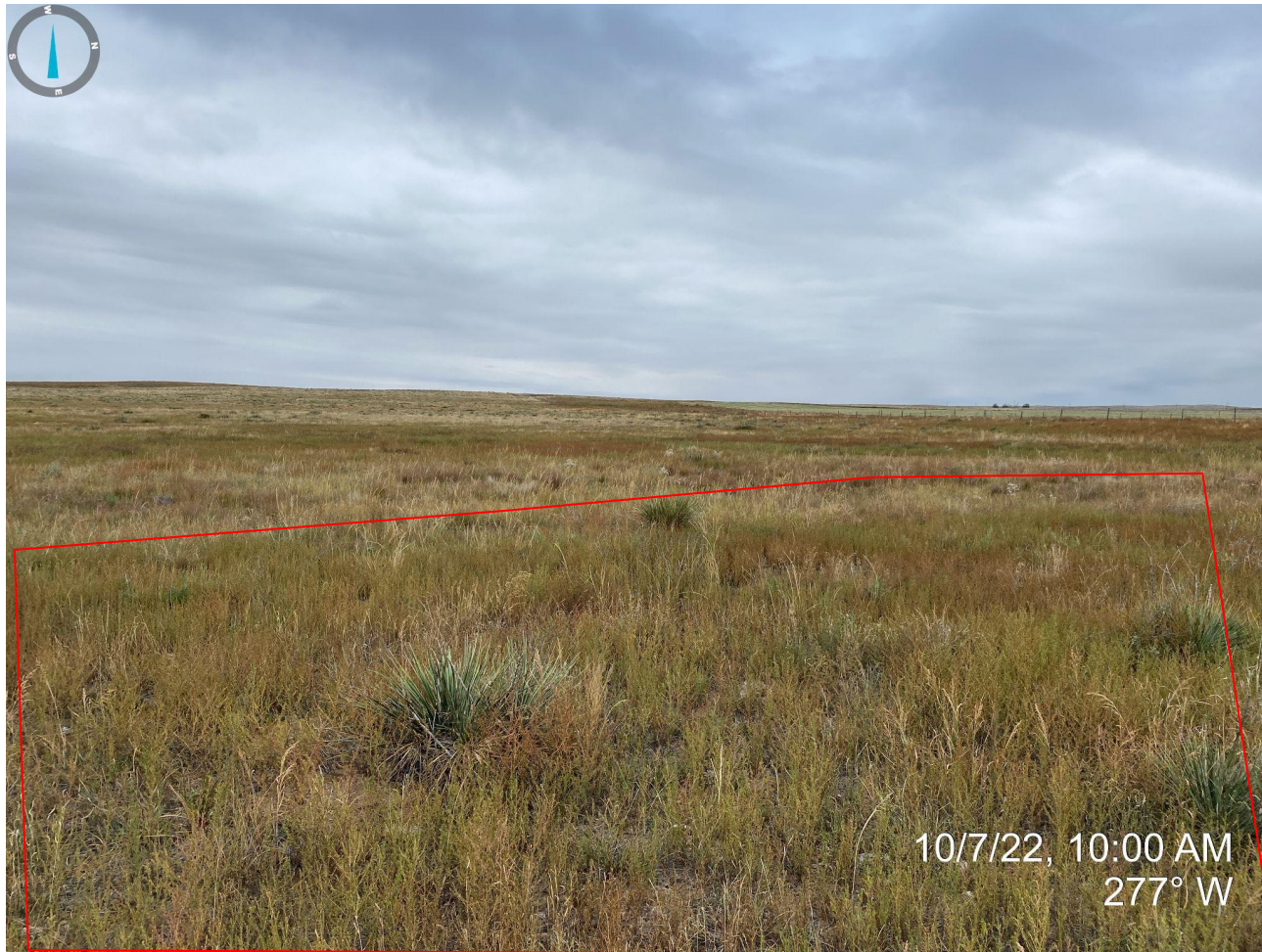
Photo 3. Facing west, see comments in Photo 1.