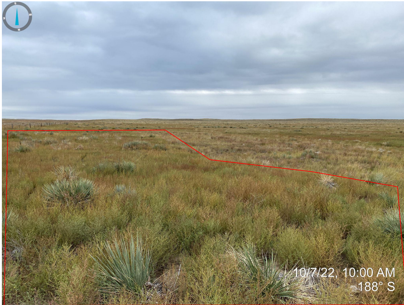
Photo 4. Facing south, see comments in Photo 1.