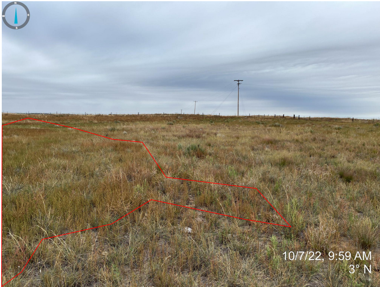
Photo 2. Facing north, see comments in Photo 1.