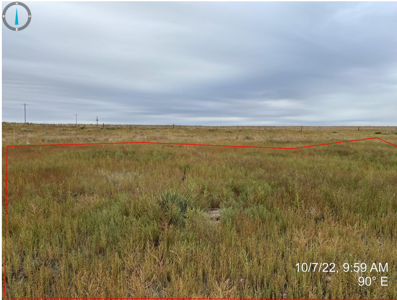
Photo 1. Taken from location, facing east. It appears final reclamation activities have occurred with no visual evidence of oil and gas equipment. Annual weedy vegetation (e.g. kochia) was observed throughout the location, outlined in red.