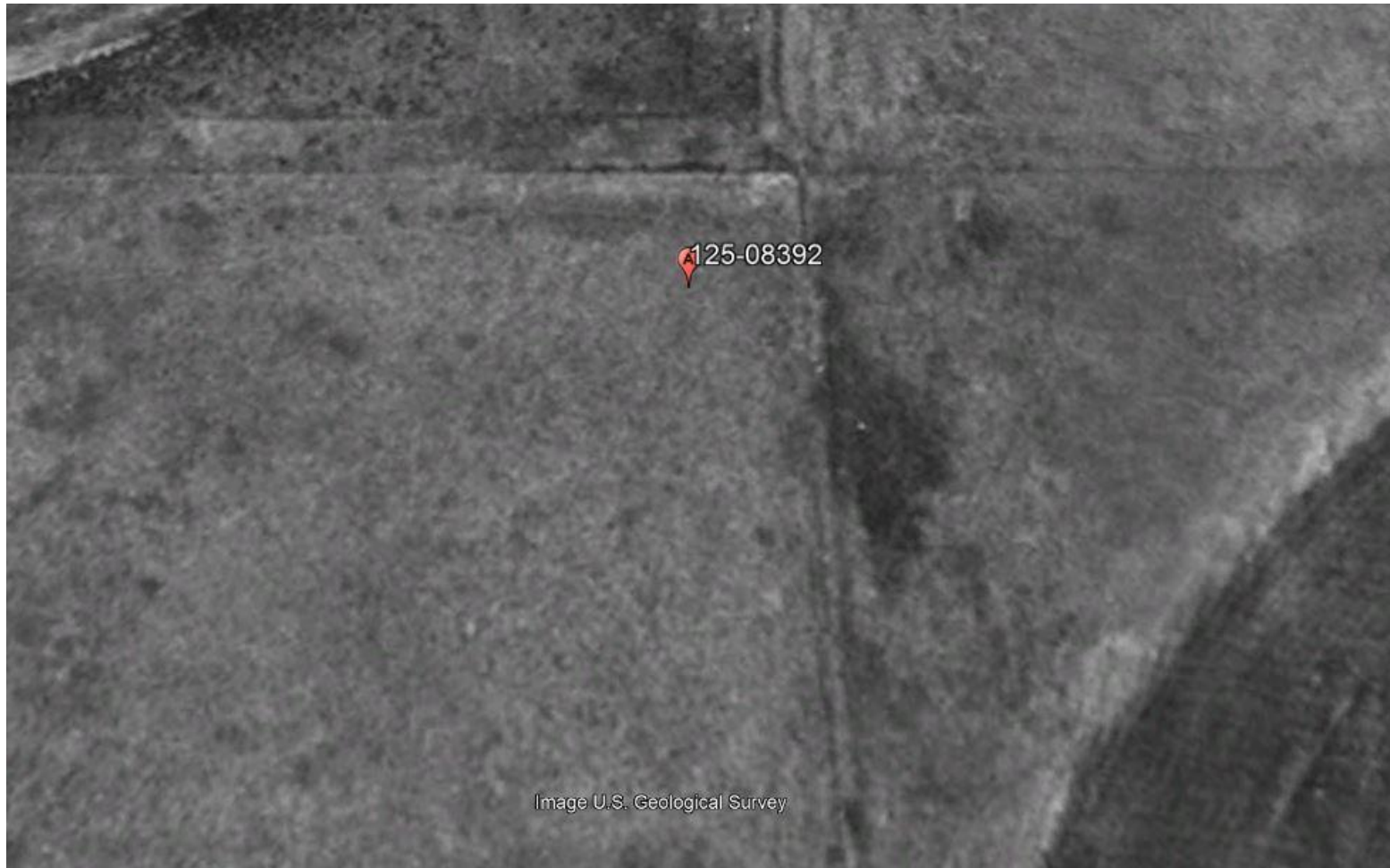
Photo 5. Aerial imagery taken from Google Earth illustrating pre-disturbance image of location, circa 1998. This is the most current imagery prior to any oil and gas development.