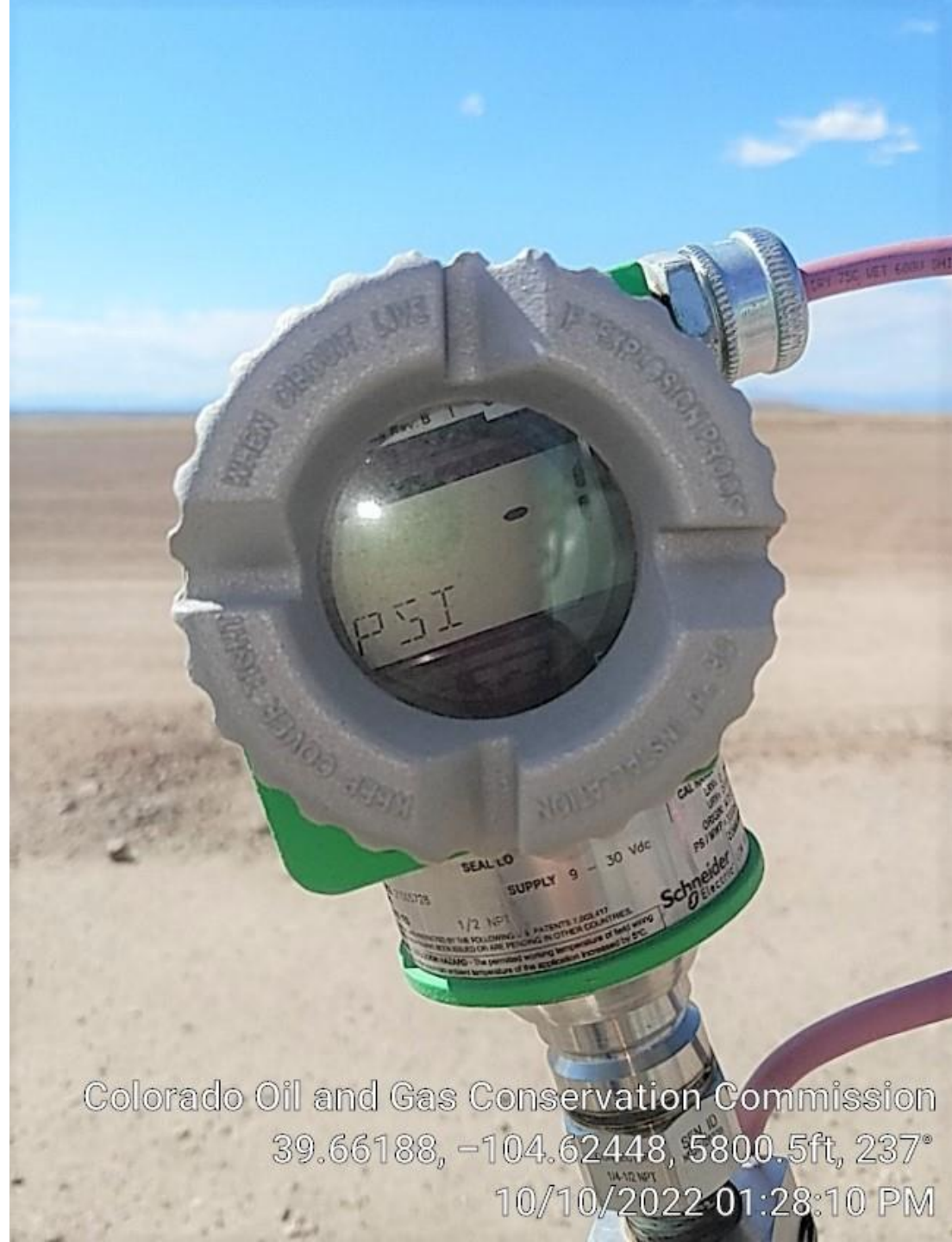
State Pikes 1BH Bradenhead -1 psi