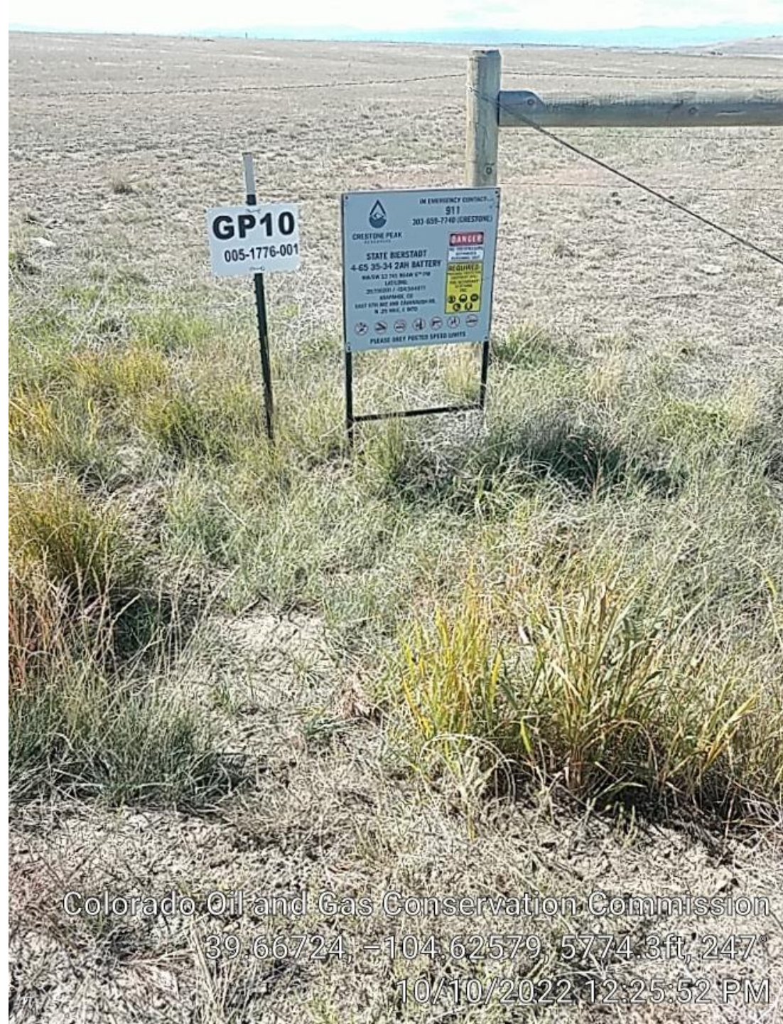
Tank Battery sign at Jewell.

Colorado Oil and Gas Conservation Commission 39.66724, -104.62579, 5774.3ft, 247° 10/10/2022 12:25:52 PM