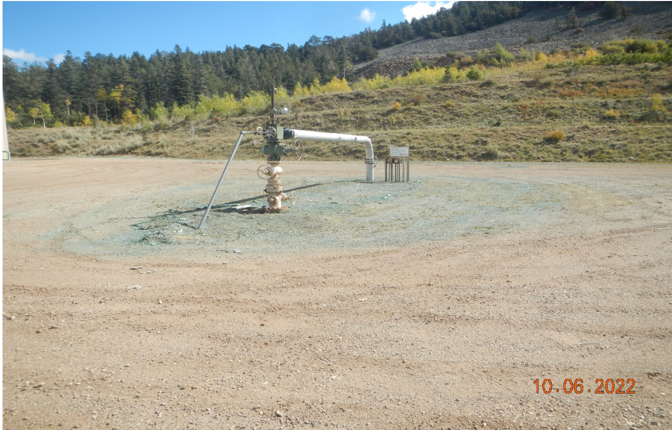
Photo 6. Facing toward the wellsite.