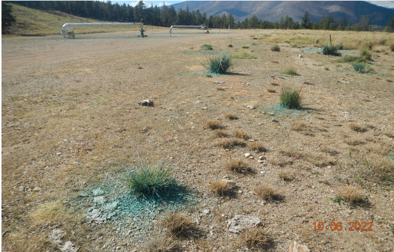
Photo 3. Facing south at the location. There is blue dye on plants from weed spraying. The plants shown however are not weeds but Basin wildrye grass. Operator should consult with contractor as to what is being sprayed.