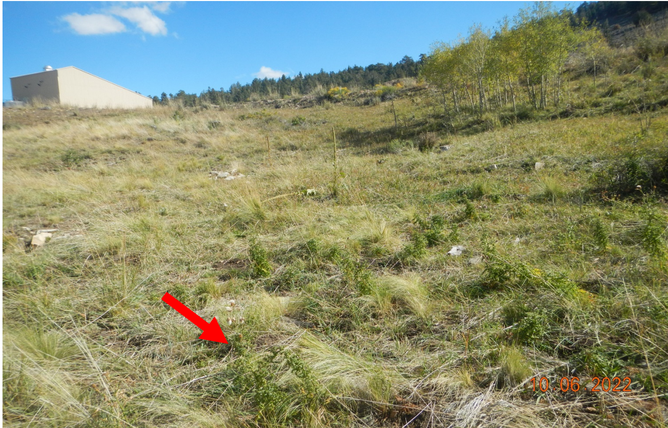
Photo 7. Facing east toward the fill slope of the location. There are noxious weeds in this area that need to be controlled. There was no blue dye observed indicating no weed control was performed. Red arrow → Canada thistle