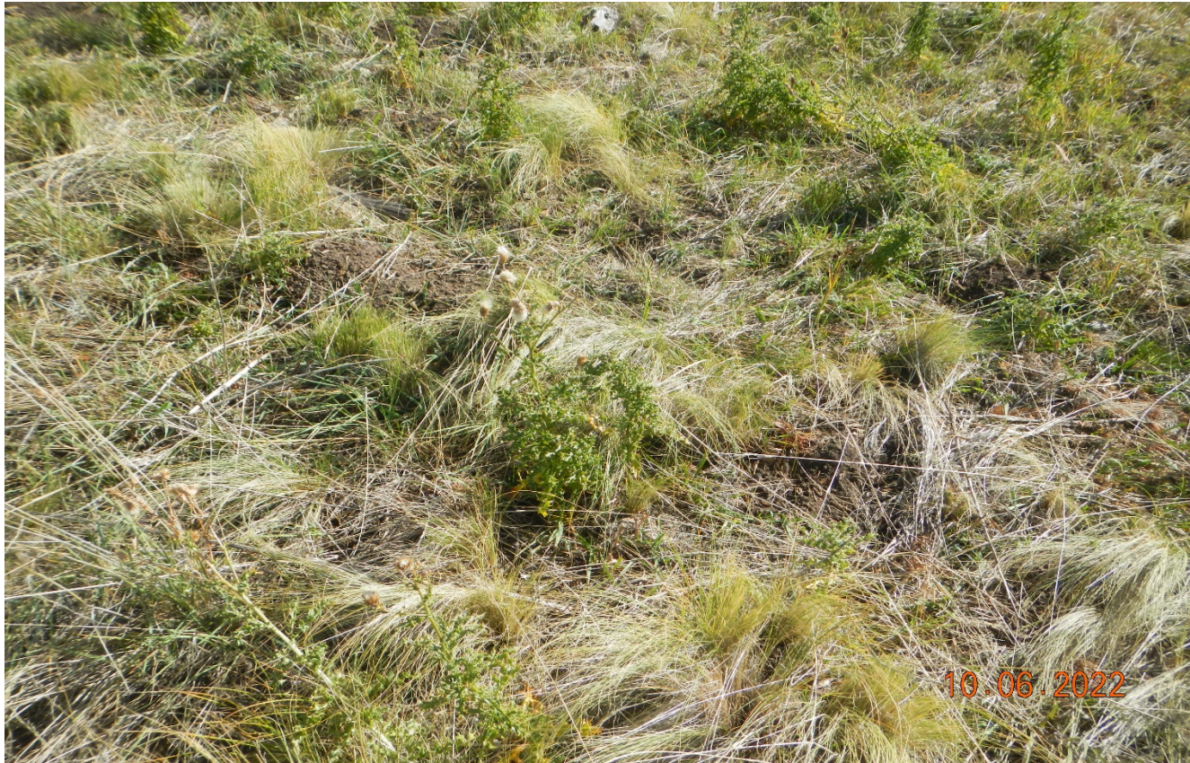
Photo 8. Canada thistle observed in previous photos has already dispersed seed.