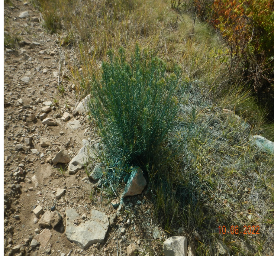
Photo 5. Blue dye observed on Rubber rabbit brush.