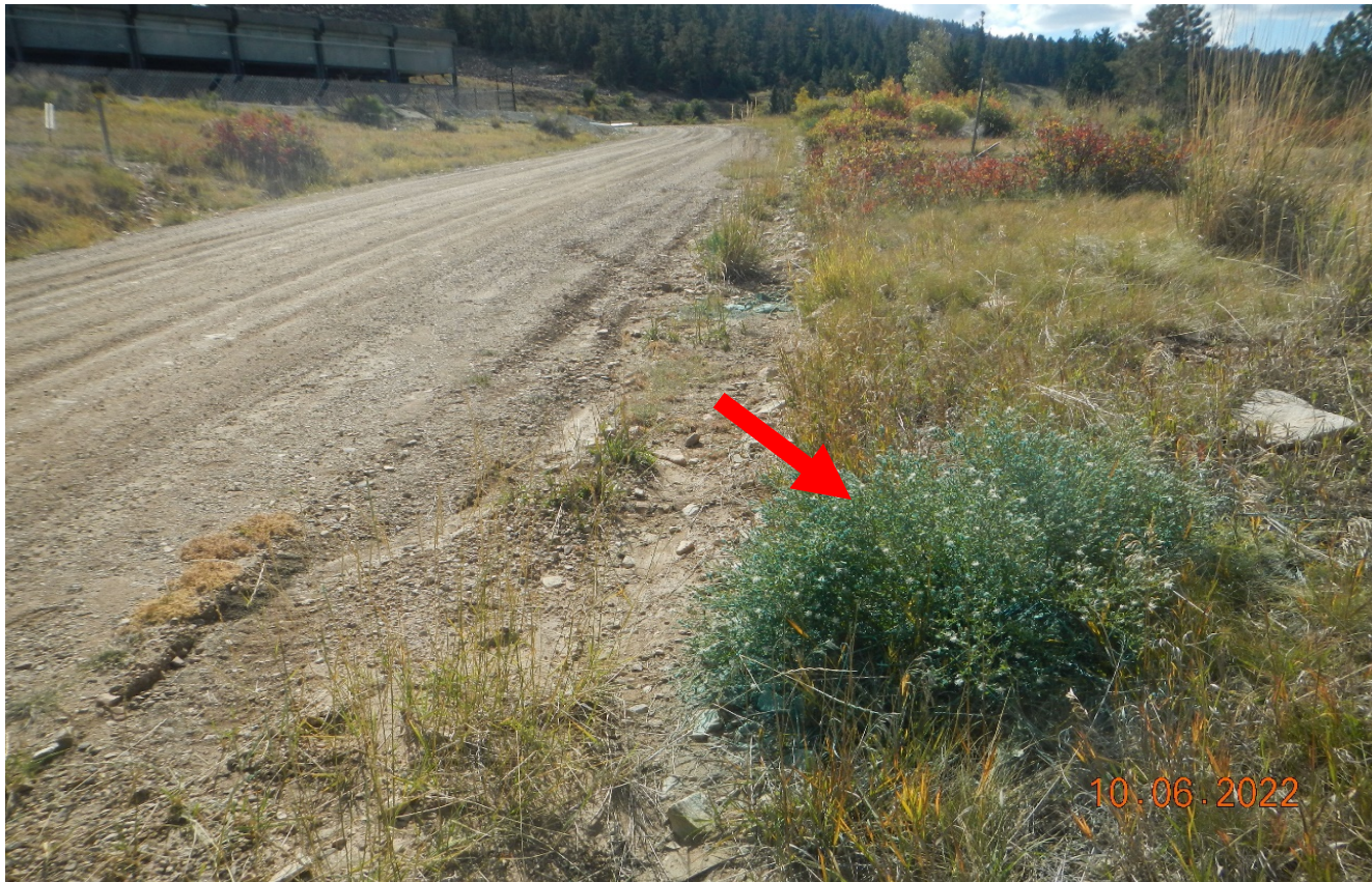
Photo 1. Facing southeast along the road near the location. Red arrow points to Diffuse knapweed which was recently spray. The knapweed has already produced seed. Weed control should be performed sooner before seed dispersal.