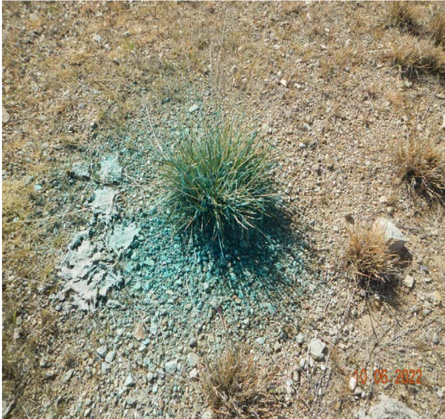
Photo 4. Blue dye observed on native grass.