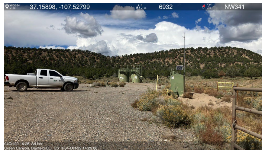
IMG 02 Location overview