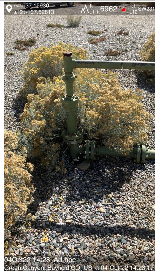
IMG 10 Weeds at wellhead