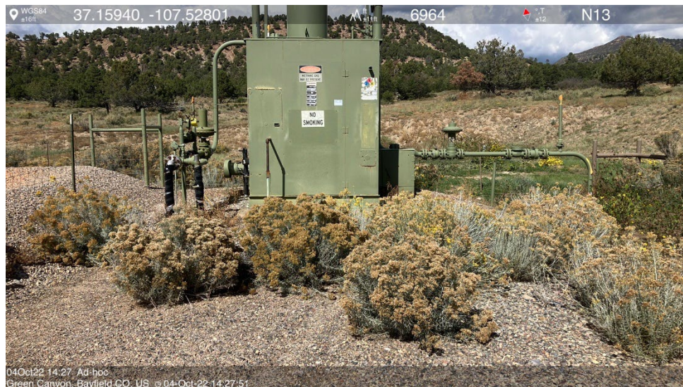
IMG 09 Weeds at separator