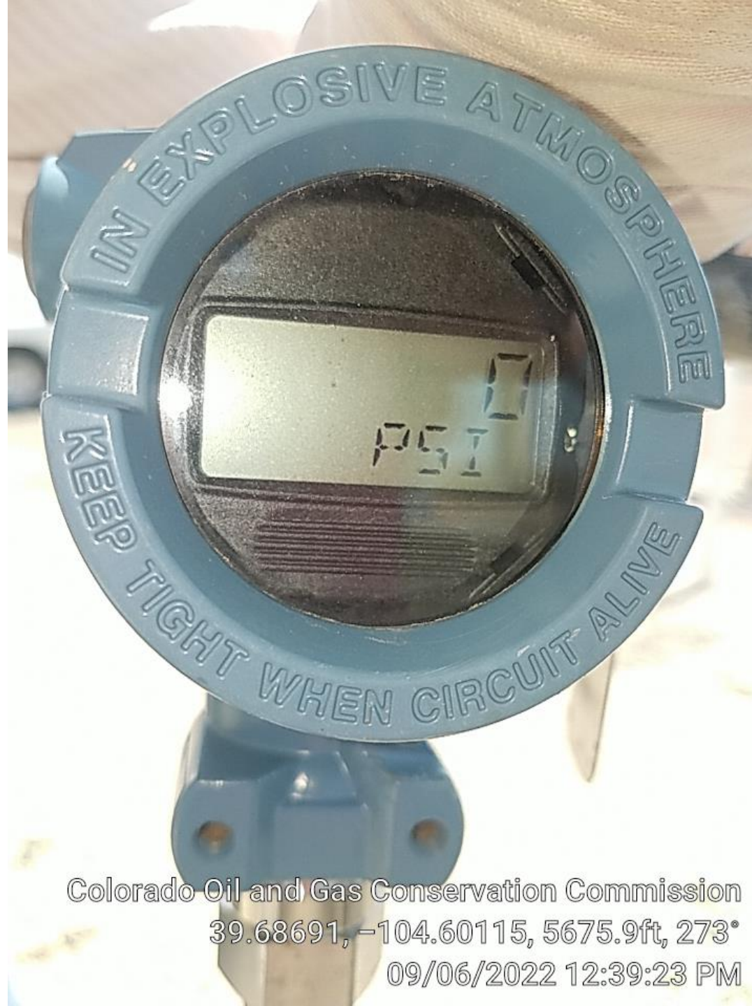
Lussing Trust 3D3H bradenhead 0 psi.

Colorado Oil and Gas Conservation Commission 39.68691, -104.60115, 5675.9ft, 273° 09/06/2022 12:39:23 PM