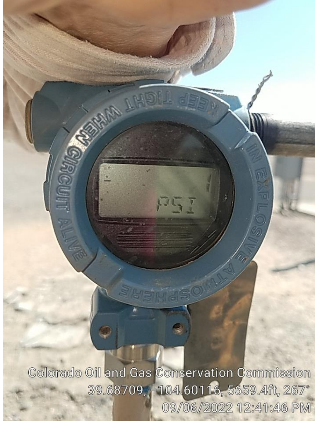
Lussing Trust 3D1H bradenhead -1 psi.

Colorado Oil and Gas Conservation Commission 39.68709, -104.60116, 5659.4ft, 267° 09/06/2022 12:41:46 PM