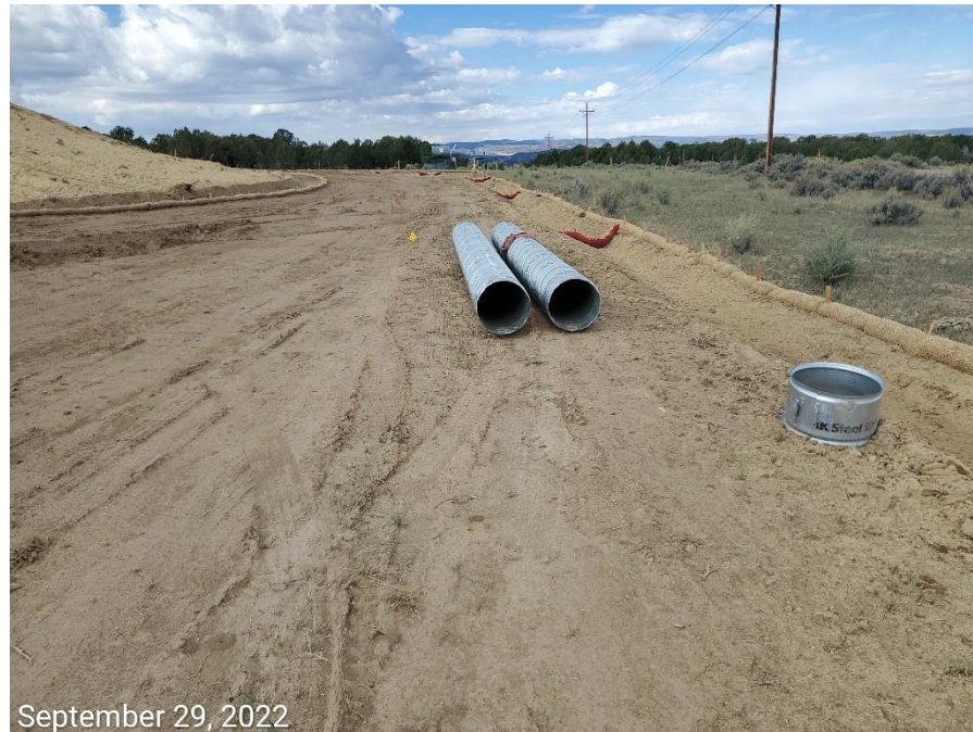
Photo 6: Photos show northwestern location entrance. Entrance not yet constructed, and culvert BMPs not yet installed.