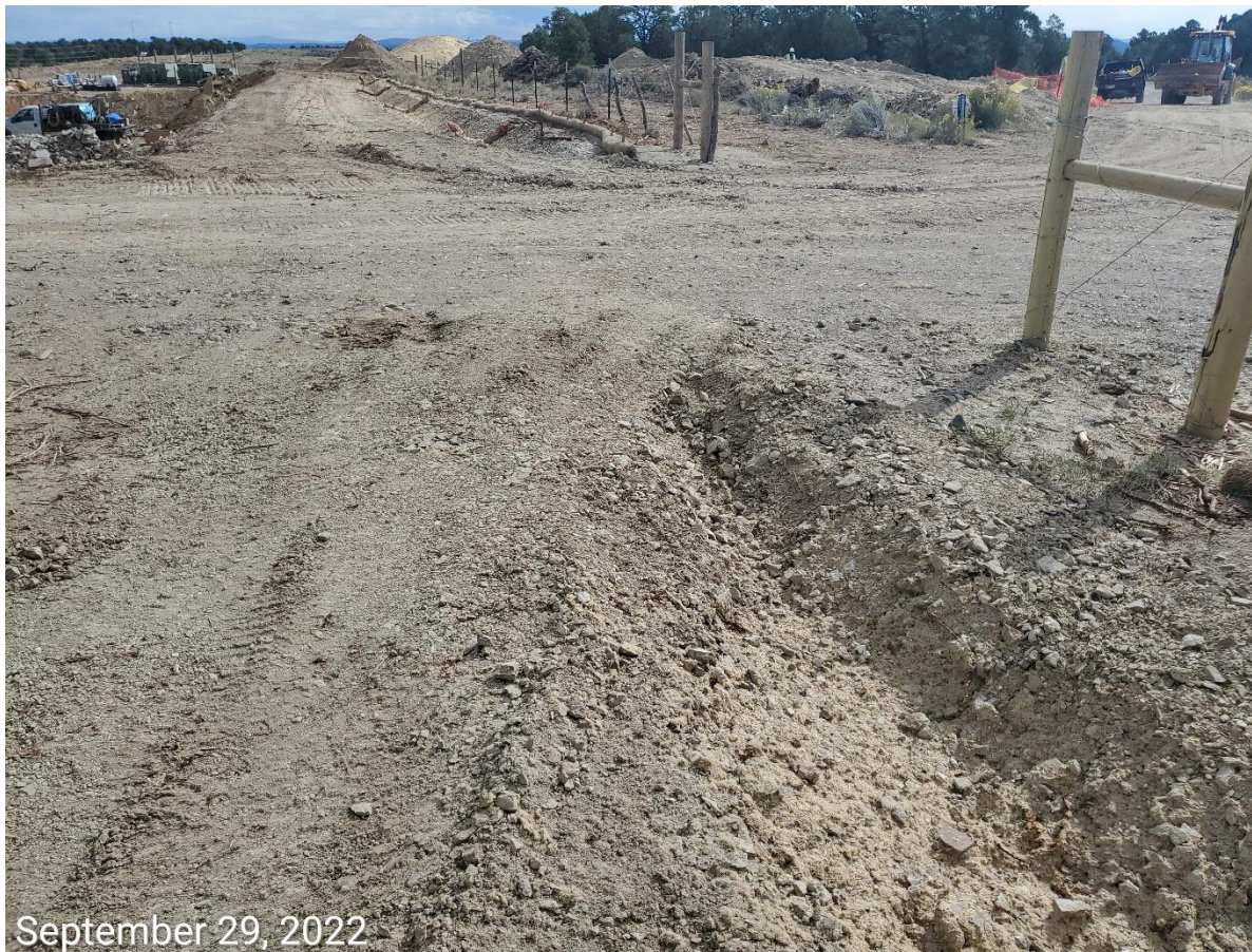
Photo 4: Photo shows southern location entrance. BMPs such as a culvert, have not been installed at this entrance. SWMP #402895189 does not identify that a culvert will be installed at this entrance. Topography within area may not warrant need for a culvert at this entrance.