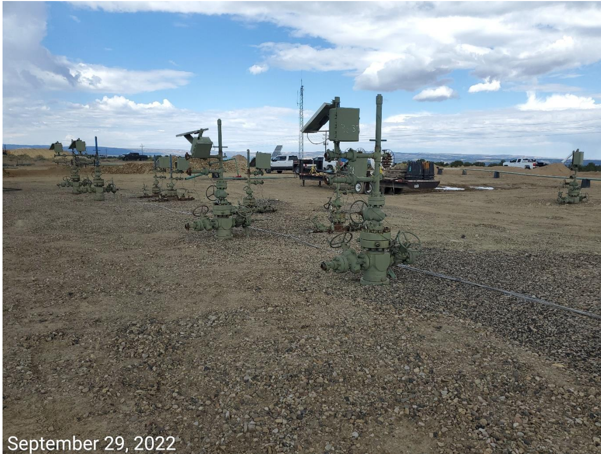
Photo 21: Photo shows permanent signage missing from the wells on the Location.