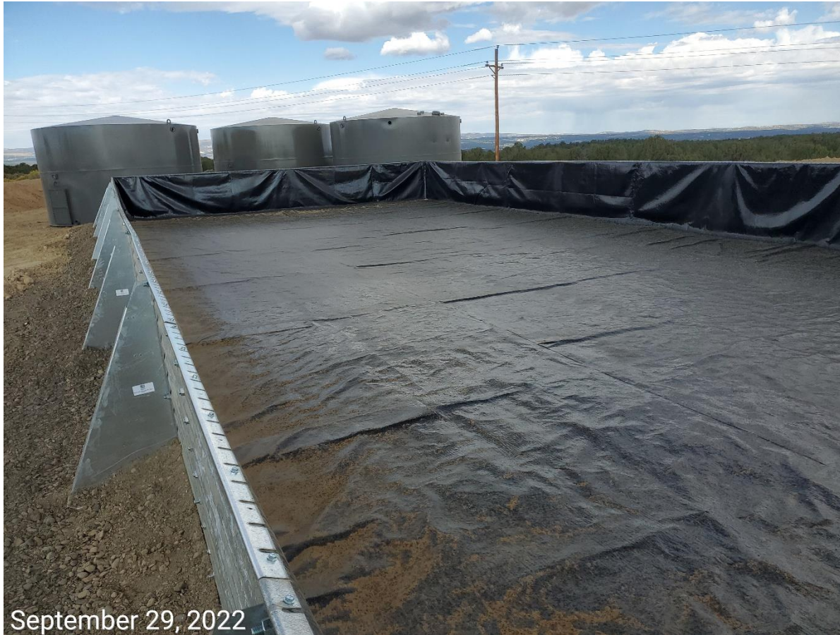
Photo 22: Photo shows tank facility being installed on the northeast end of the Location.