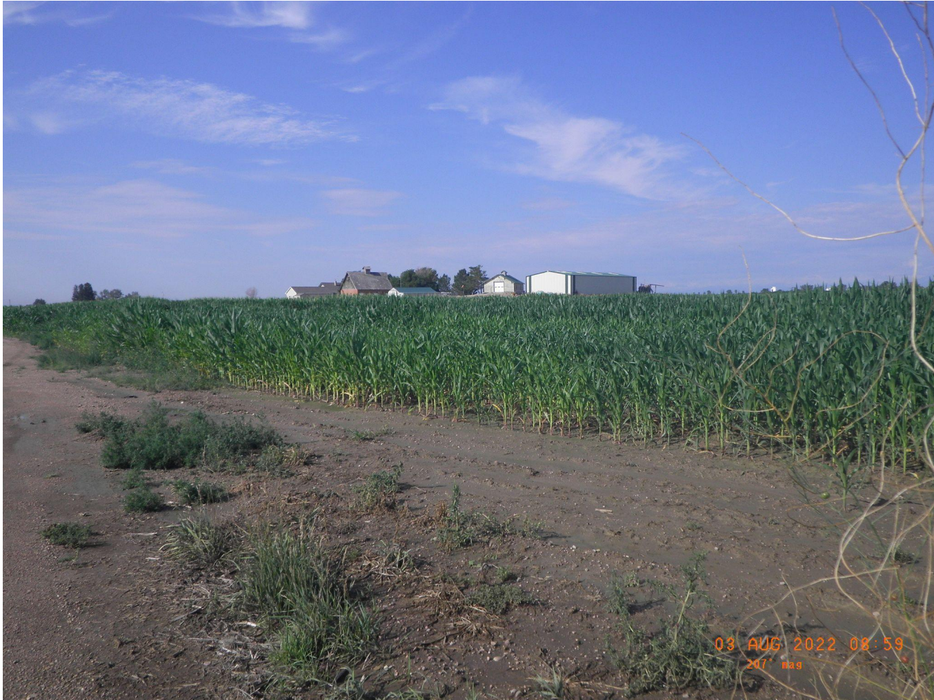
Photo 3. Overview photo of the tank battery taken at ground level from the western edge facing east.